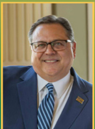
MAYOR PAUL PERNEREWSKI