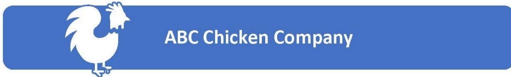
Table 2-5. Sample PFS for a commercial meat/meat alternate product

School Nutrition Programs or section 6 of the CSDE’s guide, Meeting the Whole Grain-rich Requirement for the NSLP and SBP Meal Patterns for Grades K-12 .