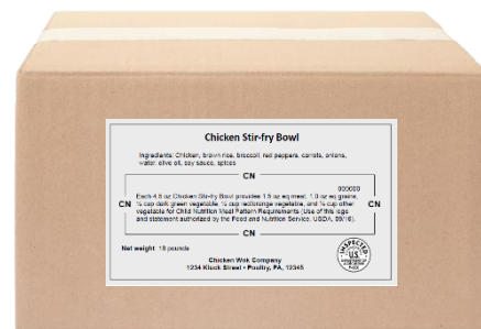
Table 2-4 shows an example of a CN label and the required components. For detailed guidance, refer to “Module 6: Meal Pattern Documentation” of the CSDE’s training program, What’s in a Meal: National School Lunch Program and School Breakfast Program Meal Patterns for Grades K-12 .