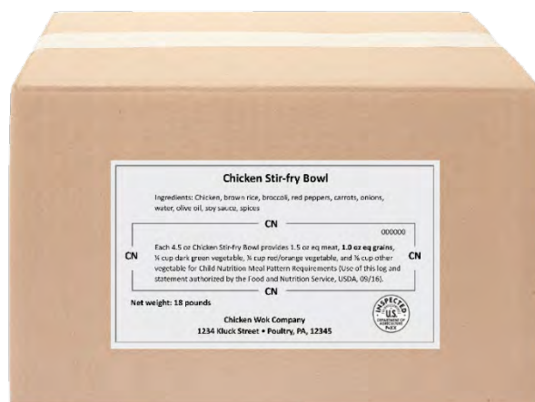
Figure 6-1 shows an example of a CN label and the required elements. For training on CN labels, refer to Module 6: Meal Pattern Documentation of the CSDE’s training program, What’s in a Meal: National School Lunch Program and School Breakfast Program Meal Patterns for Grades K-12 .