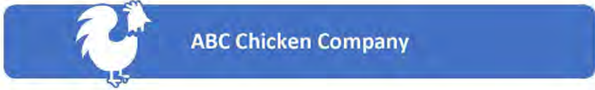
Figure 7-1. Sample PFS for a commercial MMA product