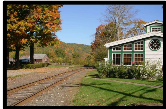
NEW MILFORD SECONDARY LINE, KENT