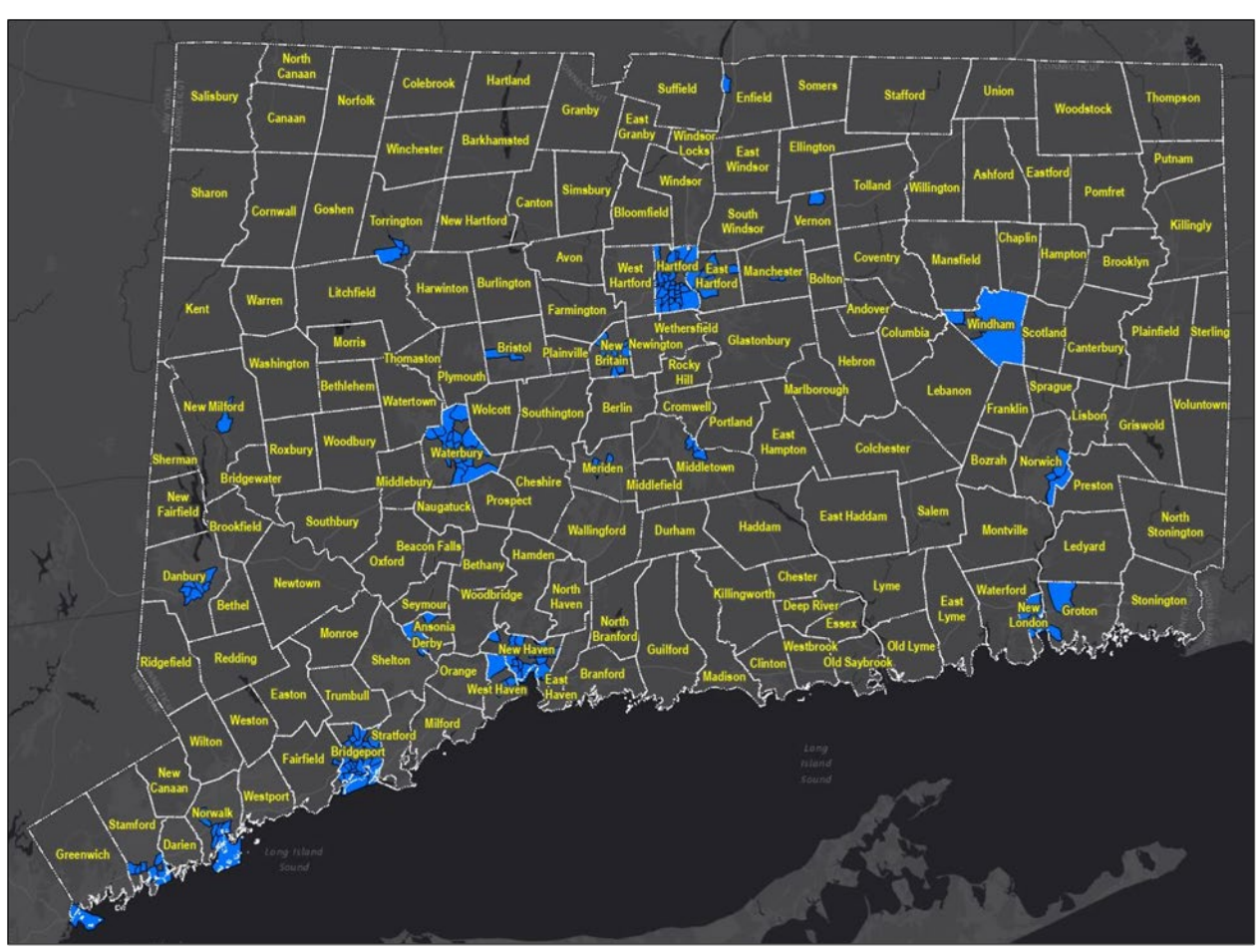
Connecticut Towns and the Justice40 Tracts