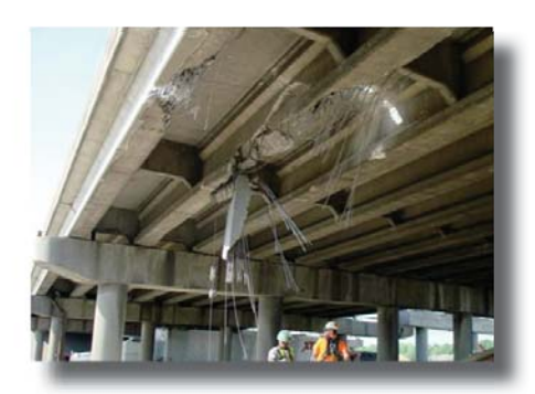
Vertical Underclearance less than current standards