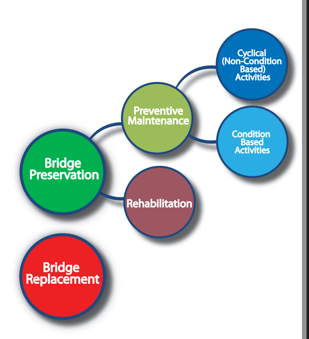
Figure 1 – Bridge Action Categories