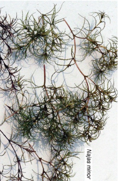
Brittle water nymph ( Najas minor )