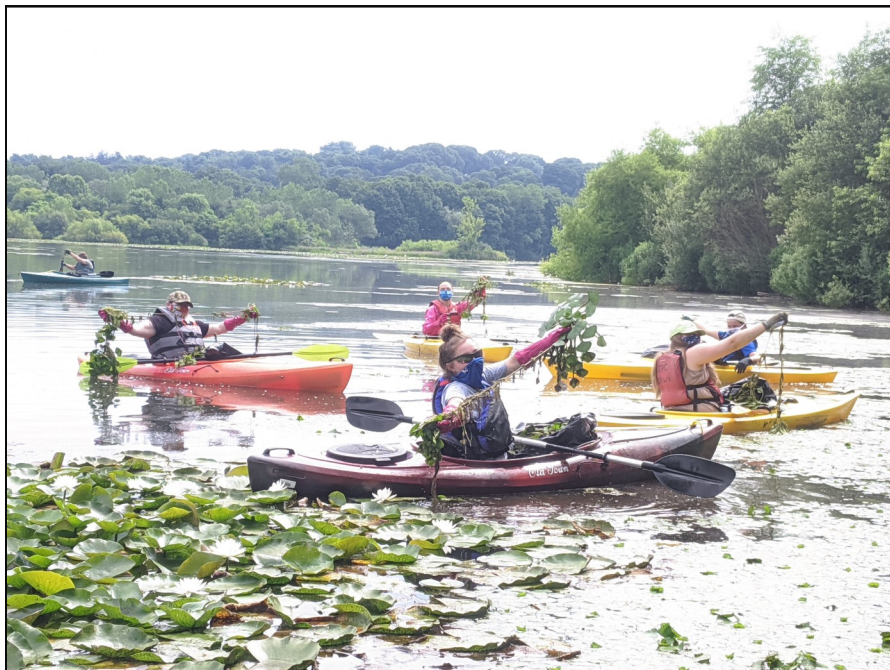
Water chestnut, an aquatic invasive plant, can quickly take over an area.