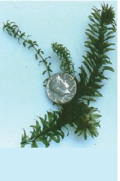
Egeria/"Brazilian Elodea" ( Egeria densa )