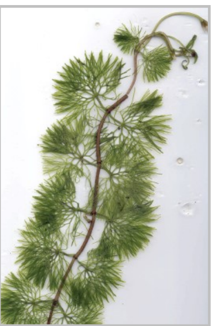
Fanwort ( Cabomba caroliniana )