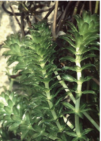
Hydrilla ( hydrilla verticillata )