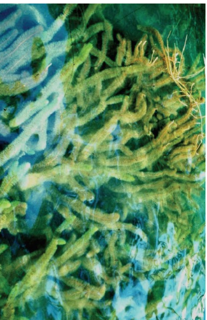
Variable-Leaf Water-Milfoil ( Myriophyllum heterophyllum )