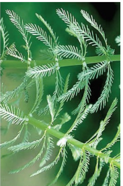
Parrotfeather ( Myriophyllum aquaticum )