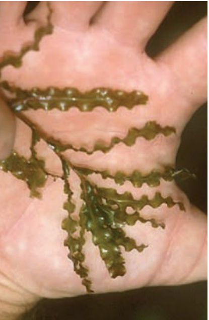
Curly Leaf Pondweed ( Potamogeton crispus )