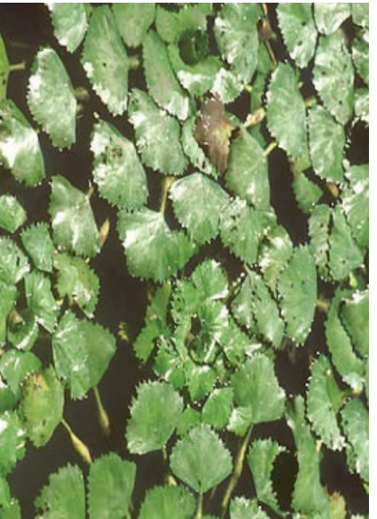
Water Chestnut ( Trapa natans )