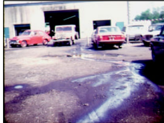
Shop wastewater directed outside is an illegal discharge.

Vehicle maintenance wastewater is floor washdown and incidental drippage from vehicles as a result of routine servicing operations, washing vehicle exteriors or steam cleaning engines, or vehicle dismantling or crushing. It may contain chemicals such as oils, degreasers, gasoline, diesel fuel, detergents, heavy metals and antifreeze. In some instances it may contain solvents. If discharged through a dry well or septic system to the ground, these chemicals may render drinking water supplies unfit for human consumption. If discharged directly or indirectly to surface water these chemicals can be toxic to fish and other aquatic life.