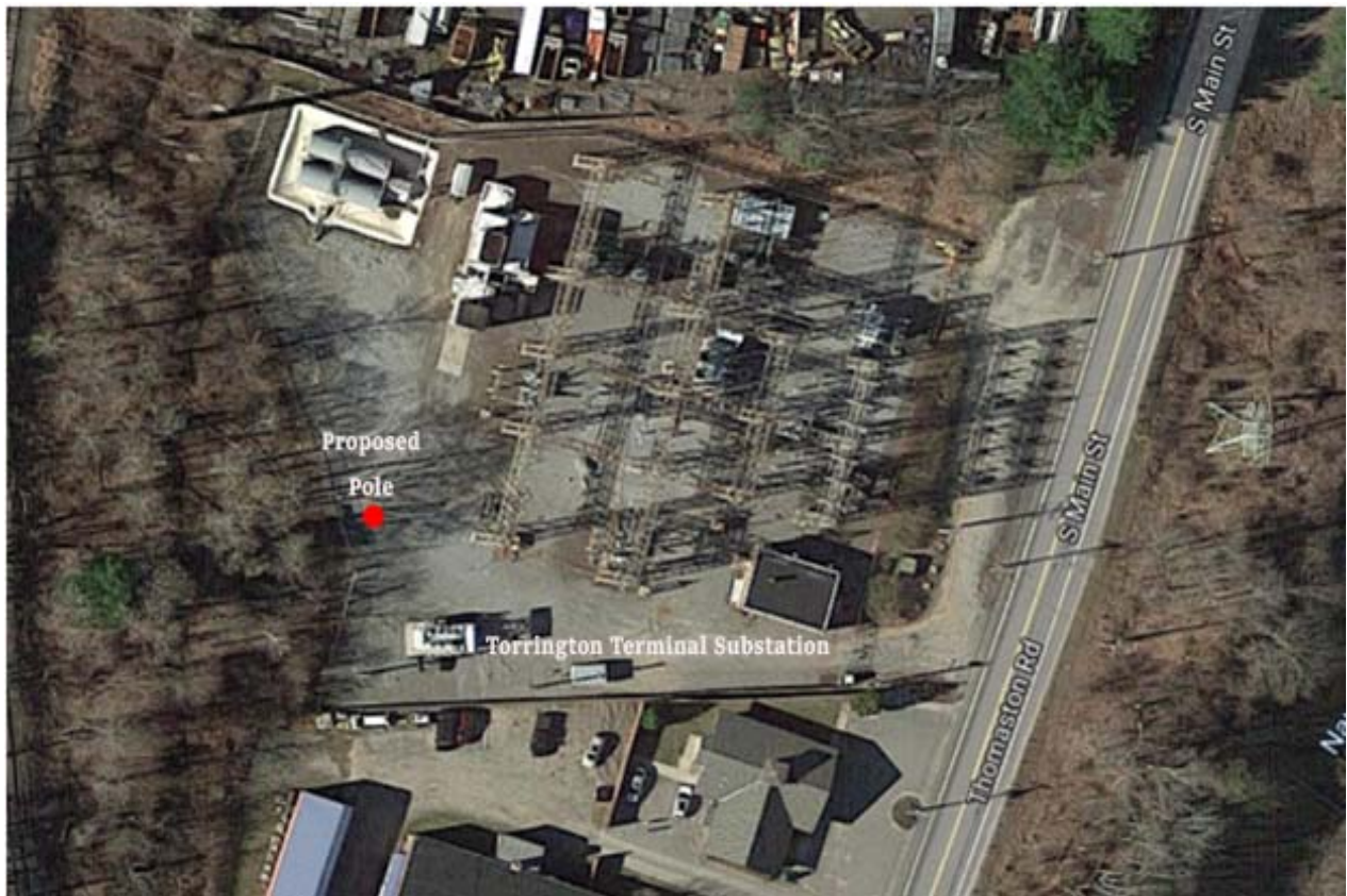
Figure 1 - Torrington Substation Pole Proposed Location

The proposed modification would not have a substantial adverse environmental effect or cause a significant adverse change or alteration in the physical or environmental characteristics of the Substation because: