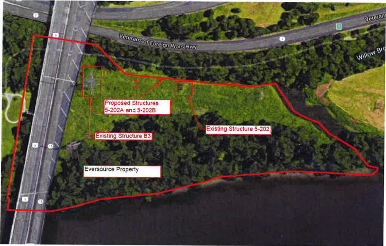
Figure 1 Aerial – Locations of Existing and Proposed Structures

The Project would not have a substantial adverse environmental effect or cause a significant adverse change or alteration in the physical or environmental characteristics of the existing facility because: