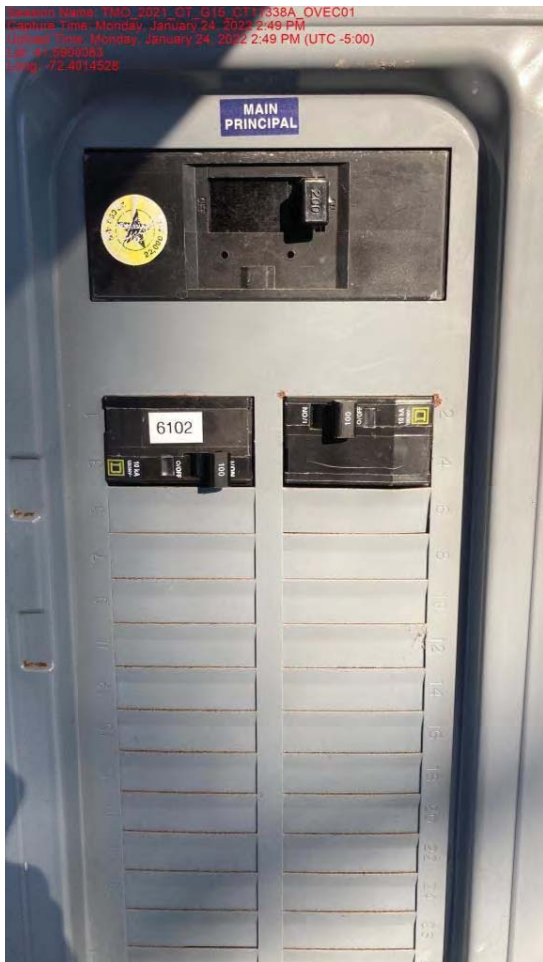
Existing Electrical Service Used For Upgrade