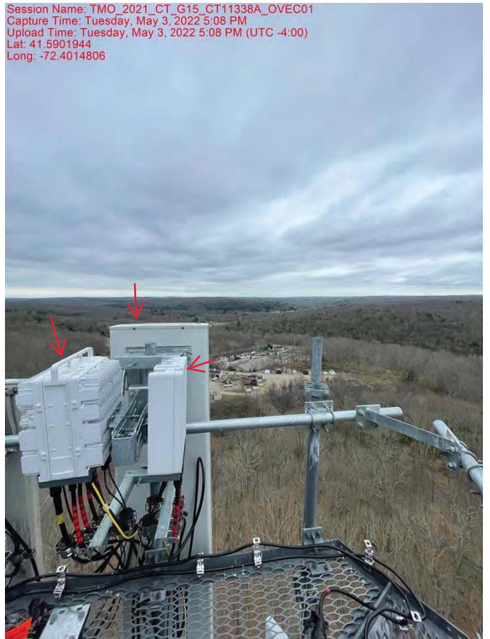
Alpha Sector: (1) New Antenna & (2) New RRHs Mounted To The Modified Platform