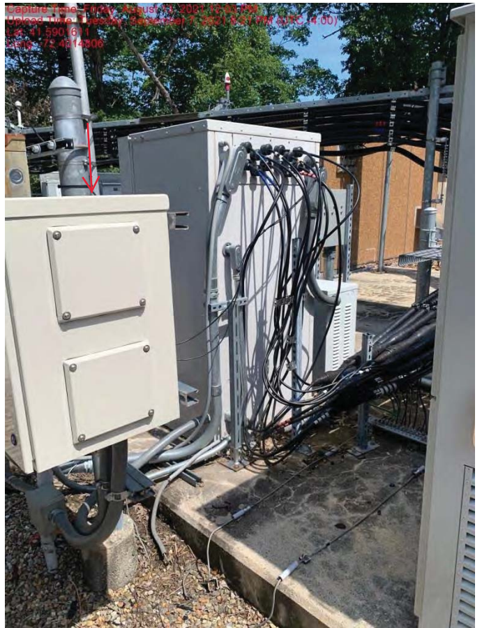
New Purcell Cabinet Installed On Existing H-Frame