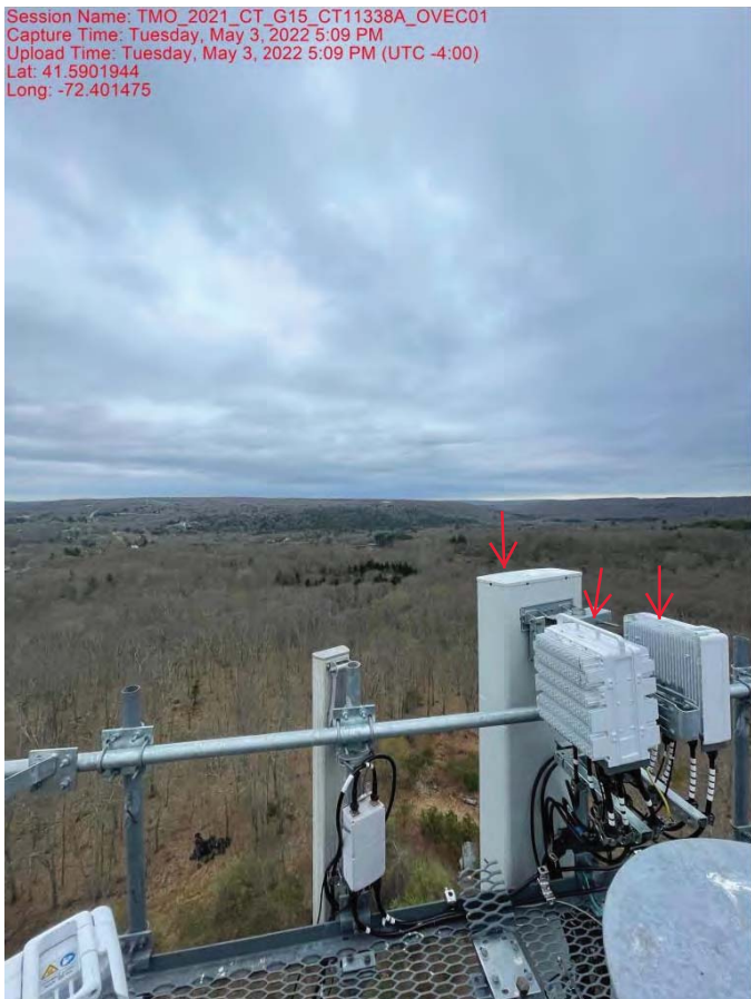
Beta Sector: (1) New Antenna & (2) New RRHs Mounted To The Modified Platform