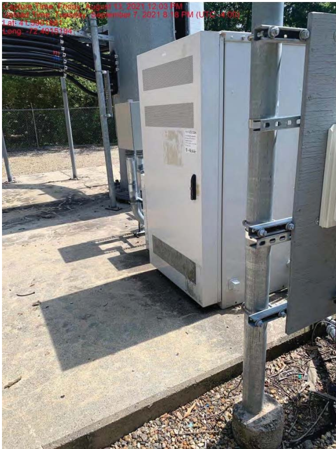
Existing T-Mobile Equipment Mounted To Concrete Pad