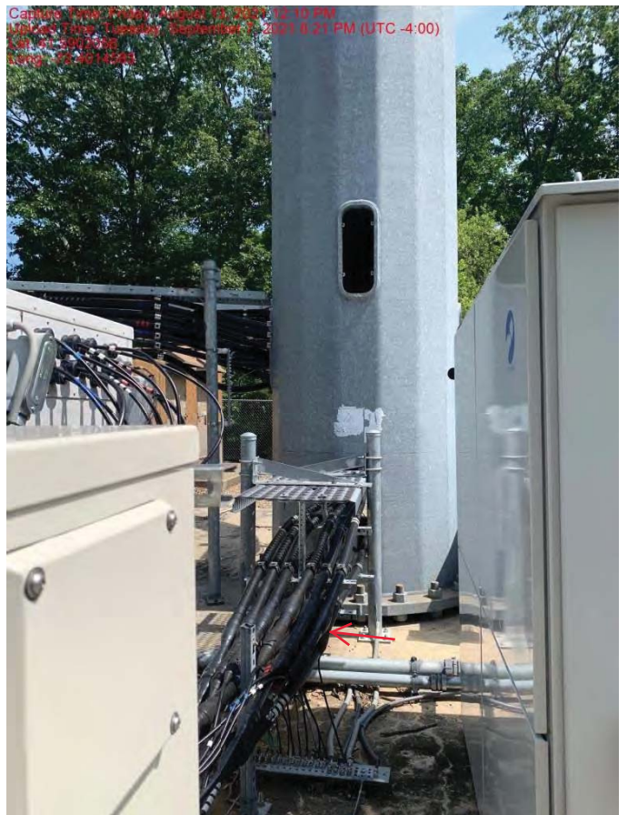
New Signal Cables Run Along Existing Cable Path