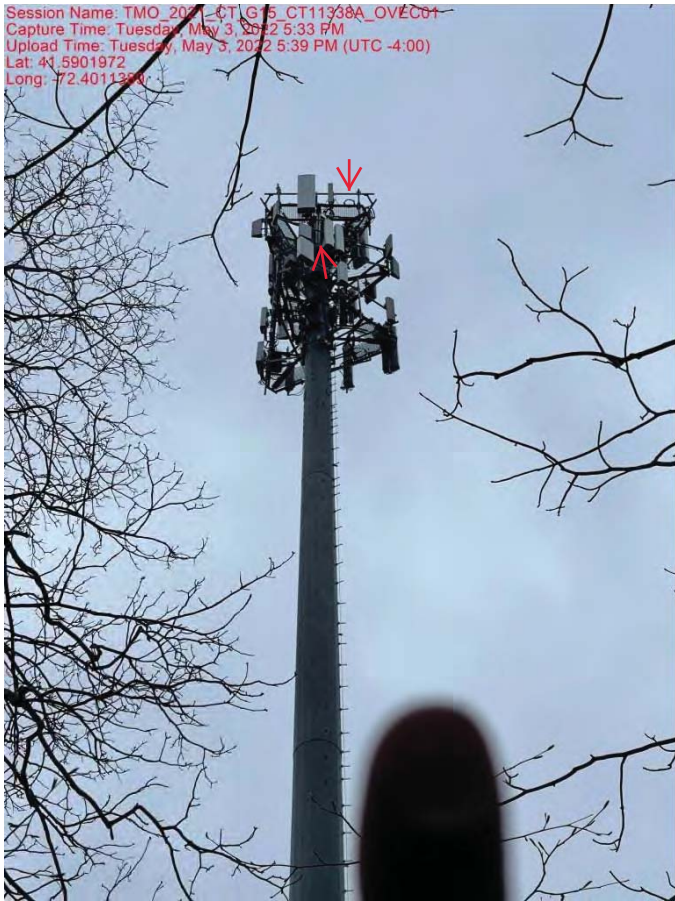
New Handrail & Reinforcement Kits Installed On Existing Mounting Platform