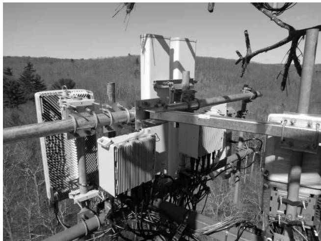
Fig. 3: Overall View of Antennas, RRHs & OVP in Gamma Sector

2595 North Dallas Parkway Suite 300, Frisco, TX 75034