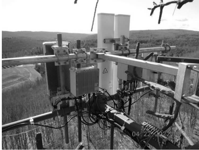
Fig. 2: Overall View of Antennas, RRHs & OVP in Beta Sector

Accelerating Network and Business Transformation