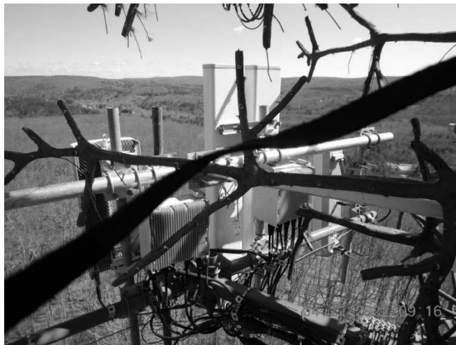
Fig. 1: Overall View of Antennas, RRHs & OVP in Alpha Sector