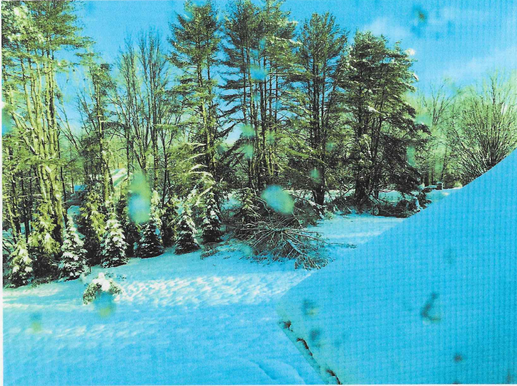
Exhibit 1, view from Sosnick Master Bedroom