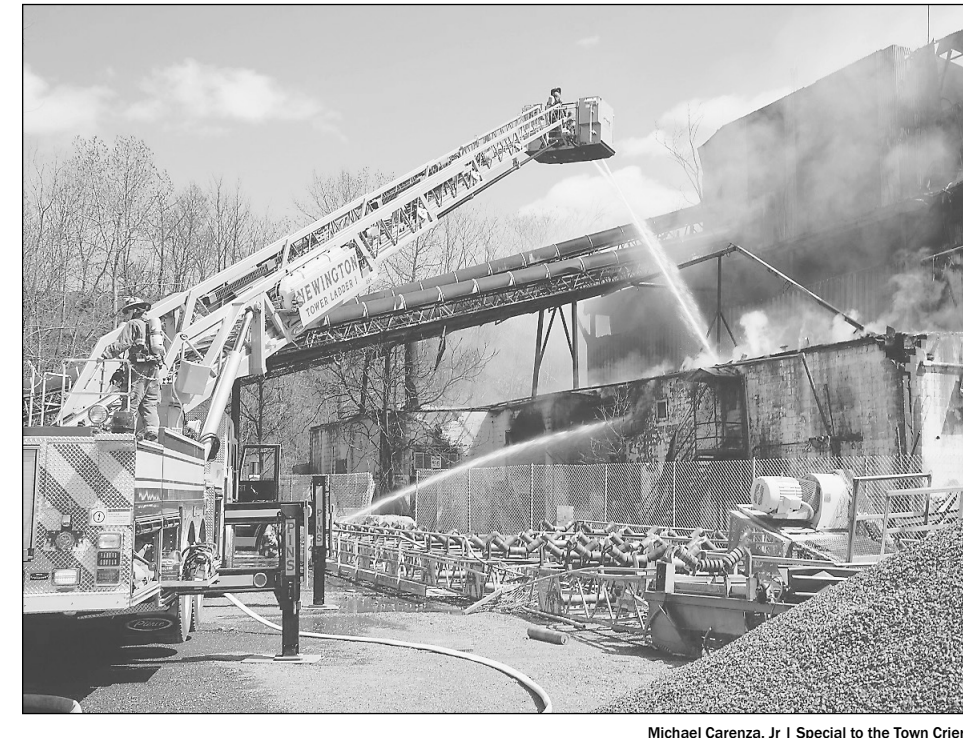
Newington firefighters battle a blaze at the Capitol Pipe building last week.

With the closest fire hydrant on Hartford Avenue, firefighters had to connect a five-inch hose to a pumper truck that connected to a fire apparatus to battle the blaze from the outside. In all firefighters ran 3,600 feet of hose to spray water on the building and brought in tanker trucks from East Farmington and Tunxis Hose fire departments to assist in the effort.