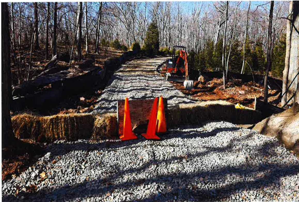
Photo 2: View of construction entrance with turtle blockage established.