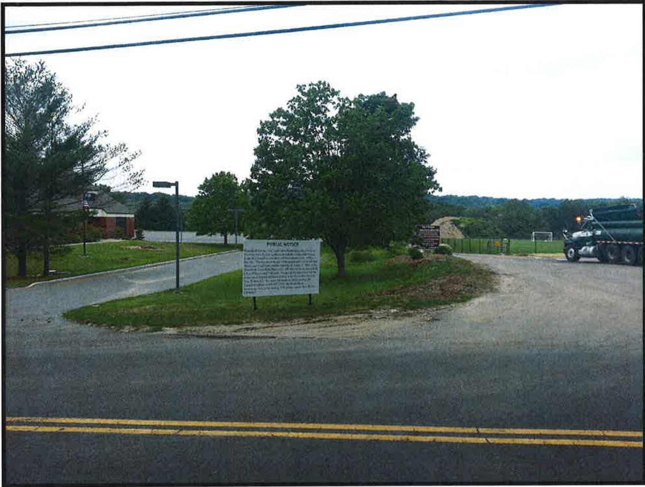
View looking west towards public notice sign posted at entrance to proposed facility.