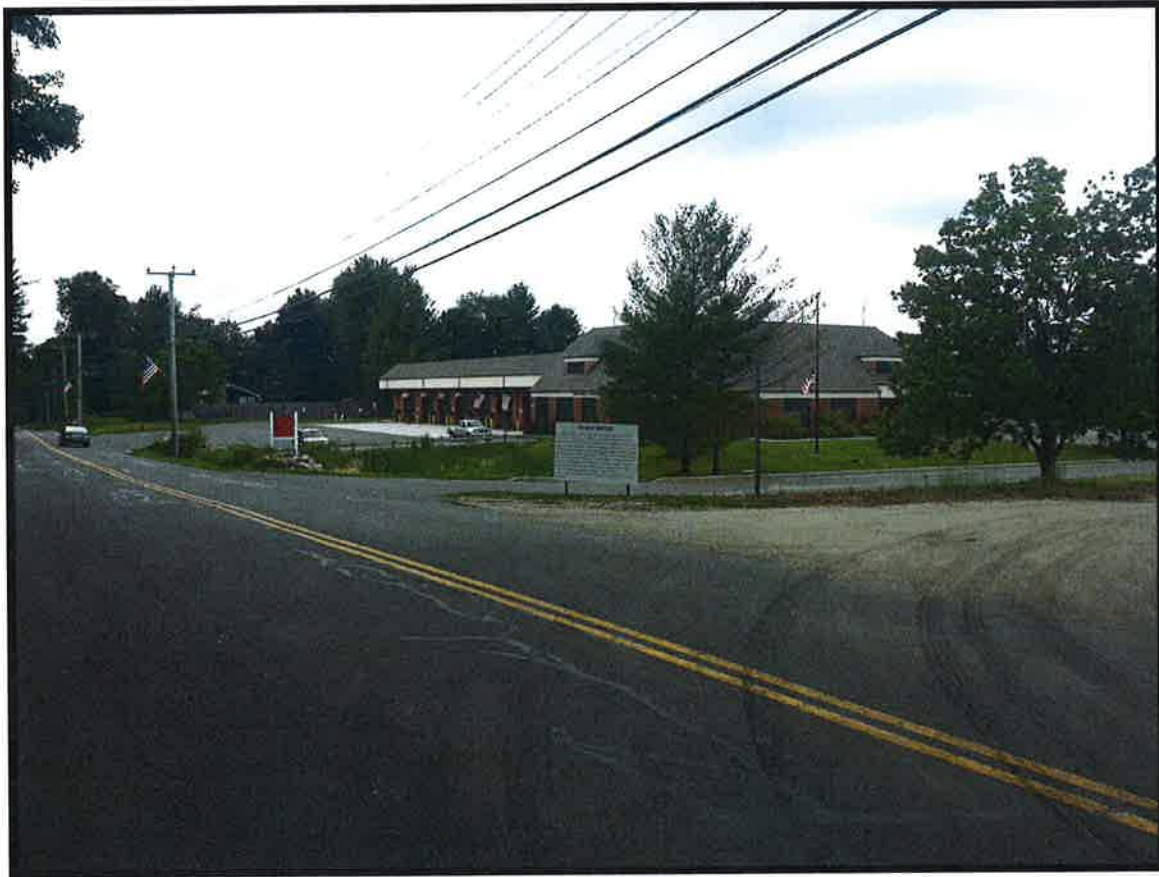
View of public notice sign looking southwest from Pocono Rd.