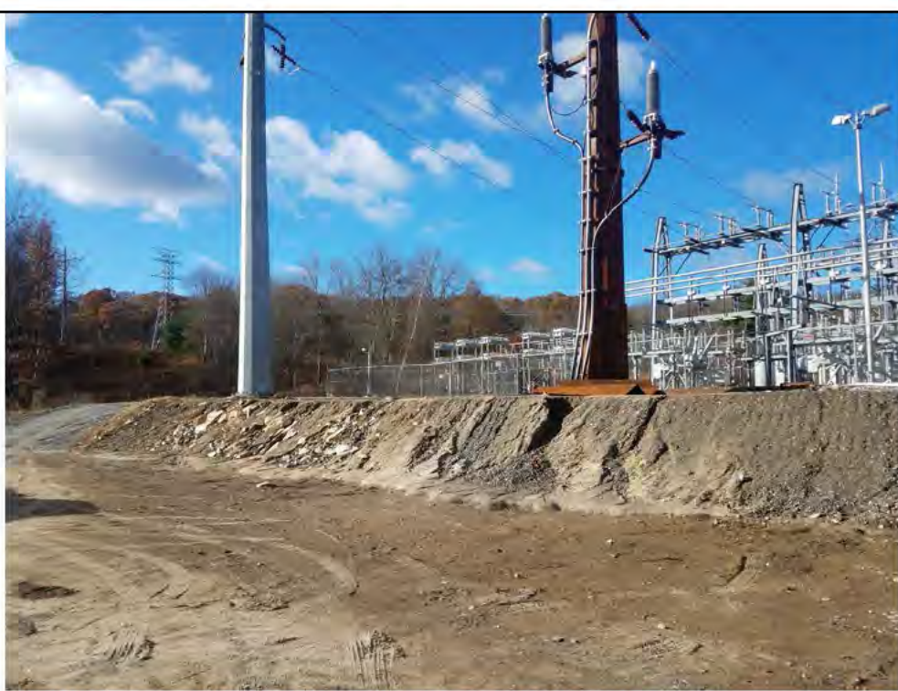
Photo 10: 11/17/2017, Watertown: Map 01, Str1A, rill erosion and sedimentation down gradient of work pad.