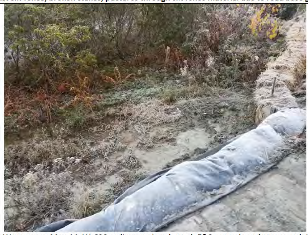
Photo 6: 11/09/17, Watertown: Map 14, W-C20 sedimentation through E&S controls and excess sedeiment buildup on timber mat crossing due to poor upland access road conditions.