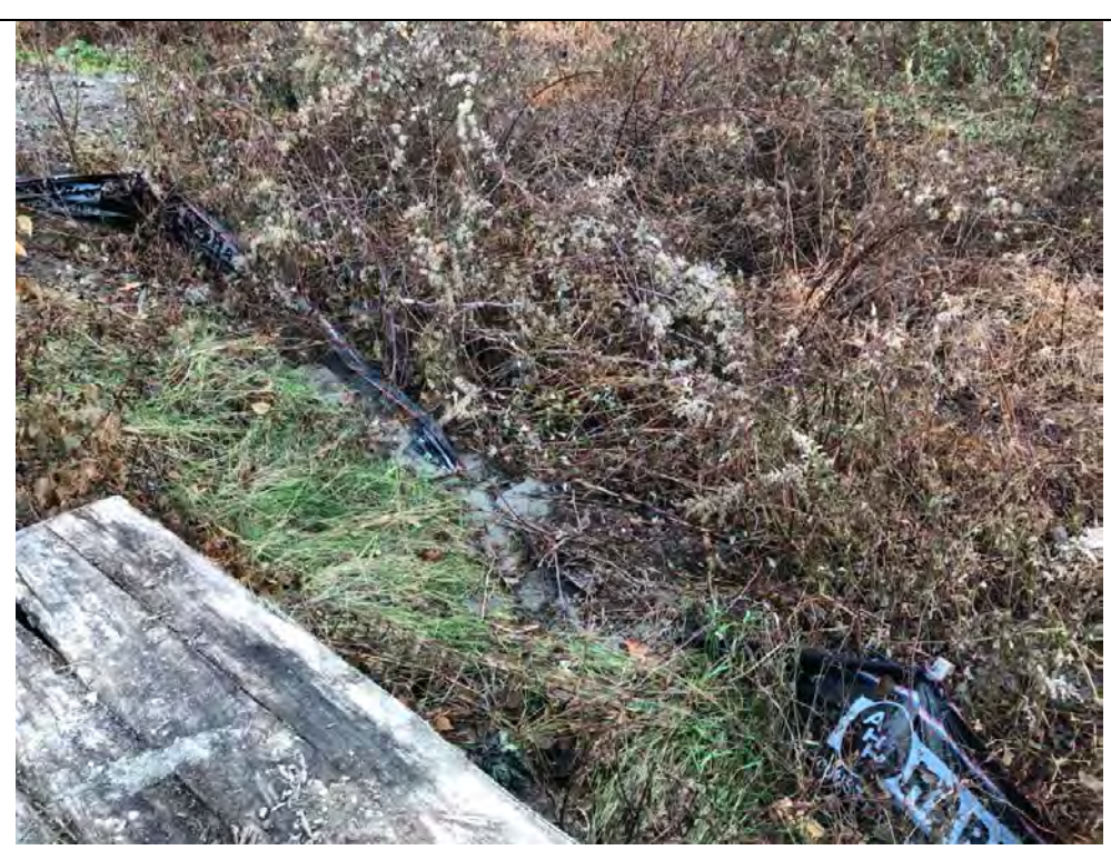
Photo 8: 11/17/2017, Watertown: Map 09, Str23, damaged silt fence.