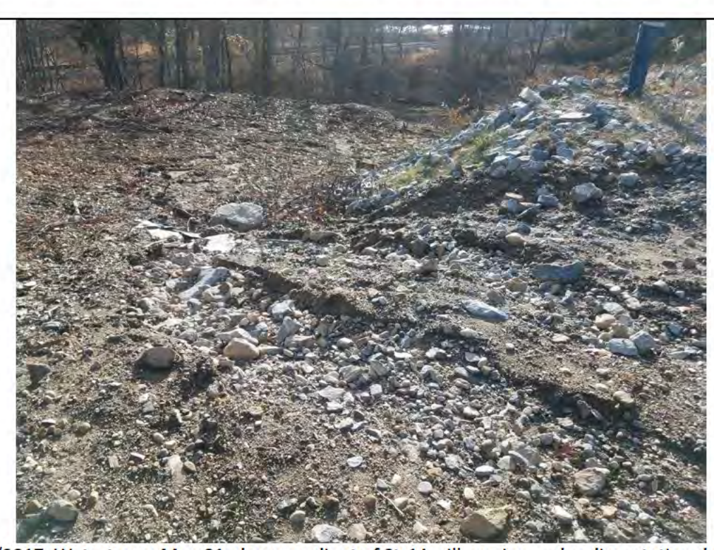
Photo 11: 11/17/2017, Watertown: Map 01, down gradient of Str1A, rill erosion and sedimentation down gradient to the east toward the Connecticut Wetland Only designated area.