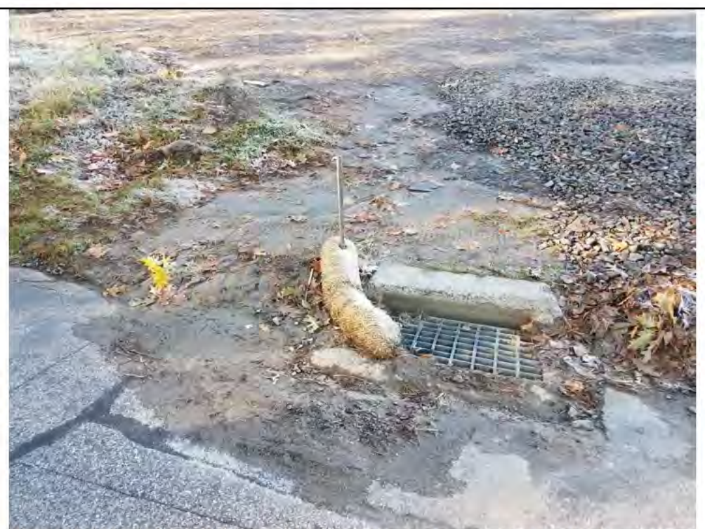
Photo 7: 11/09/17, Litchfield: Map 29, catch basin at Str81 west side of Campville Road, sediment movement from surface water runoff impacting catch basin and public access roadway.