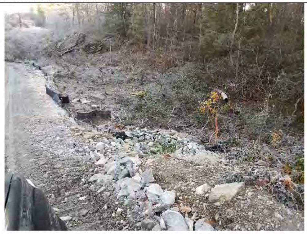
Photo 4:11/09/17, Watertown: Map 12, south of Str34, non-compliant silt fence conditions, sedimentation through E&S controls, road base materials exceeding height limits (structural) of silt fence, punctures through silt fence material due to road base gravel.