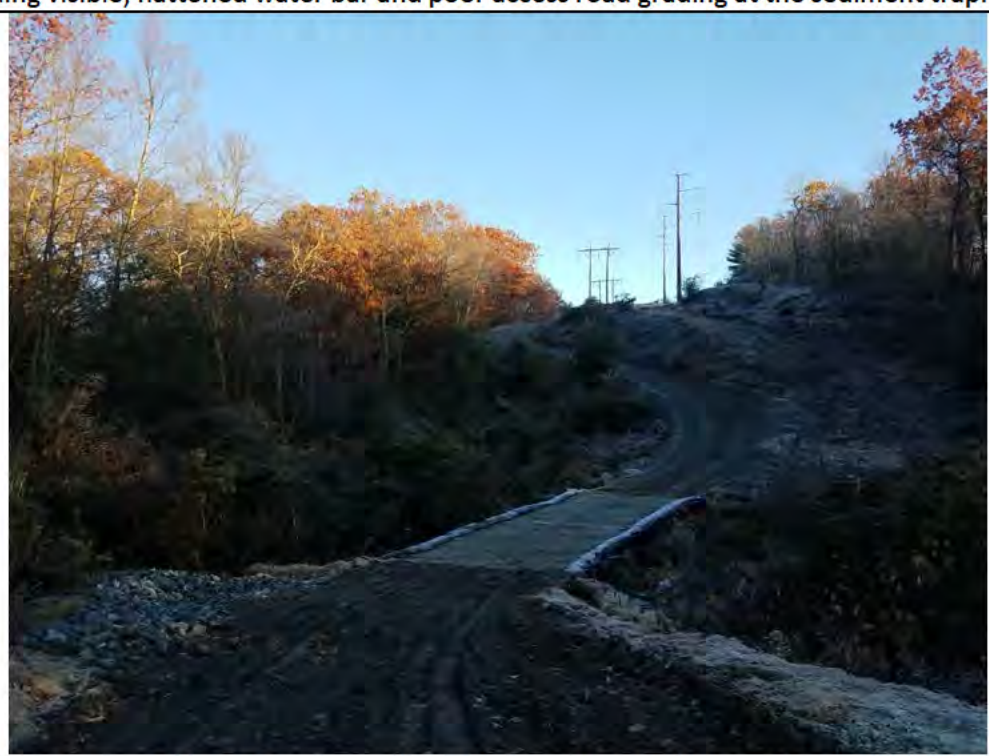
Photo 2: 11/09/17, Watertown: Map 14, access road conditions at W-C20, flattened water bar, visible tire rutting, poor access road grading at the sediment trap.