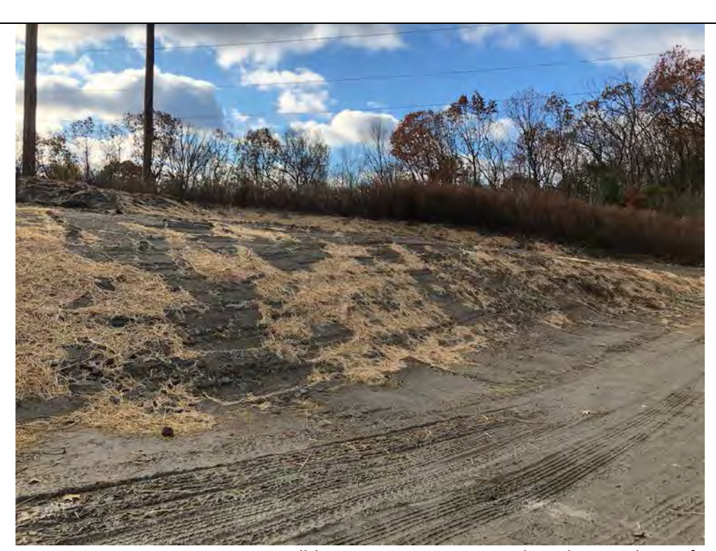
Photo 9: 11/17/2017, Watertown: Map 02, Str4, windblown straw covering seed on slope and top of pad.