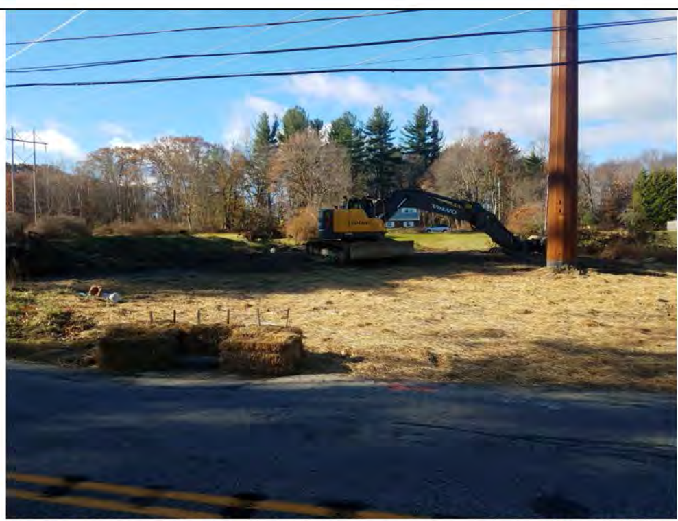
Photo 13: 11/17/2017, Litchfield: Map 29, Str81 and catch basin on Campville Road, <u>CORRECTIVE ACTION</u>- Installed E&S controls to protect catch basin, sediments were removed from the catch basin, straw placed over work pad to aid in controlling surface water runoff, restoration of the work pad has begun.