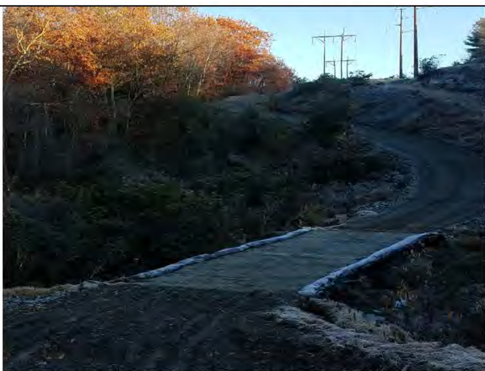
Photo 3:11/09/17, Watertown: Map 14, timber mat crossing conditions at W-C20, buildup of sediments on timber mats due to upland access road area conditions.