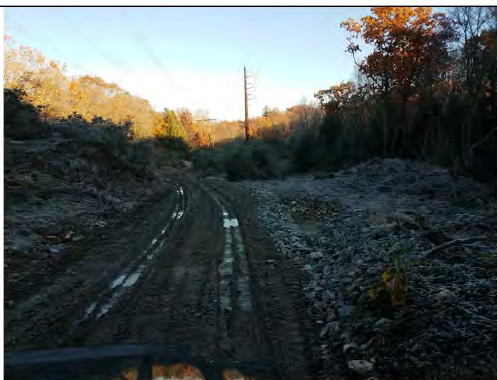
Photo 1:11/09/17, Watertown: Map 14, access road conditions between Str38 and Str39, tire rutting, poor drainage and ponding visible, flattened water bar and poor access road grading at the sediment trap.