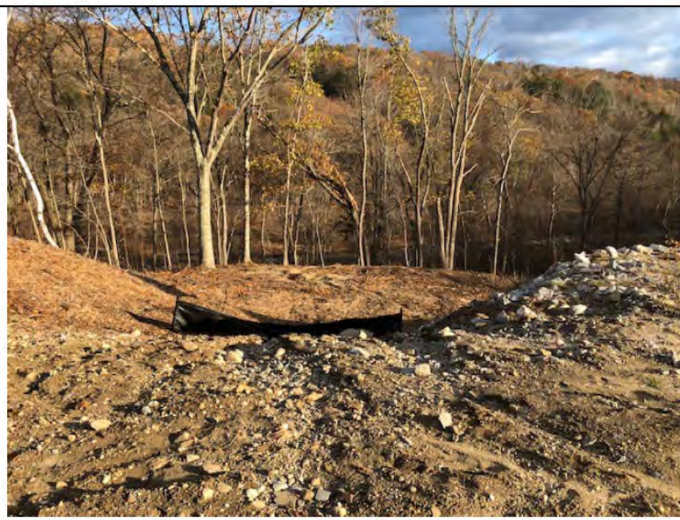
Photo 12: 11/17/2017, Watertown: Map 01, down gradient of Str1A, rill erosion and sedimentation down gradient to the east toward the Connecticut Wetland Only designated area, <u>CORRECTIVE ACTION</u>-E&S (silt fence) installed.