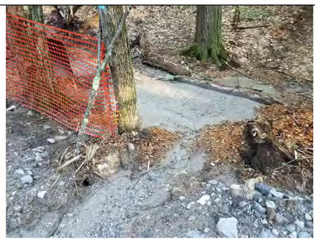
Photo 19: 09/08/2017, Watertown: Map 15, access road between Str44 and Str45 at the CT State marked Hiking trail, rills and sediment flow off access road into the access point of hiking trail.