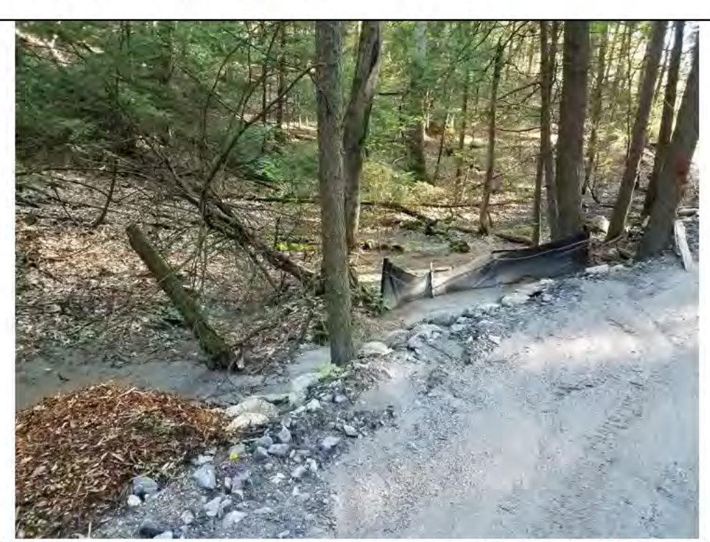
Photo 20: 09/08/2017, Watertown: Map 15, access road between Str44 and Str45 approximately 100 feet north of the CT State marked Hiking trail, rills and sediment flow off access road.