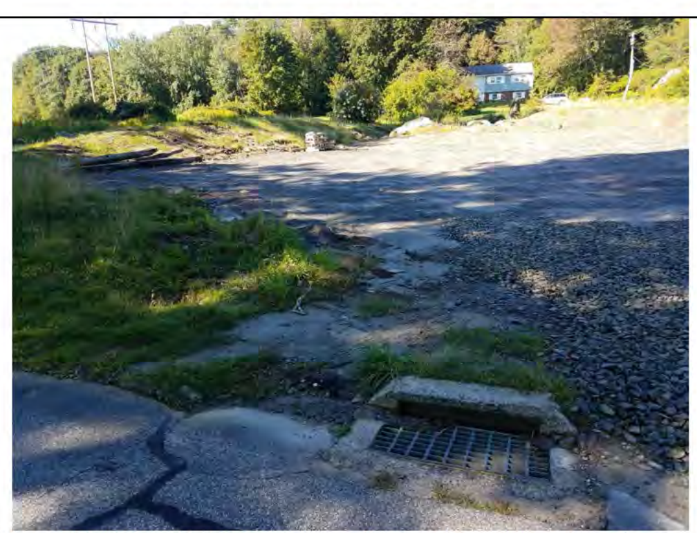
Photo 21: 09/08/2017, Litchfield, Map 29: At Str81, sediment flow into the catch basin located on Campville Road, no silt sack or catch basin protection