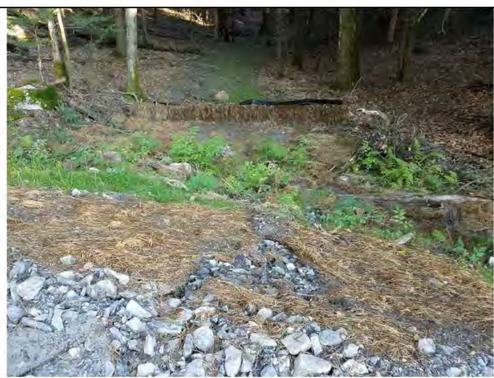
Photo 15: 09/08/2017, Watertown: Map 15, access road between Str42 and Str43, rills and sediment flow off access road, sedimentation visible down to hay bales (previously restored area).