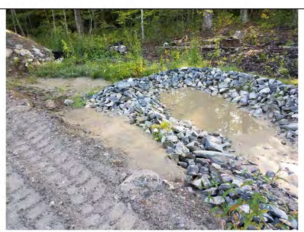
Photo 6: 09/08/2017, Watertown: Map 13, south of Str36, excess sediments in temporary basin, sediment runoff from uncontrolled storm water flow off the access road.