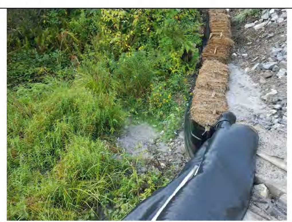
Photo 12: 09/08/2017, Watertown: Map 14, at southeast corner of timber mat crossing over wetland W-C20, excess buildup of sediments and breakthrough into W-C20.