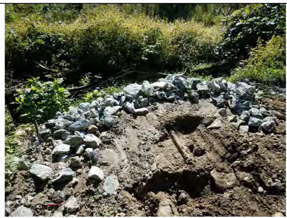
Photo 8: 09/08/2017, Watertown: Map 10, between Str26 and Str27, excess buildup of sediment in temporary sediment pond.