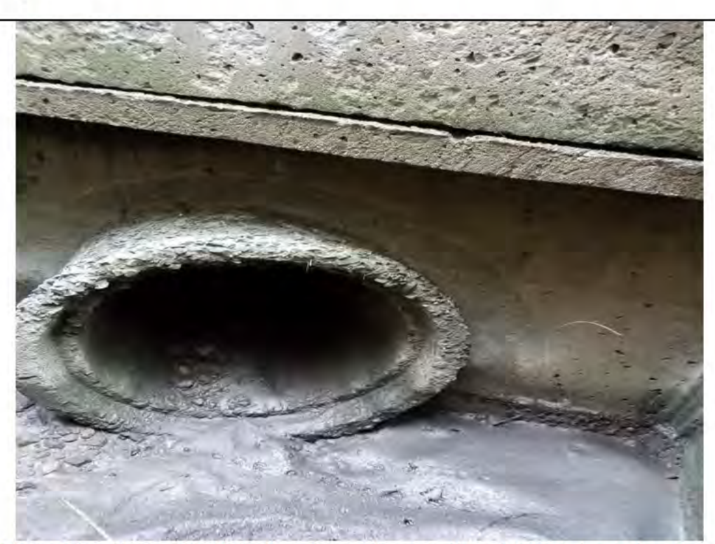
Photo 22: 09/08/2017, Litchfield, Map 29: At Str81, sediment flow into the catch basin located on Campville Road, no silt sack or catch basin protection