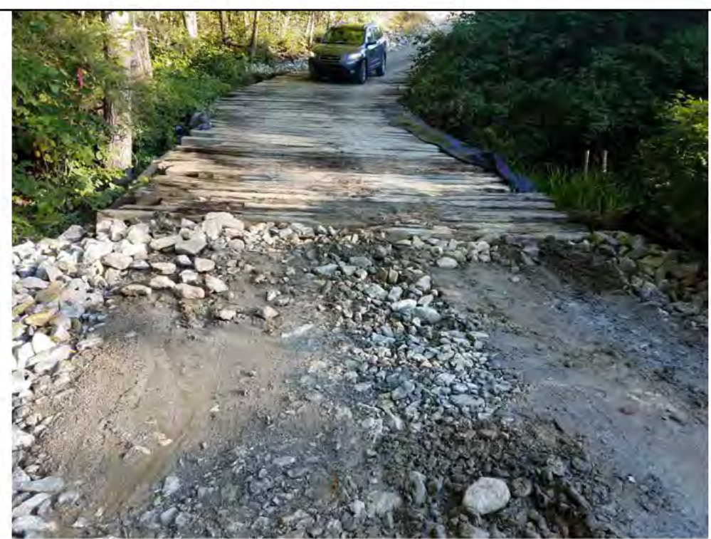
Photo 3: 09/08/2017, Watertown: Map 12, timber mat crossing at W-C15/S-C5, timbers pushed to the outside of the bend in the access road.