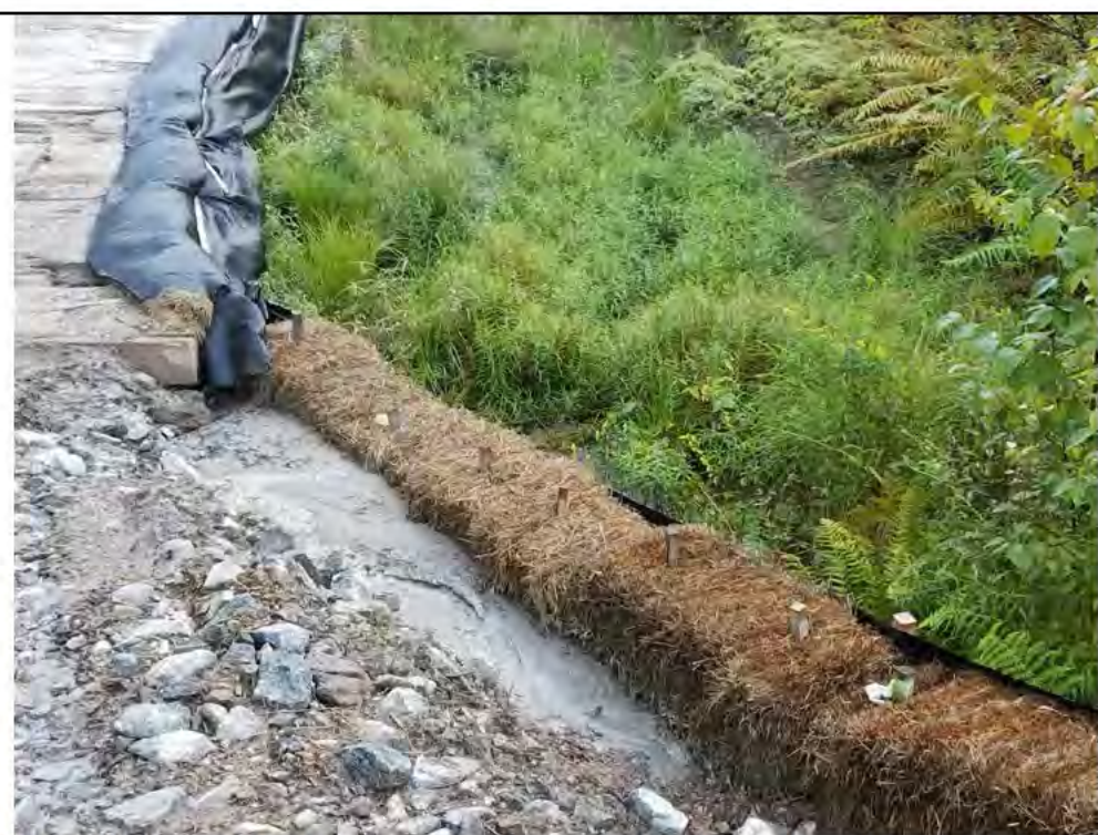
Photo 11: 09/08/2017, Watertown: Map 14, at southeast corner of timber mat crossing over wetland W-C20, excess buildup of sediments.