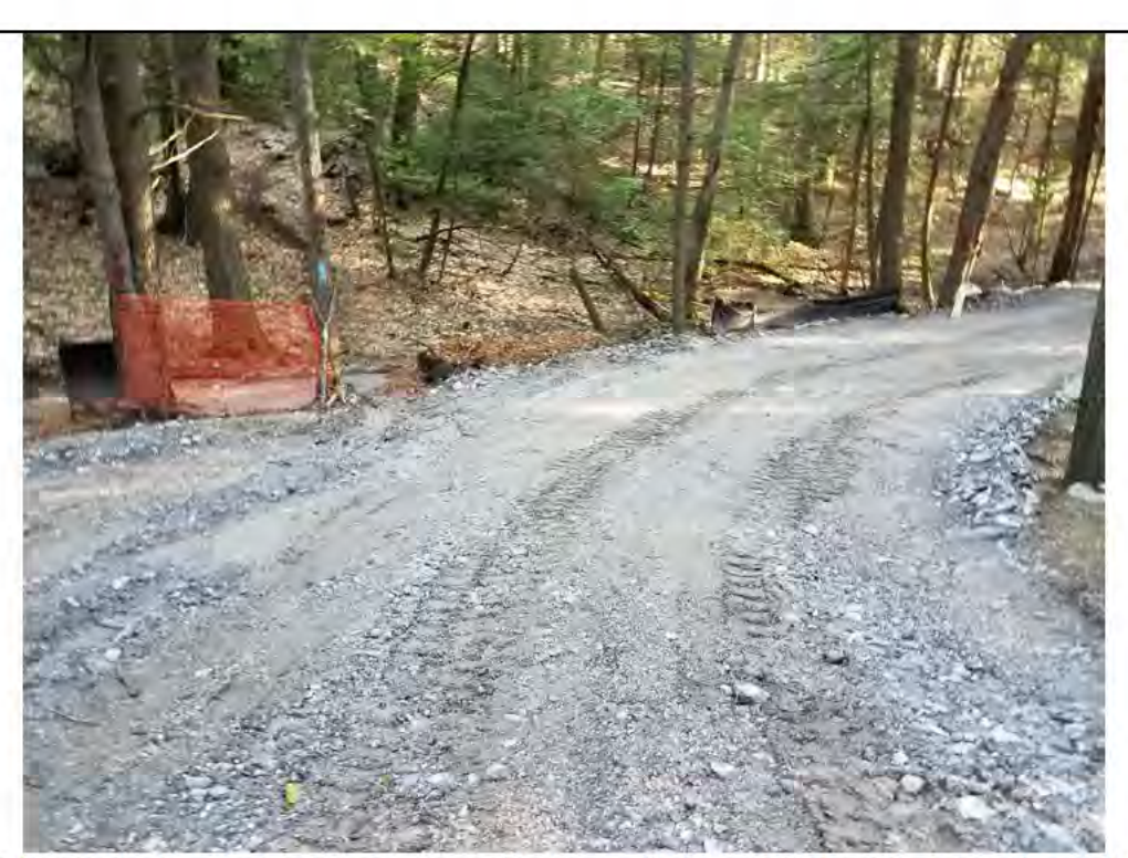
Photo 18: 09/08/2017, Watertown: Map 15, access road between Str44 and Str45 at the CT State marked Hiking trail, rills and sediment flow off access road into the access point of hiking trail.