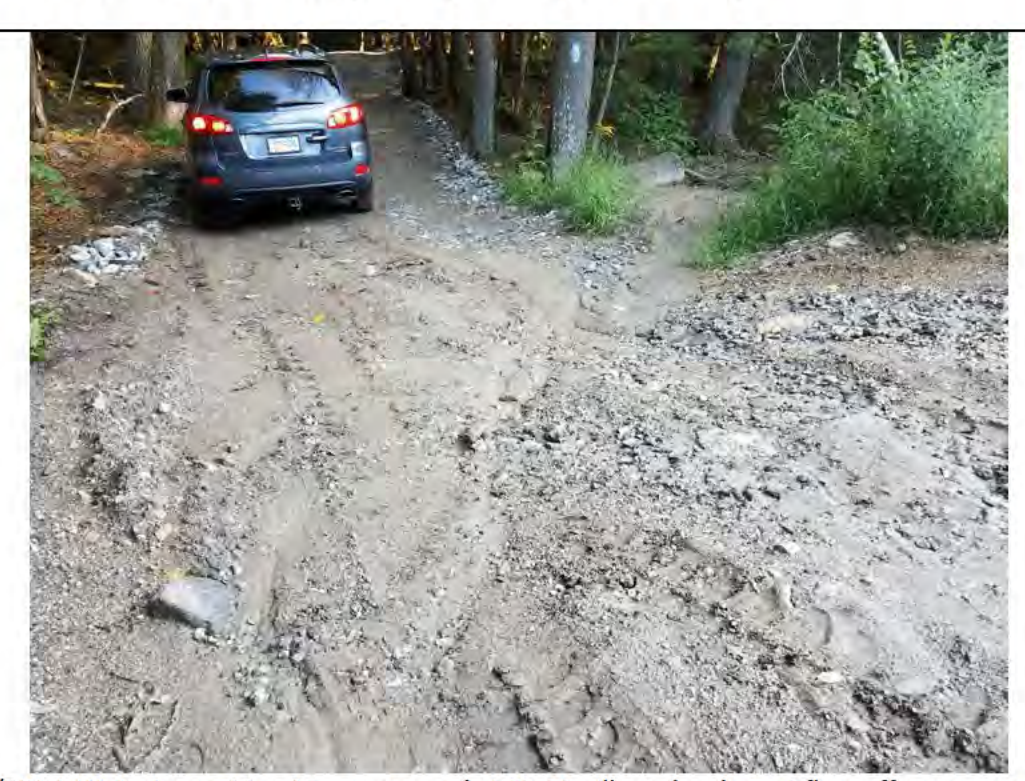
Photo 16: 09/08/2017, Watertown: Map 15, access road at Str44, rills and sediment flow off access road into wooded area.