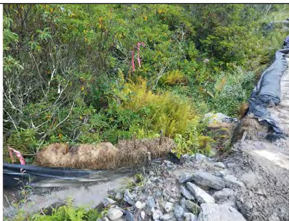
Photo 13: 09/08/2017, Watertown: Map 14, at southwest corner of timber mat crossing over wetland W-C20, excess buildup of sediments and sedimentation into W-C20.