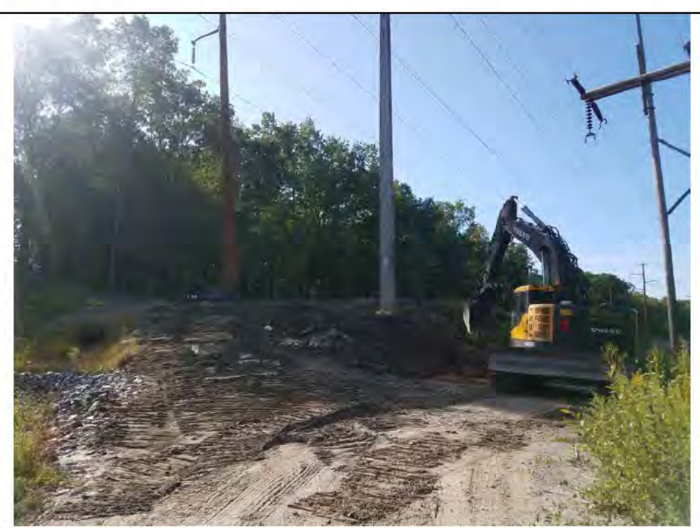
Photo 2: 09/01/2017, Thomaston/Litchfield: Maps 25-26, Eversource Maintenance crew at Str73 grading pad with excavator bucket.