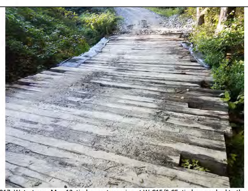
Photo 4: 09/08/2017, Watertown: Map 12, timber mat crossing at W-C15/S-C5, timbers pushed to the outside of the bend in the access road.