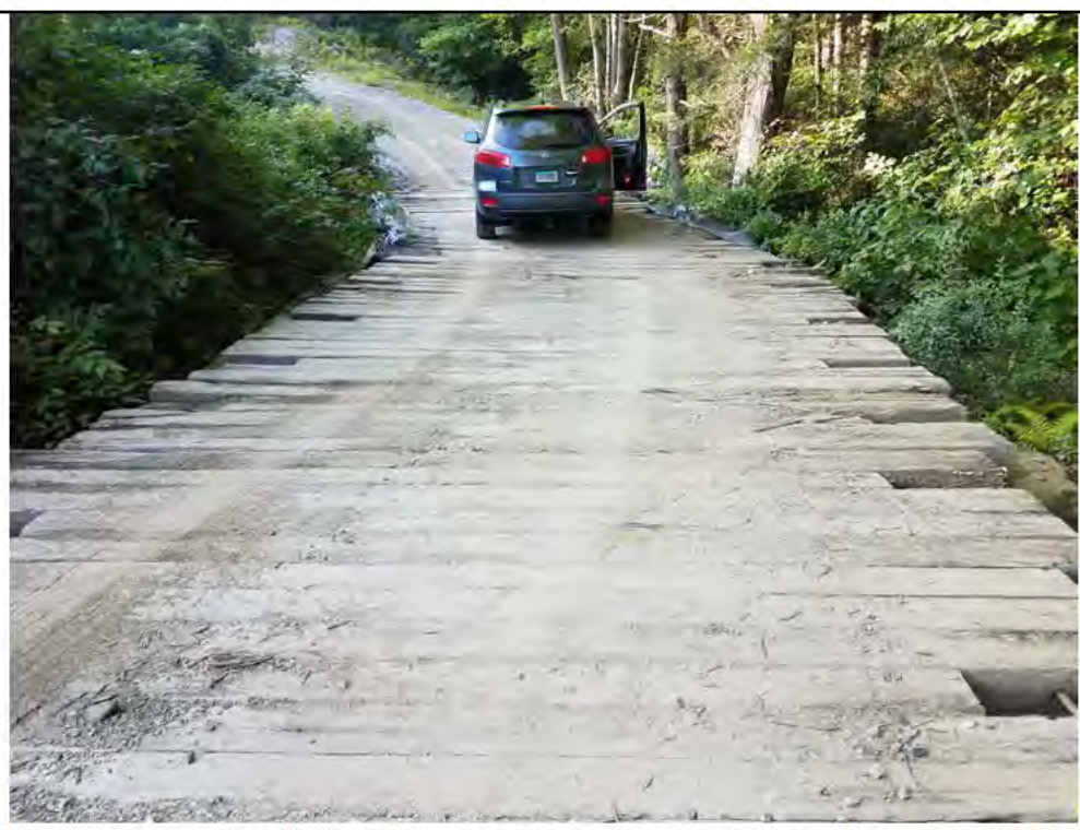
Photo 1: 09/01/2017, Watertown: Map 12, timber mat crossing at W-C15/S-C5, timbers pushed to the outside of the bend (seen at below the parked vehicle).