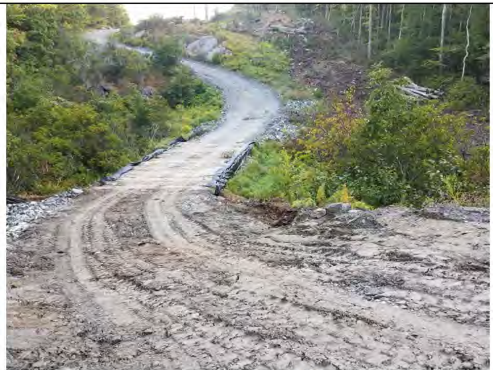
Photo 10: 09/08/2017, Watertown: Map 14, access road north of Str39 to wetland W-C20, water bar flattened out.