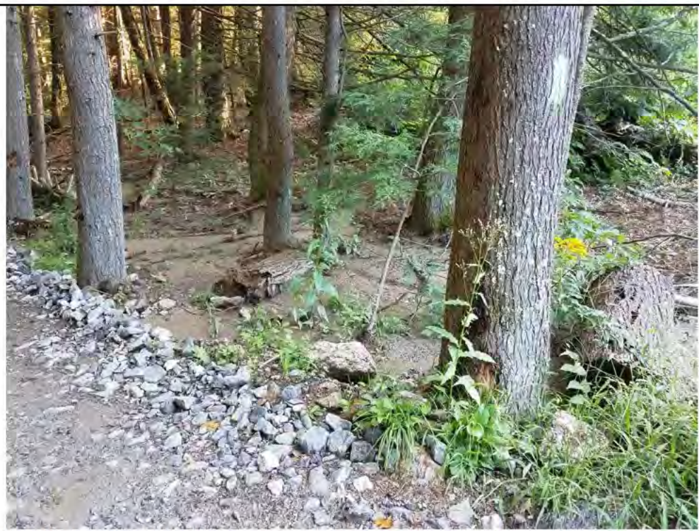
Photo 17: 09/08/2017, Watertown: Map 15, access road at Str44, rills and sediment flow off access road into wooded area.