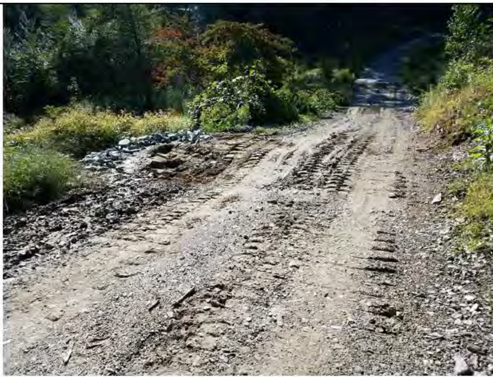
Photo 7: 09/08/2017, Watertown: Map 10, between Str26 and Str27, water bar flattened out, sediment buildup in temporary sediment pond.