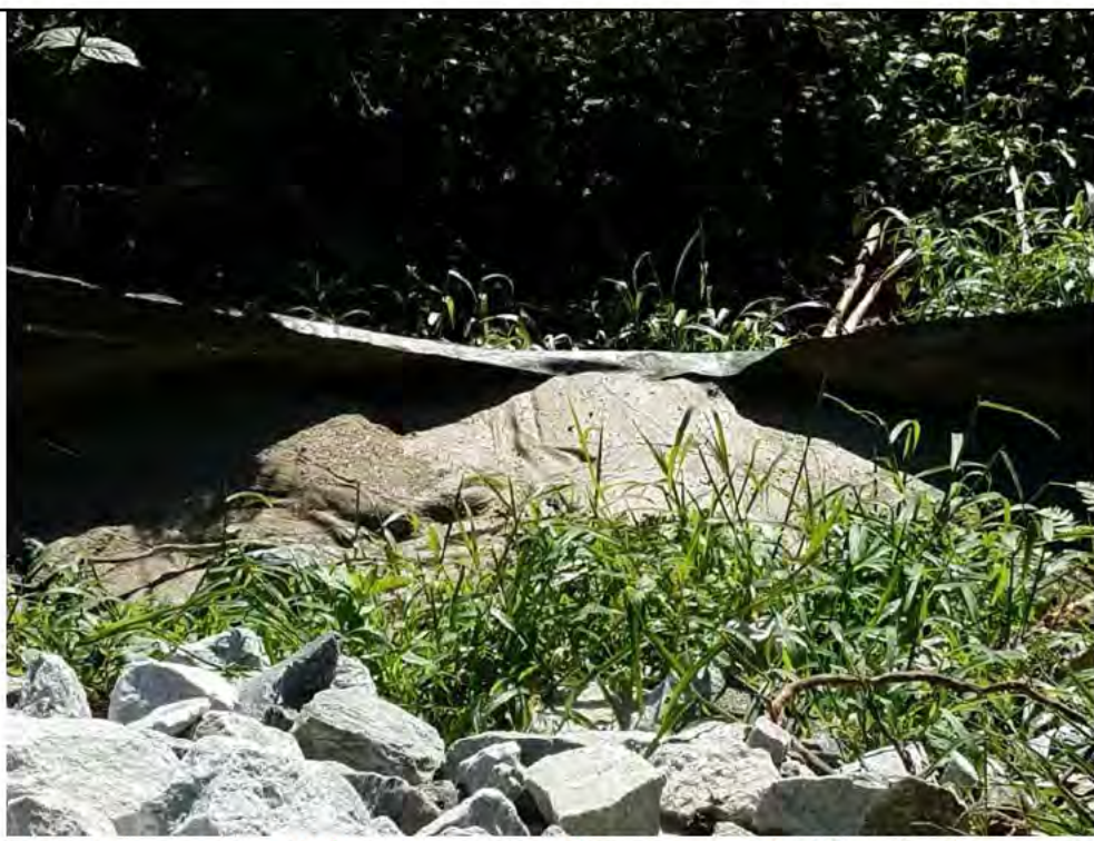
Photo 9: 09/08/2017, Watertown: Map 10, between Str26 and Str27, excess buildup of sediment in temporary sediment pond, excess buildup on silt fence.