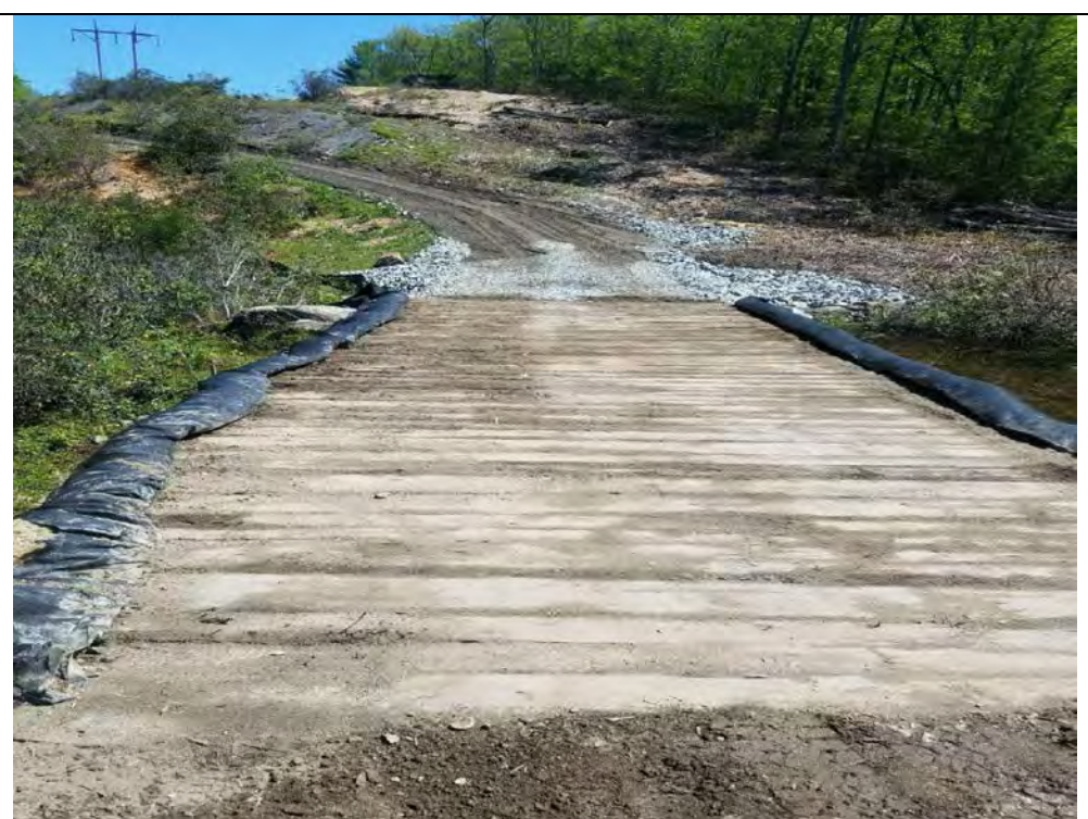
Photo 8: 05/19/2017, Watertown: Map 14, at VP-C20-1 crossing, timber mats and silt fence cleared of excess sediments, completed on 05/19/2017 by Northern.

Photo 7: 05/19/2017, Watertown: Map 14, timber mat crossing at VP-C20-1 in need of cleaning and maintenance of perimeter silt fence.