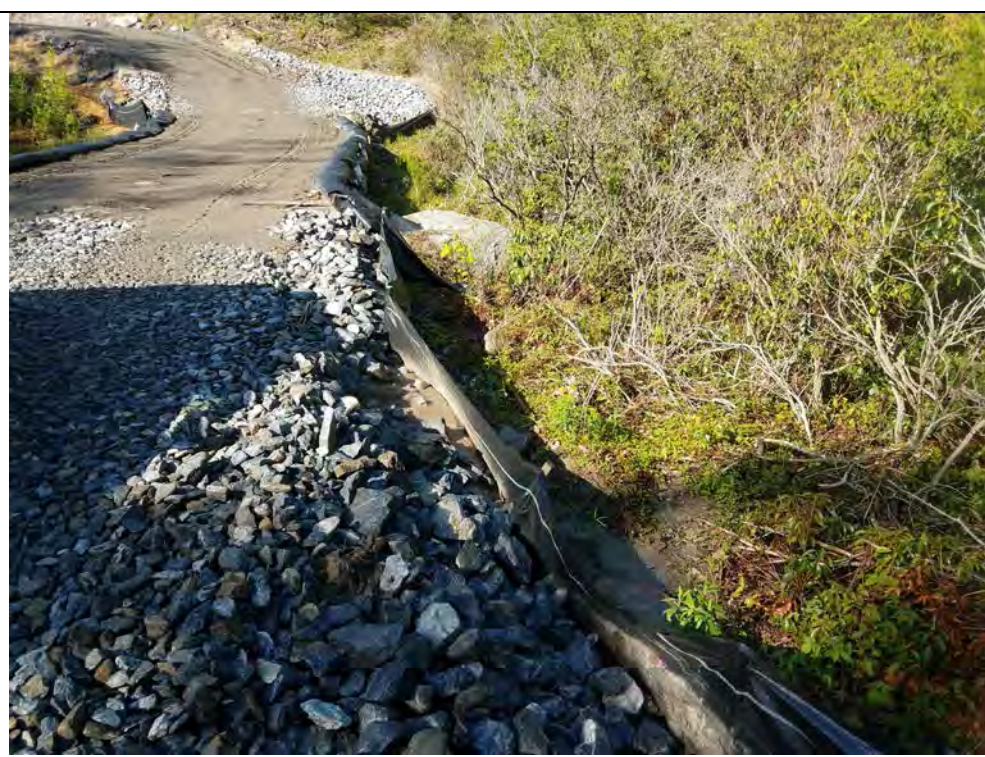
Photo 7: 05/19/2017, Watertown: Map 14, timber mat crossing at VP-C20-1 in need of cleaning and maintenance of perimeter silt fence.