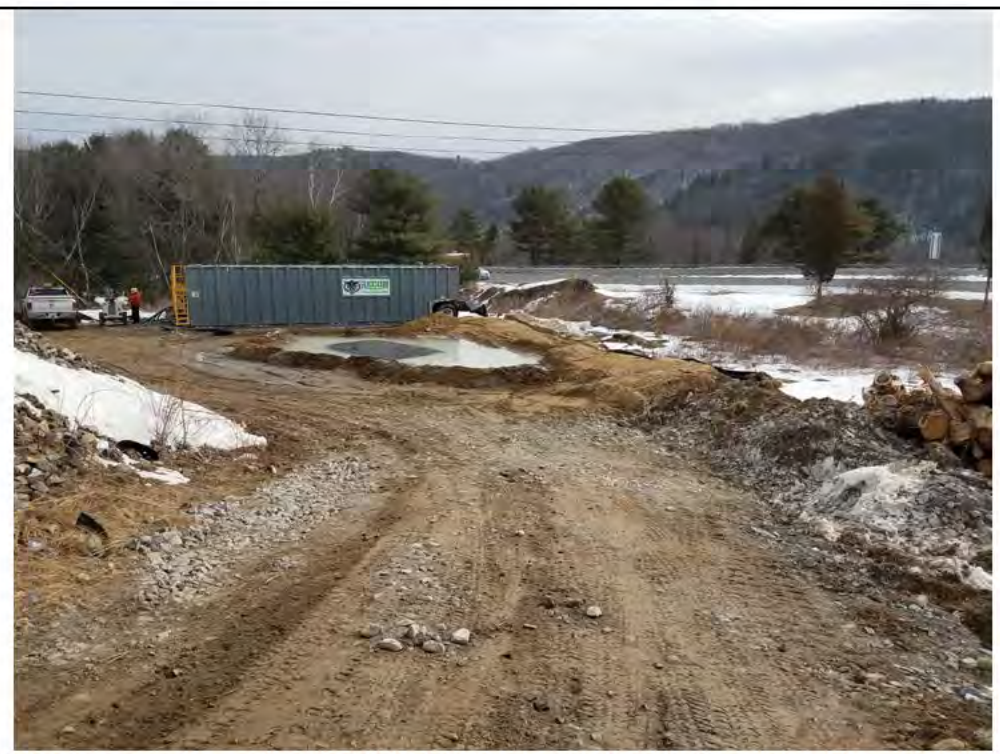
Photo 7: 3/24/2017, Watertown: Map 01, Str3080 and Str2, current dewatering set up (changes pending).