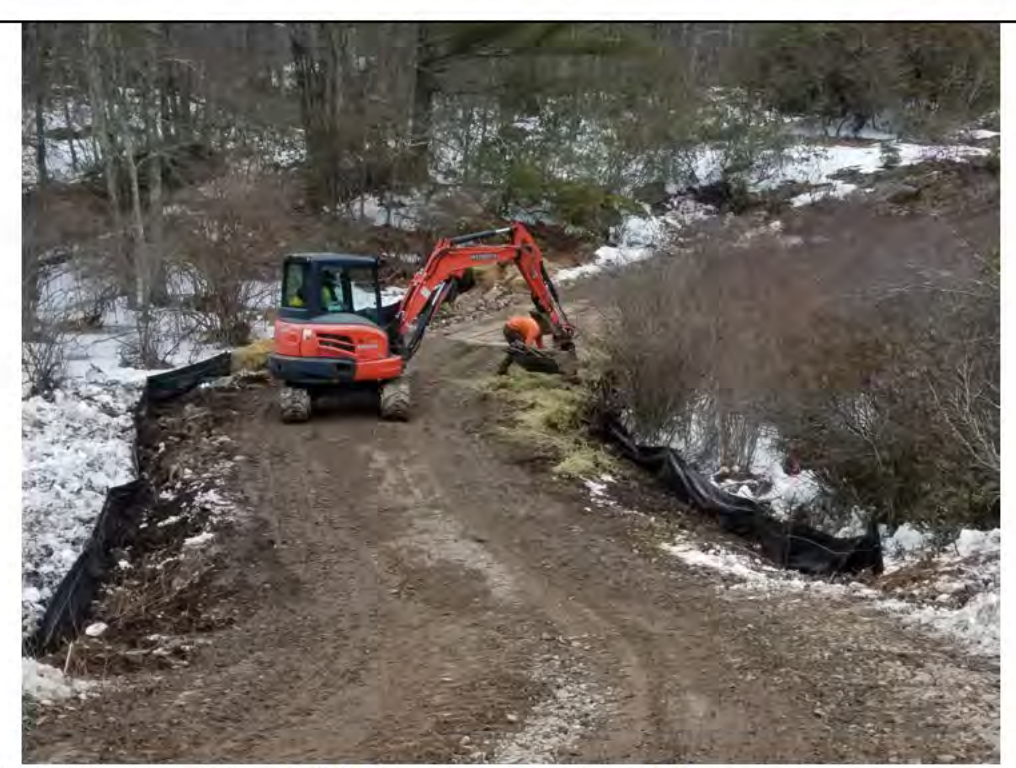
Photo 10: 3/24/2017, Watertown: Maps 09A-13, installing E&S at VP-C15-1.