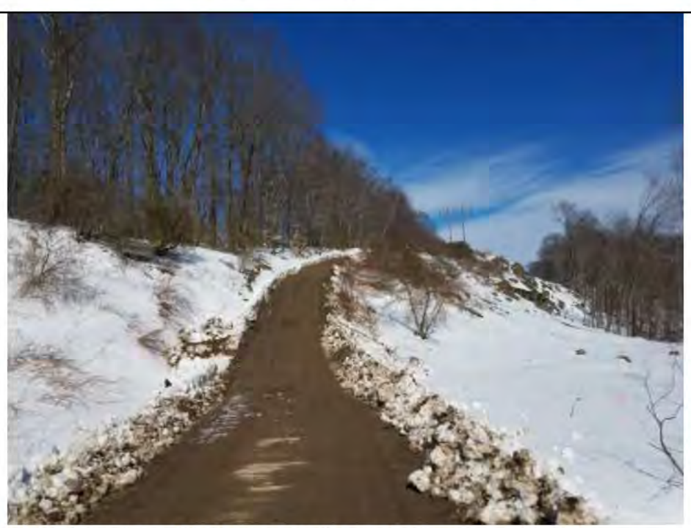
Photo 1: 3/17/2017, Watertown: Maps 09-12, access road snow clearing.