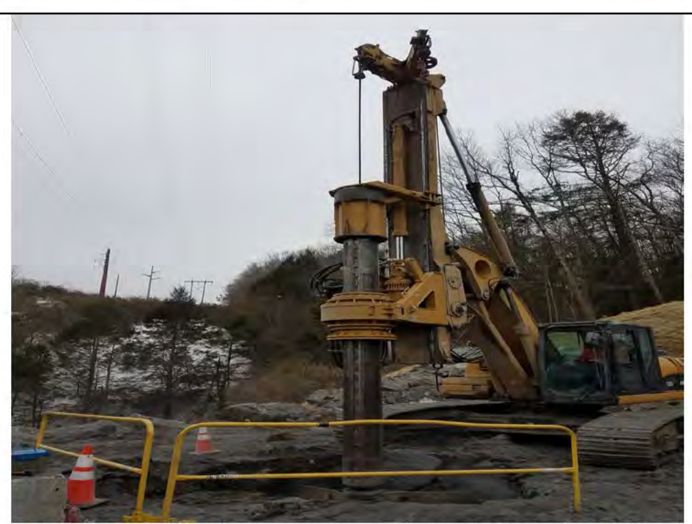
Photo 12: 3/24/2017, Litchfield: Maps 31 & 32, coring base for Vertical Deadend Structure, Str3171.