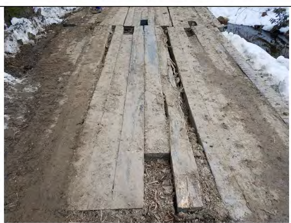
Photo 9: 3/24/2017, Watertown: Maps 09A-13, timber mat crossing, mat separation occuring at S-C4.