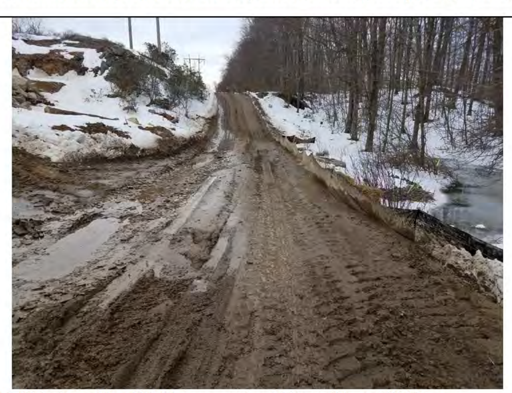
Photo 8: 3/24/2017, Watertown: Maps 09A-13, access road and E&S conditions at W-C16.