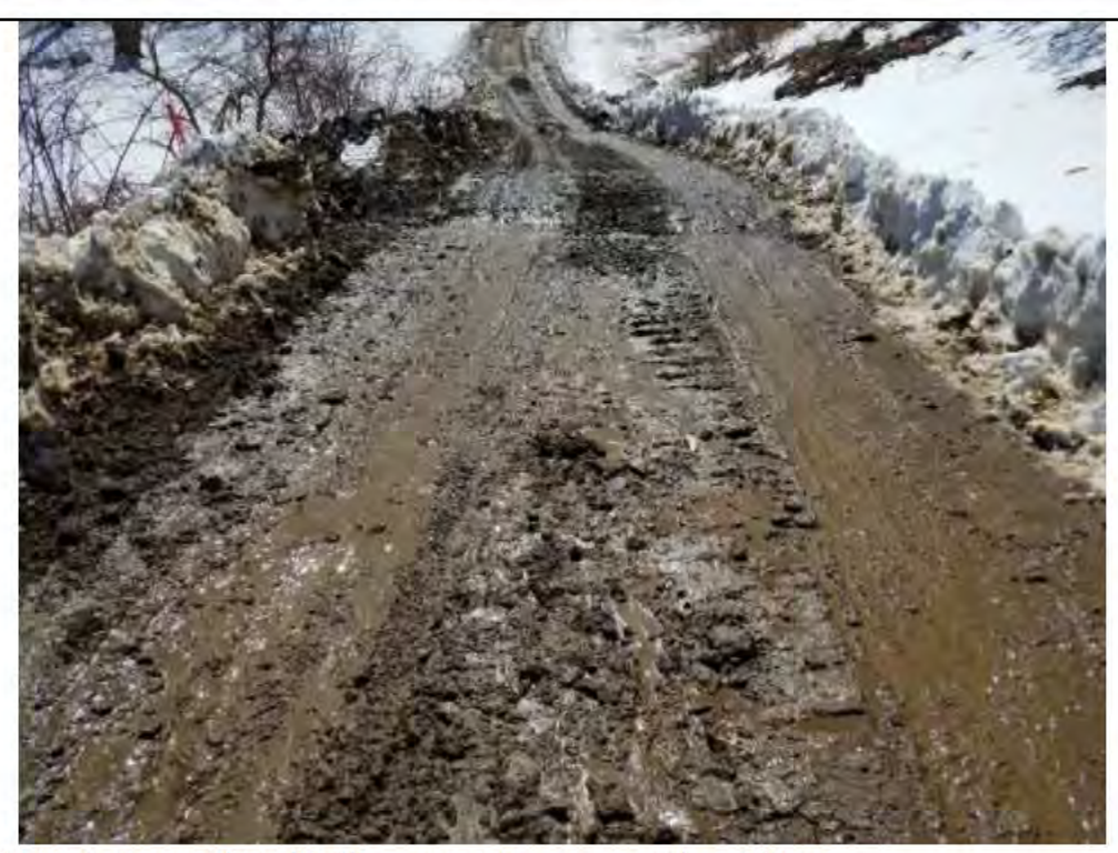
Photo 2: 3/17/2017, Watertown: Maps 09-12, snow melt, access road conditions.