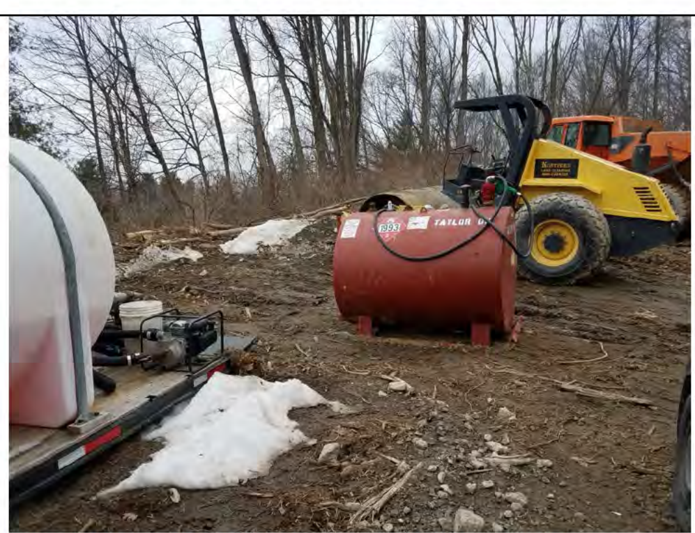
Photo 13: 3/24/2017, Litchfield: Maps 31 & 32, PAR Electric's diesel fuel storage tank (no secondary containment).