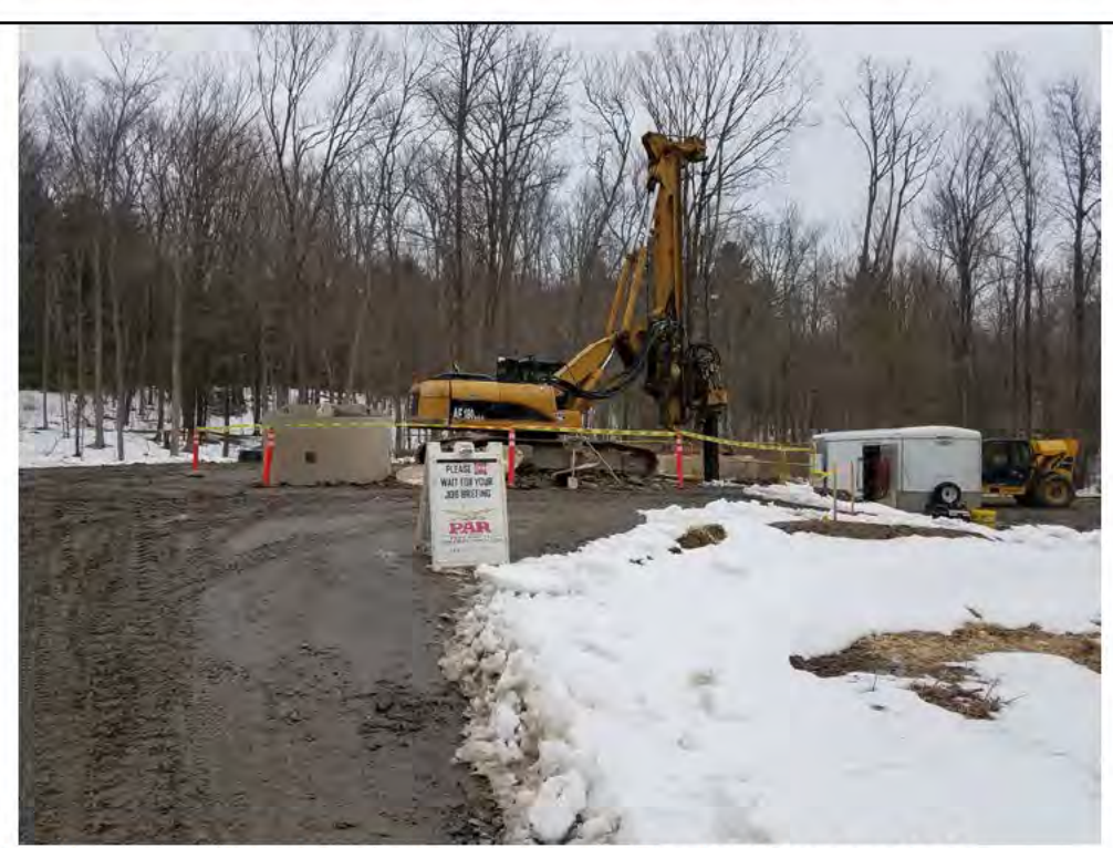
Photo 14: 3/24/2017, Harwinton: Map 35, coring base for Vertical Deadend Structure, Str96.