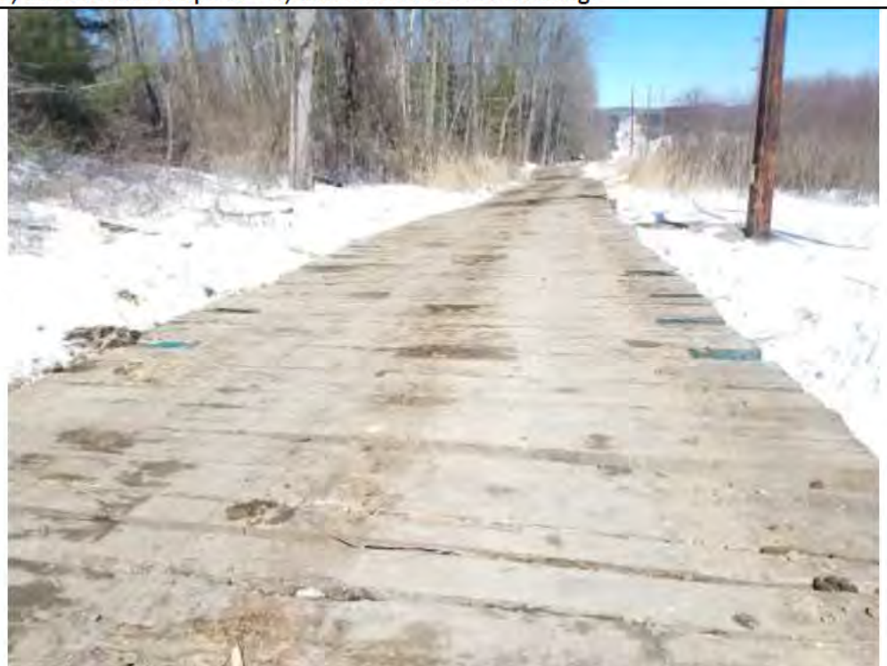
Photo 6: 3/17/2017, Litchfield: Maps 29 & 30, timber mat road through W-F7 to Str84.