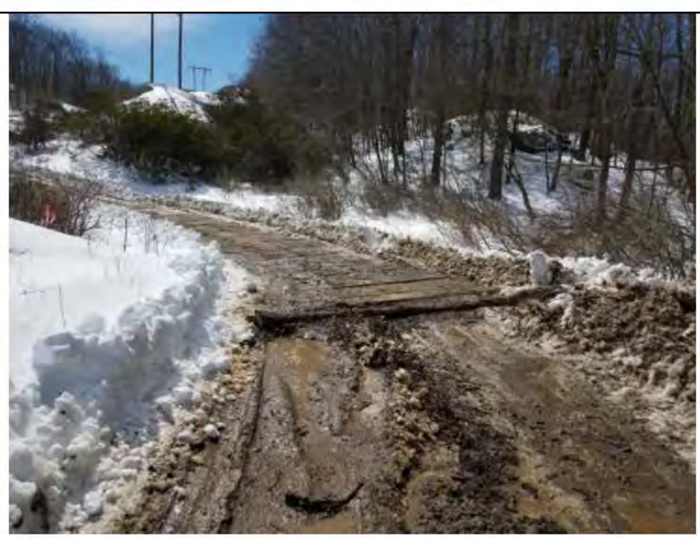
Photo 5: 3/17/2017, Watertown: Maps 09-13, timber mat at S-C4 crossing.