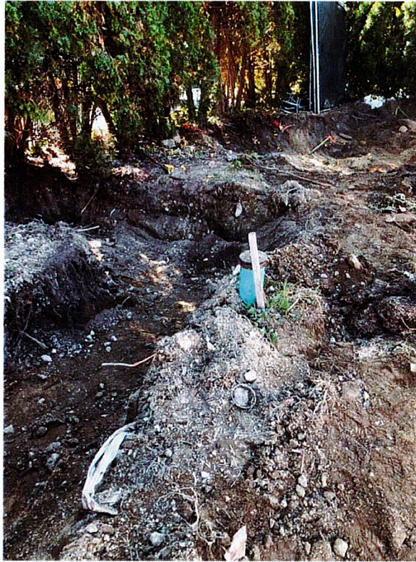
Views of excavations for two drilled shaft foundations adjacent to which arbor vitae are propose to be removed. Above view to southwest showing roots affected by initial excavations: below view looking south from substation property toward adjacent building at 255 Field Point Road and arbor vitae proposed to be removed.