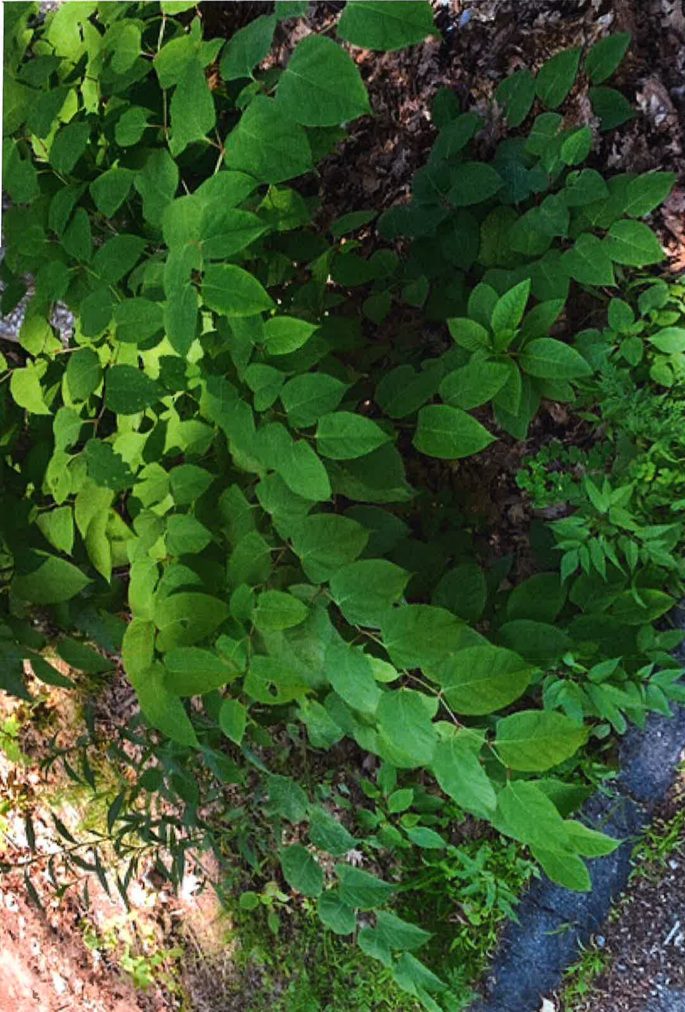
Area Around Access Drive Catch Basin