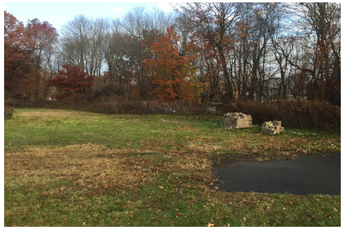
Photo 2: View of proposed tower site (cleared area) looking north.