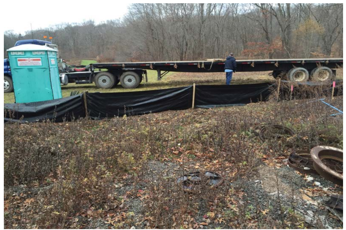
Photo 6: View of restaked silt fence (replaced broken stakes) looking west.