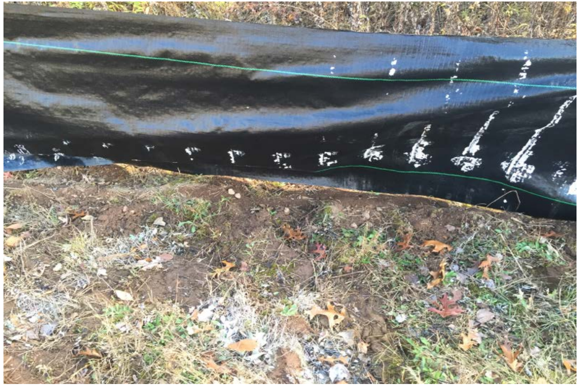
Photo 3: Corrective Area #1 - view of silt fence that needs to be trenched.

PHOTO DOCUMENTATION Homeland Tower Cheshire Facility CT-005 1325 Cheshire Street, Cheshire, Connecticut Photos taken on November 15, 2015