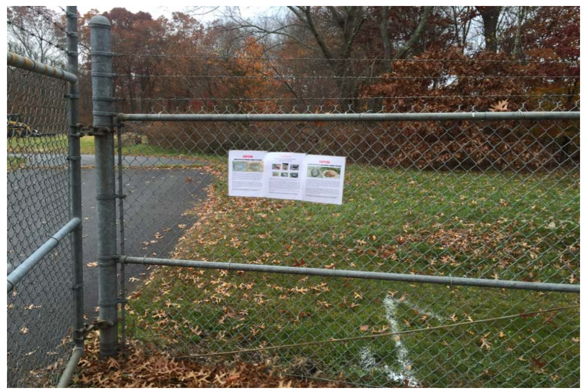
Photo 3: View of turtle protection caution signs at entrance to proposed tower site looking north.

PHOTO DOCUMENTATION Homeland Towers Compliance Monitoring Inspection 1325 Cheshire Street, Cheshire, CT Photos taken on November 6, 2015