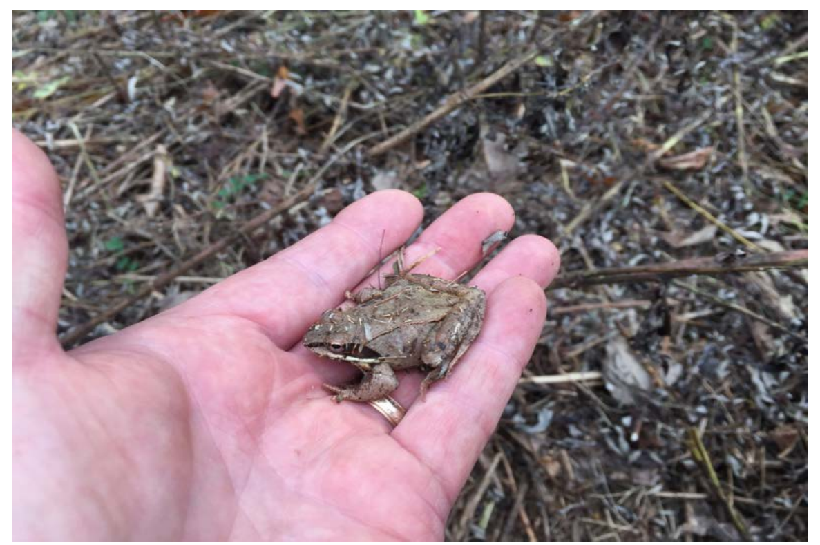
Photo 4: Wood frog removed from construction site prior to erosion control installation.