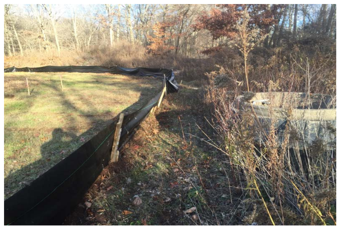
Photo 4: Corrective Area #2 - view of broken stakes looking north.