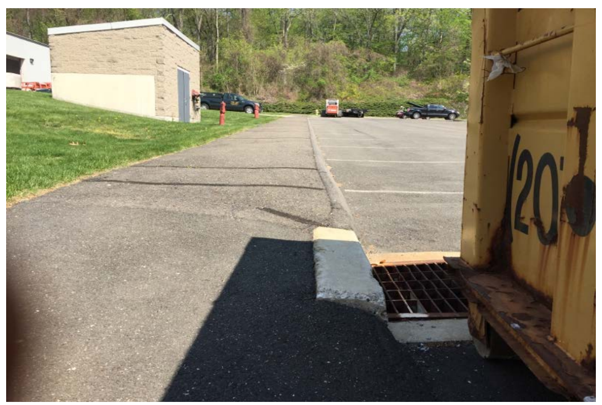
Photo 5: View of catch basin requiring sedimentation protection looking north with access drive in background. Corrective Action #1.