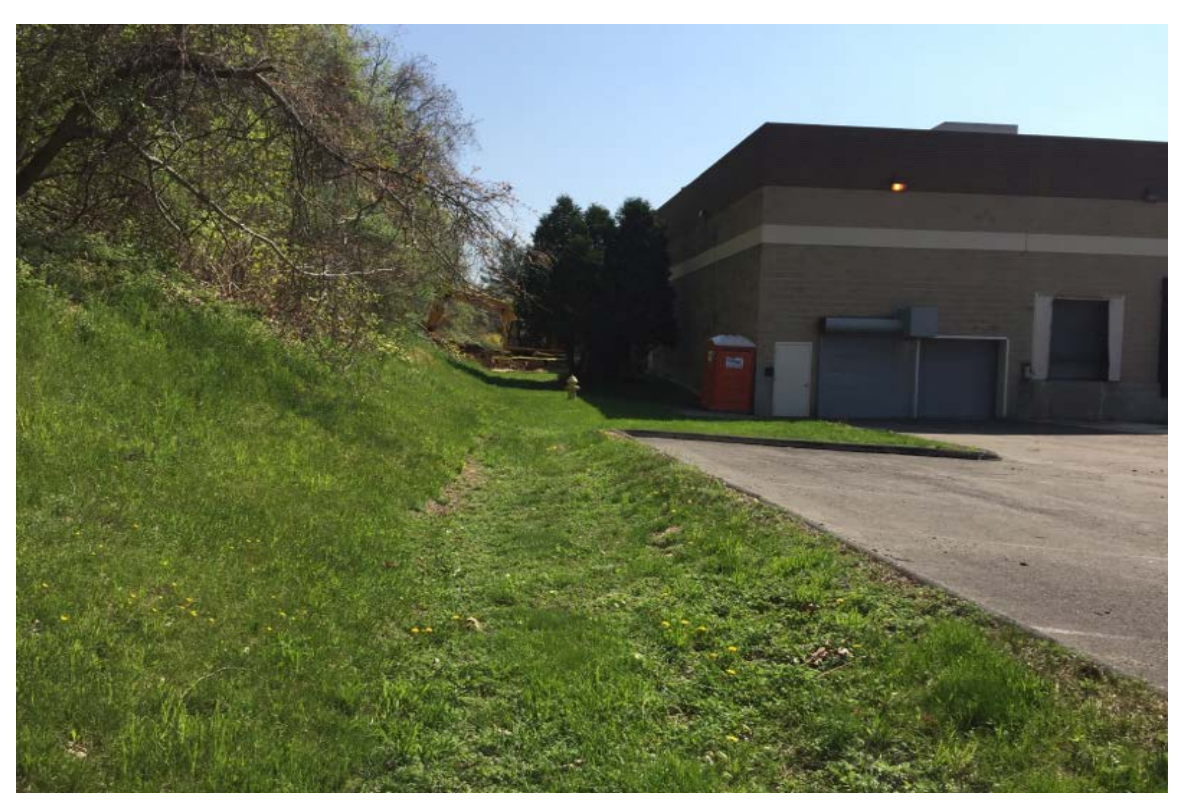
Photo 3: Add two lines of straw wattle from curb line to slope near edge of parking lot. Corrective Action #2.