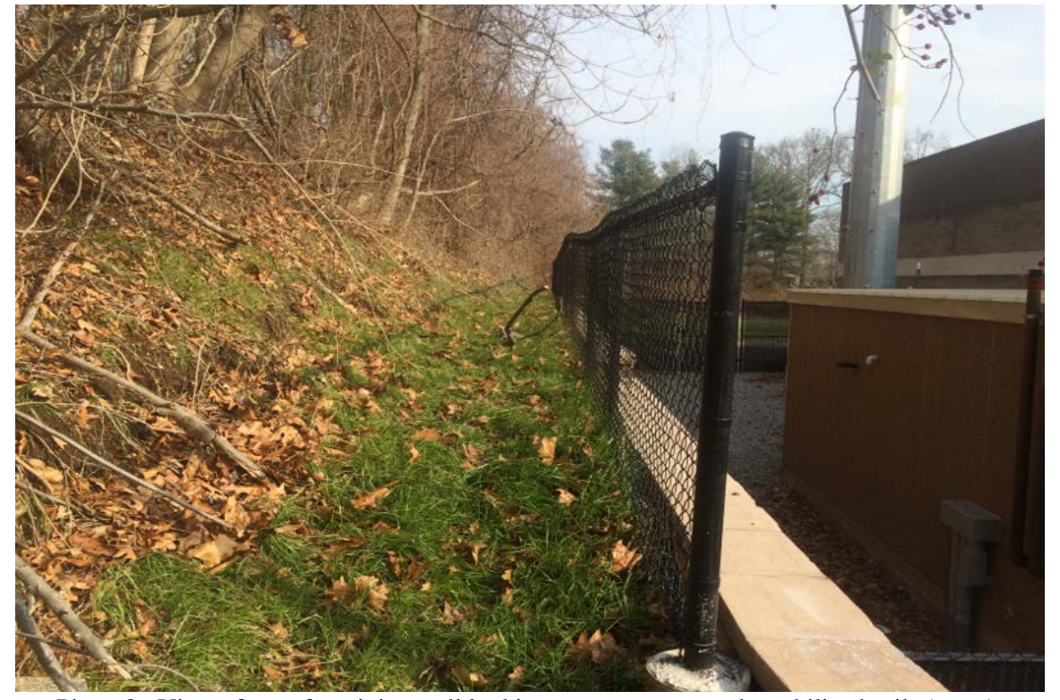
Photo 8: View of top of retaining wall looking east at permanently stabilized soils (grass).