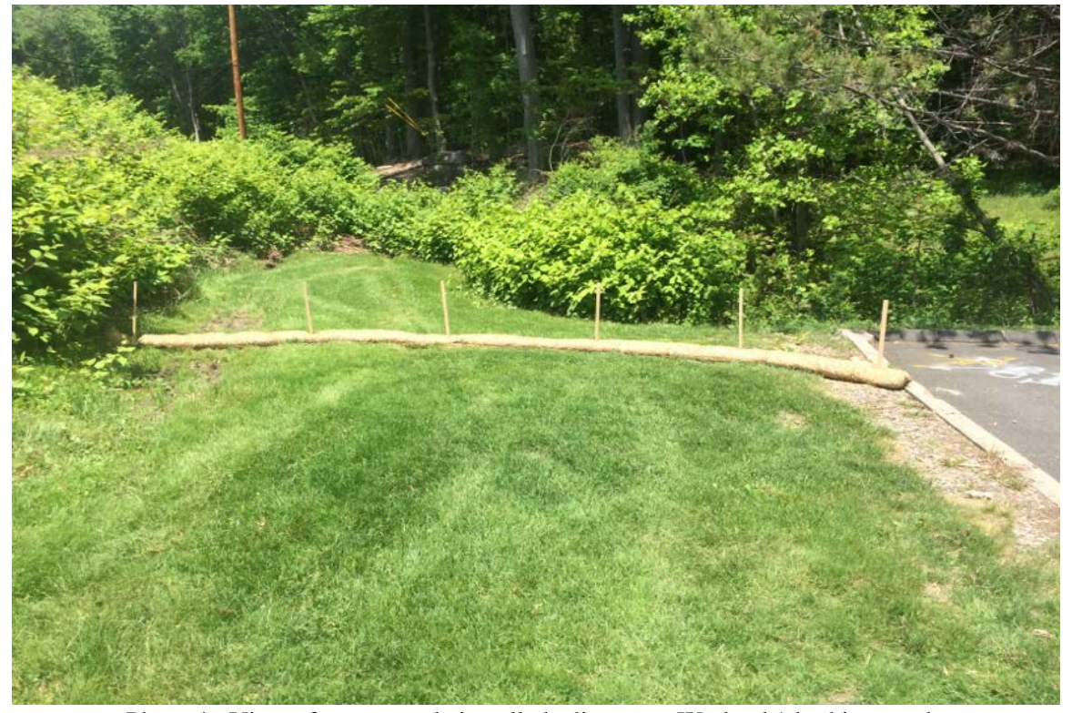
Photo 4: View of straw wattle installed adjacent to Wetland 1 looking north.