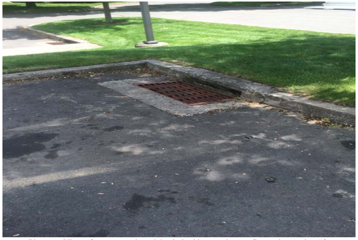
Photo 6: View of unprotected catch basin looking southeast. Corrective Action #3.