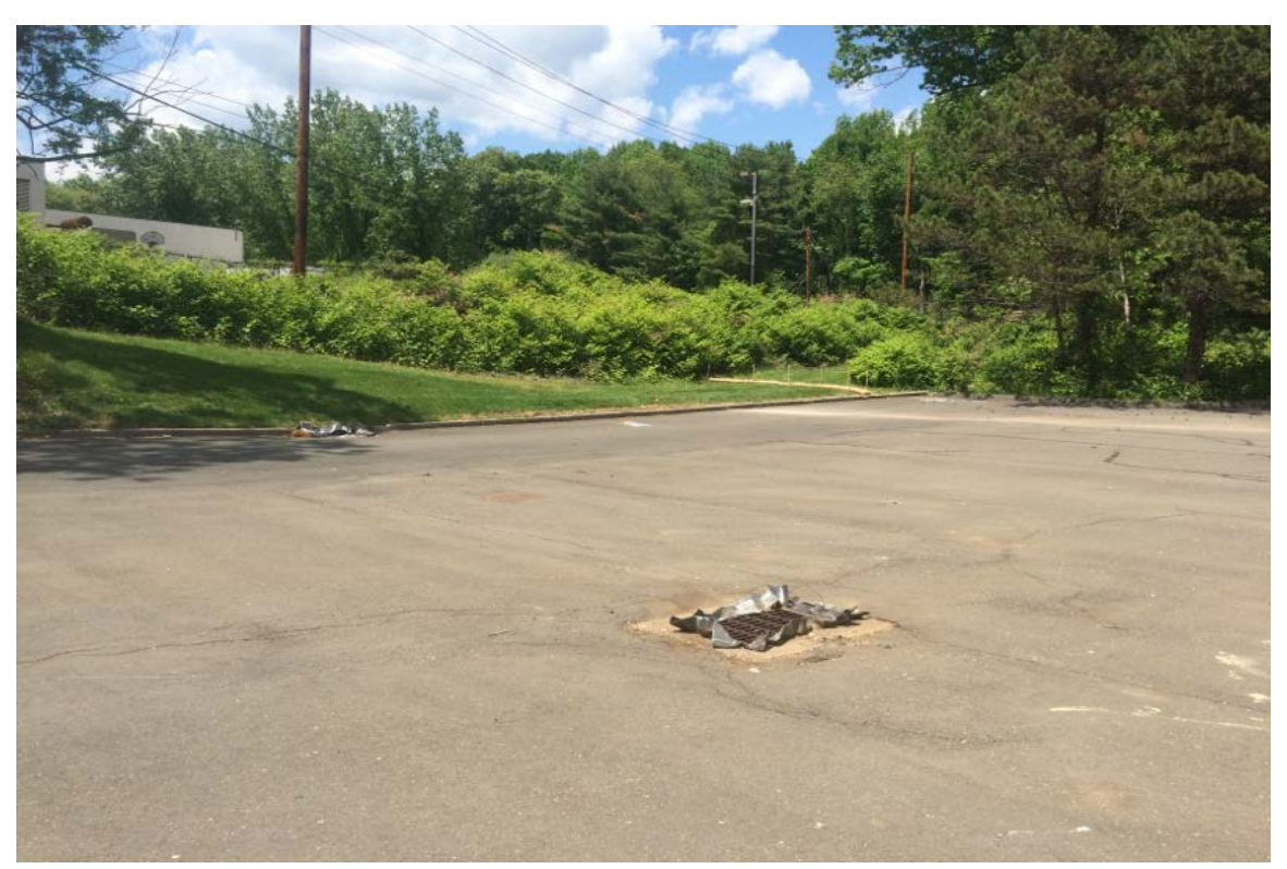
Photo 3: View of catch basin properly protected with filter fabric looking northwest.