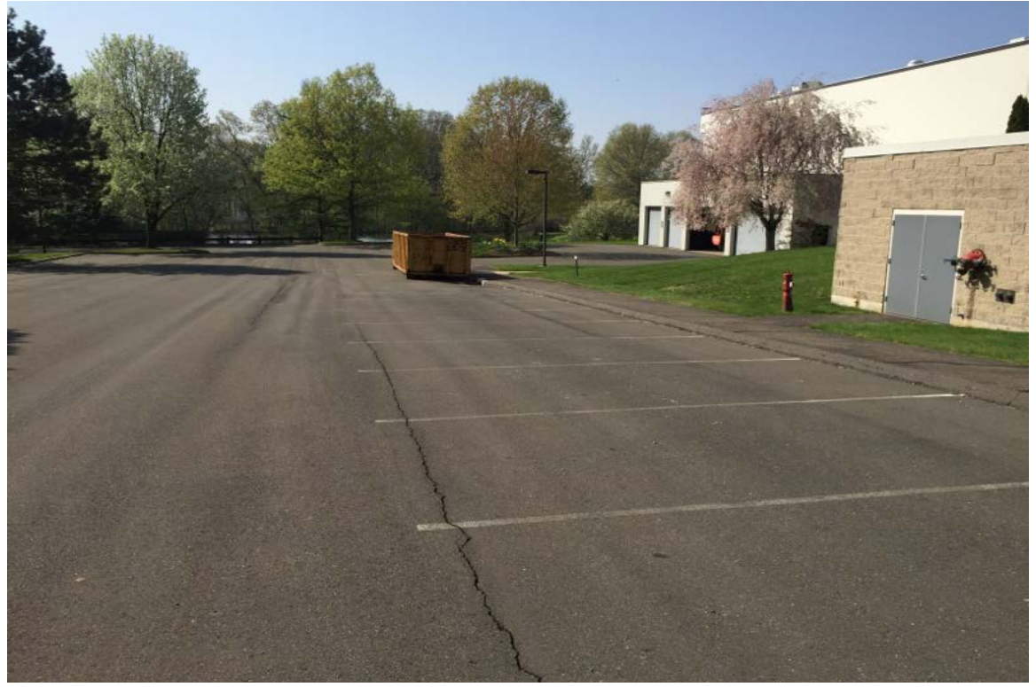
Photo 2: View of potential construction runoff flow path along curb to catch basin in front of dumpster looking south. Corrective Action #1.