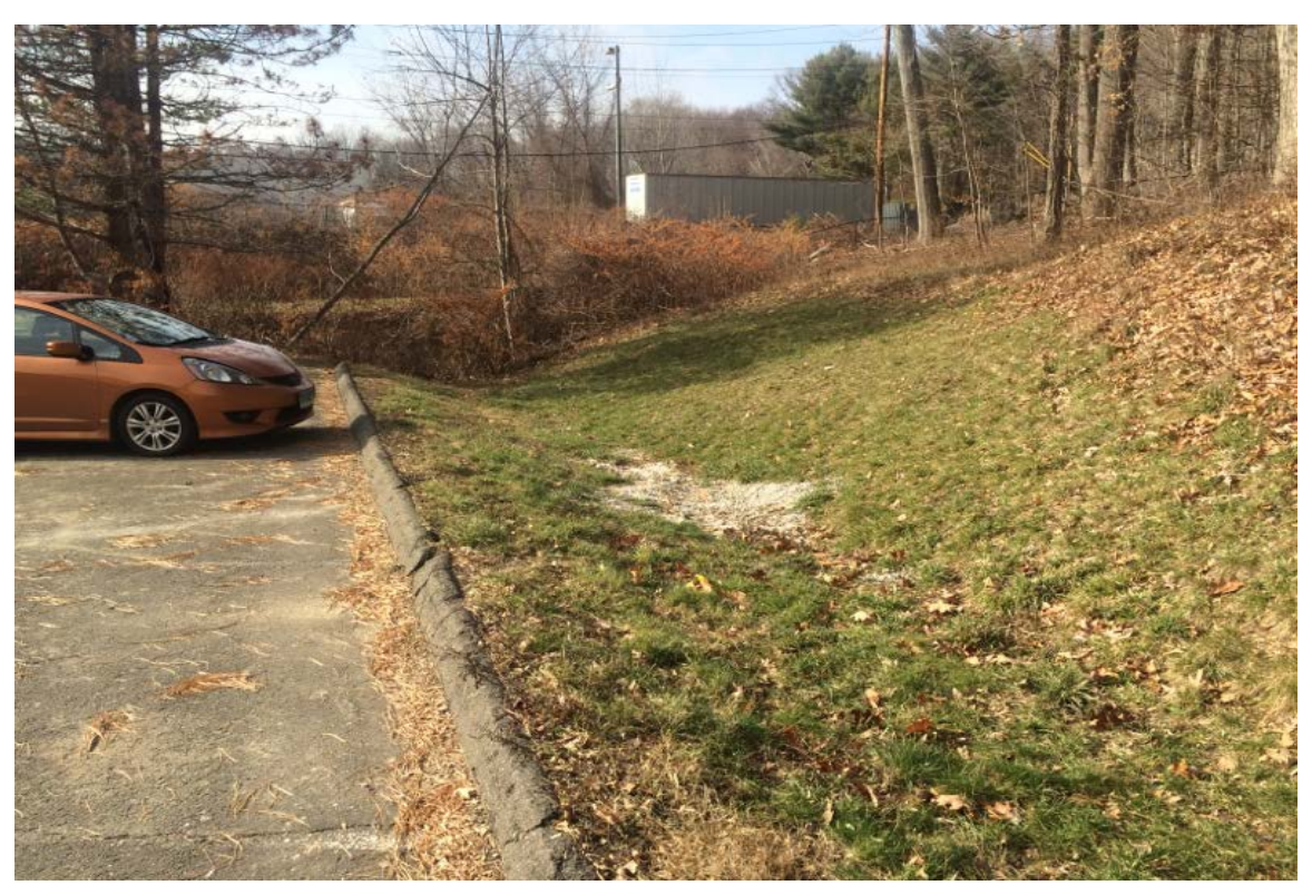
View of drainage swale looking west.