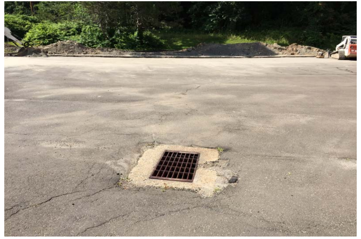
Photo 6: Corrective Area #4 - install filter fabric in catch basin looking north.