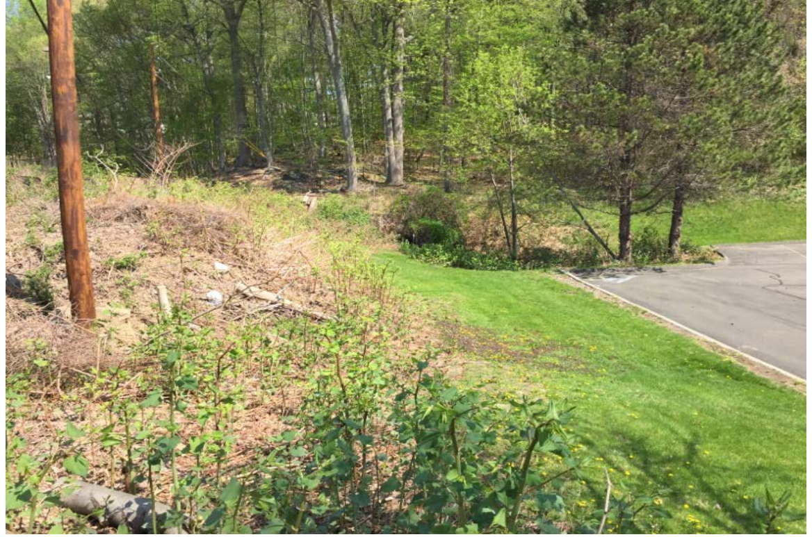
Photo 4: View of proposed trench north of pole 4975 left side photo, need to add line of straw wattle to protect stream. Corrective Action #2.