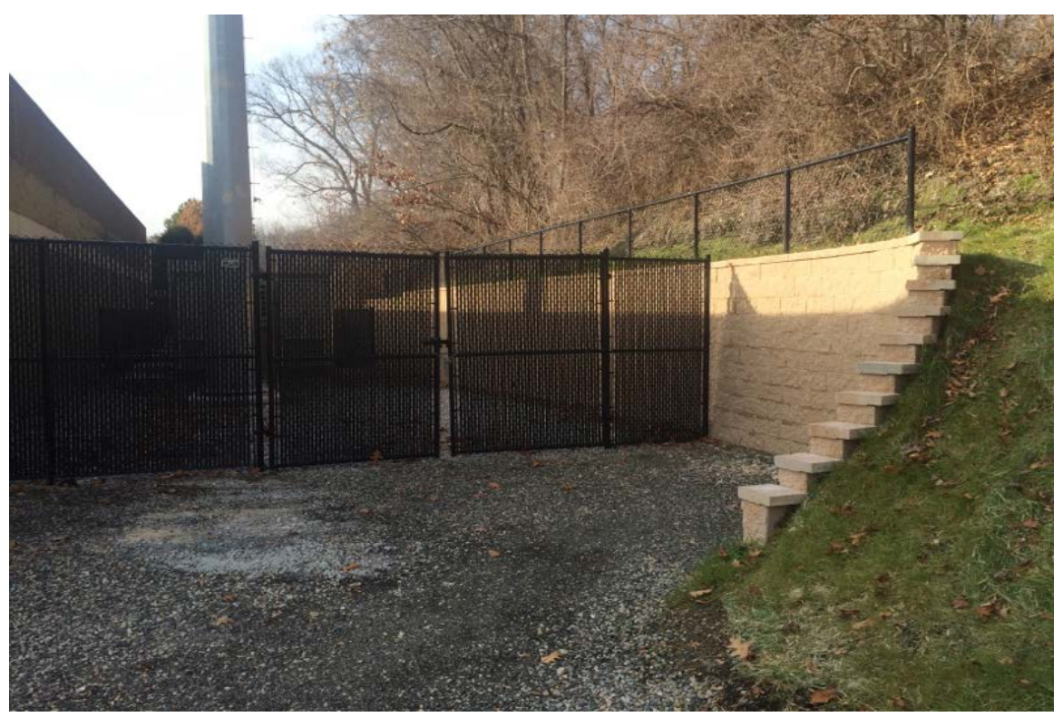
Photo 7: View of compound entrance looking east; retaining wall and permanently stabilized soils (grass).