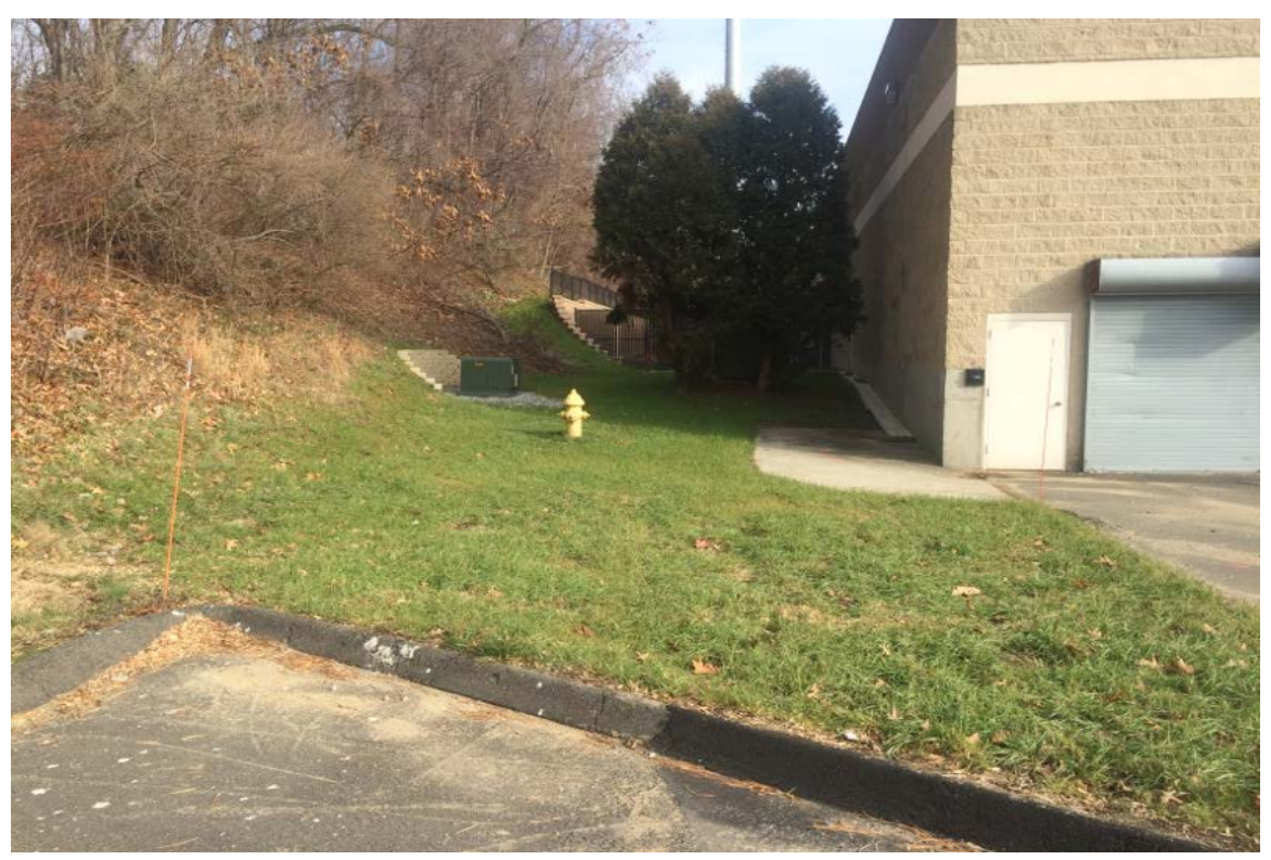
Photo 3: View of permanently stabilized soil (grass) looking east.