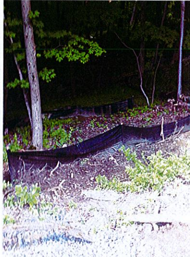
Silt fence downslope of west corner