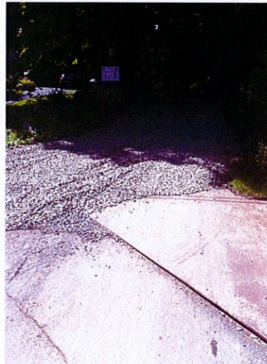
Construction entrance (notice steel plate lower right protecting adjacent driveway)