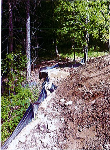
West corner of site