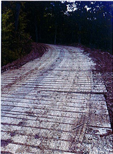
Temporary Timber mat access road