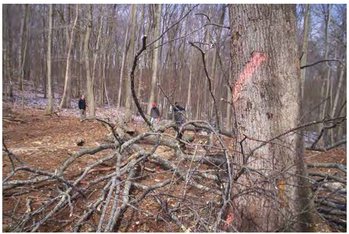
Photo 3: View of tree clearing activities. Date of photo January 29, 2014.

Tree Clearing Prior to Bat Seasonal Restrictive Period