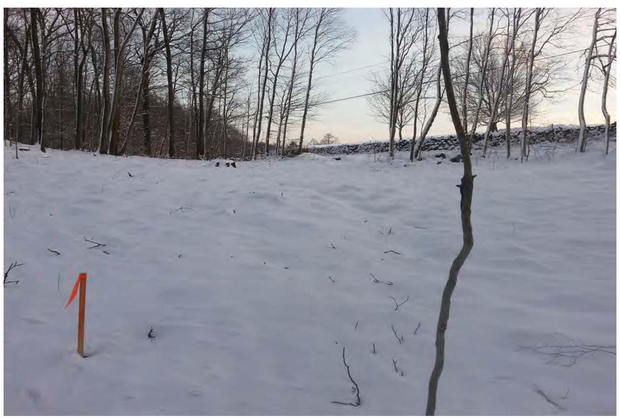
Photo 5: View of completed tree removal activities, looking southeast with Gallup Road in background. Photo date: February 3, 2014.

Tree Clearing Prior to Bat Seasonal Restrictive Period