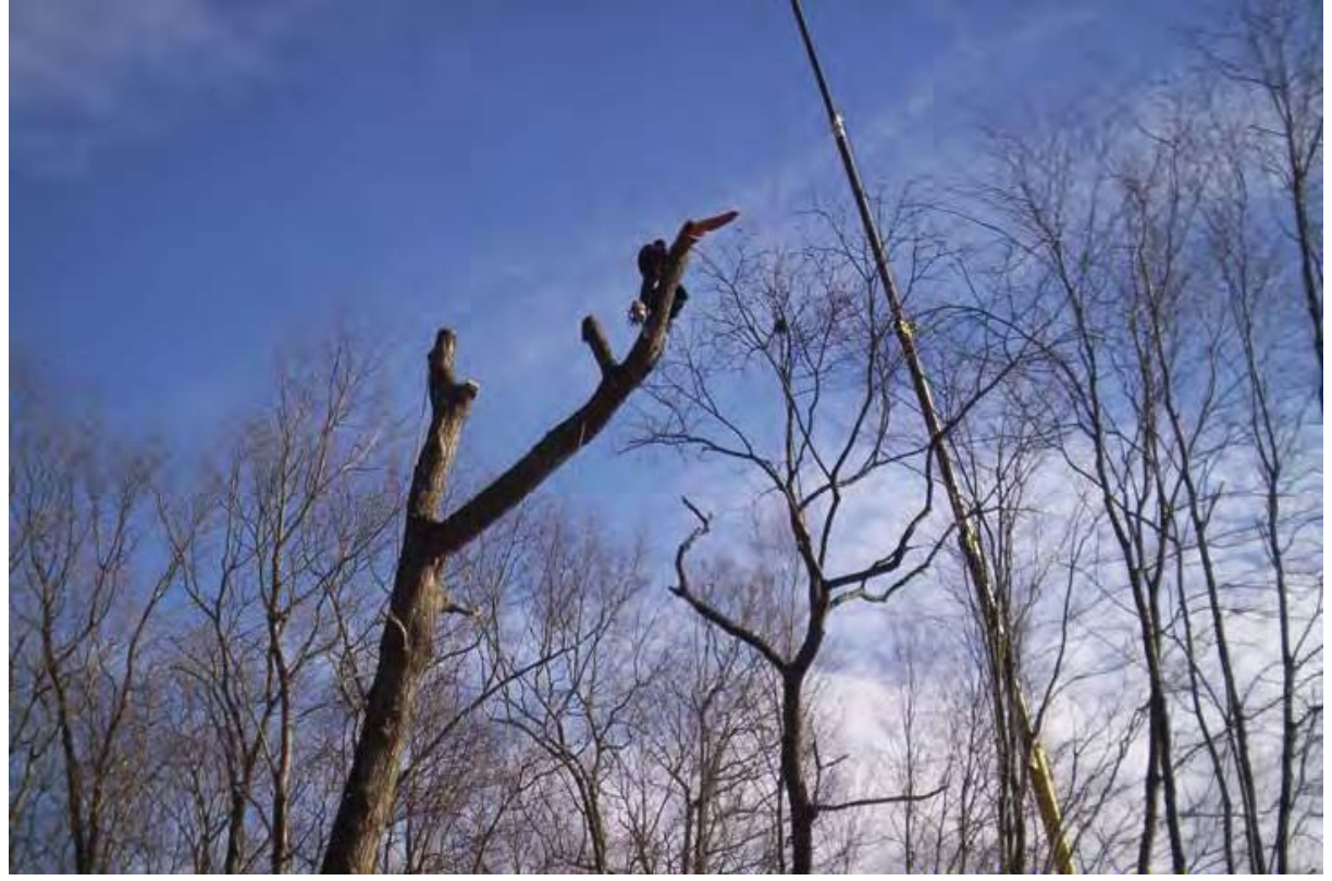
Photo 4: View of crane assist to remove larger trees, avoiding damage to nearby mature trees outside of clearing area. Date of photo January 29, 2014.