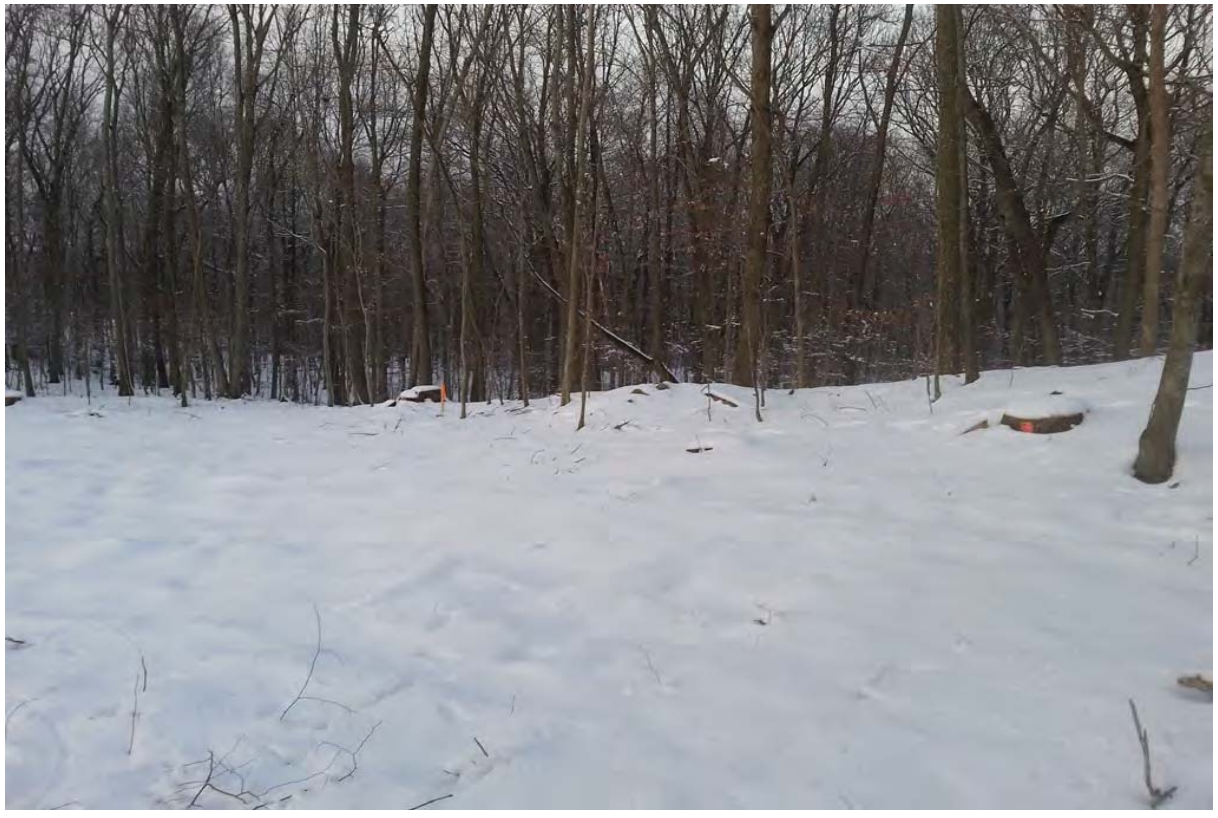
Photo 6: : View of completed tree removal activities, looking north. Photo date: February 3, 2014.