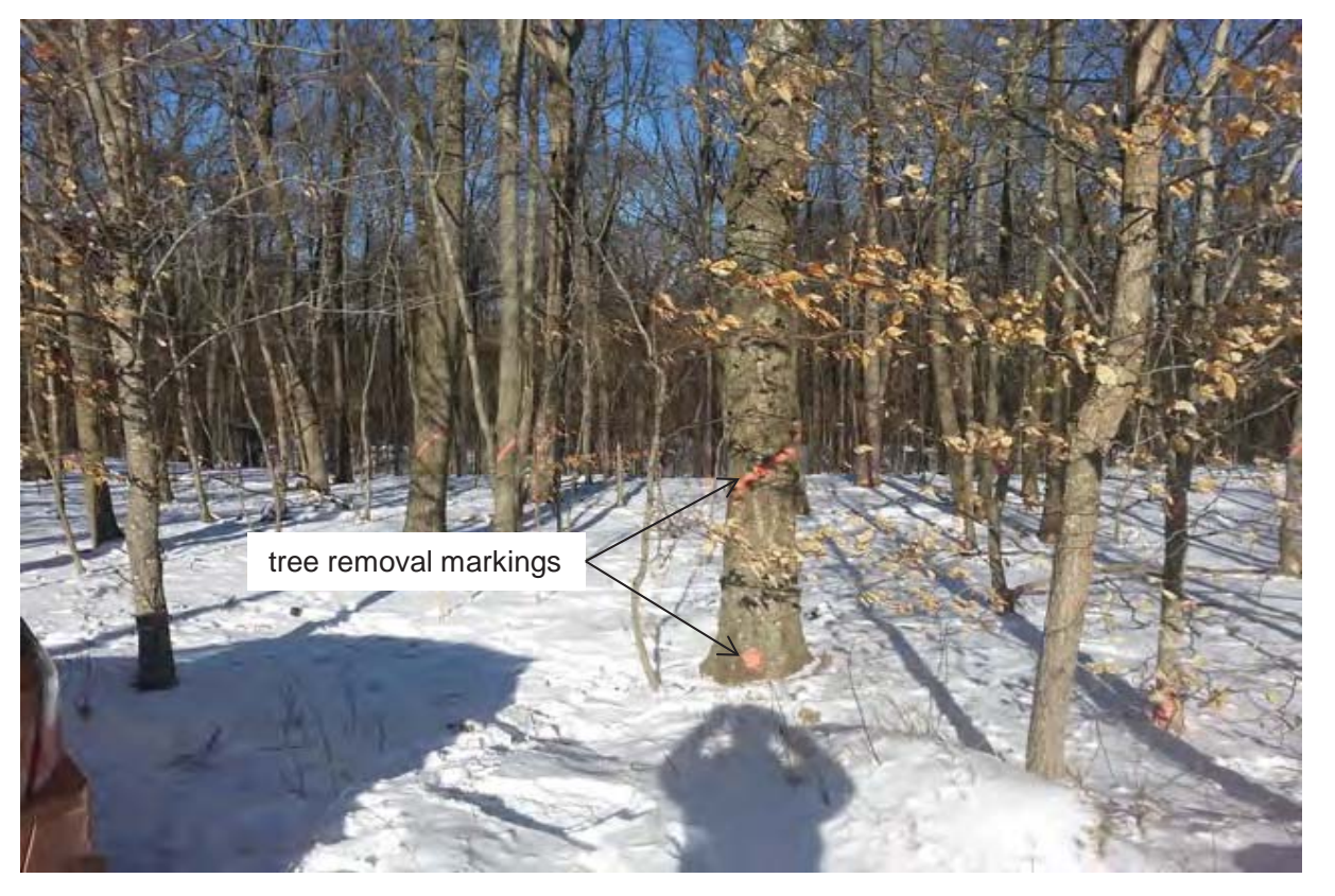
Photo 2: View of tree removal markings (orange paint markings: hash mark symbol at chest height and dot at base). Photo date: 01/23/14