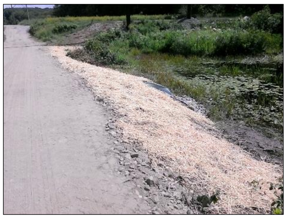
Photo #8: Culvert installed under access road to Str 120. Disturbed area temporarily stabilized with straw. (8/26)