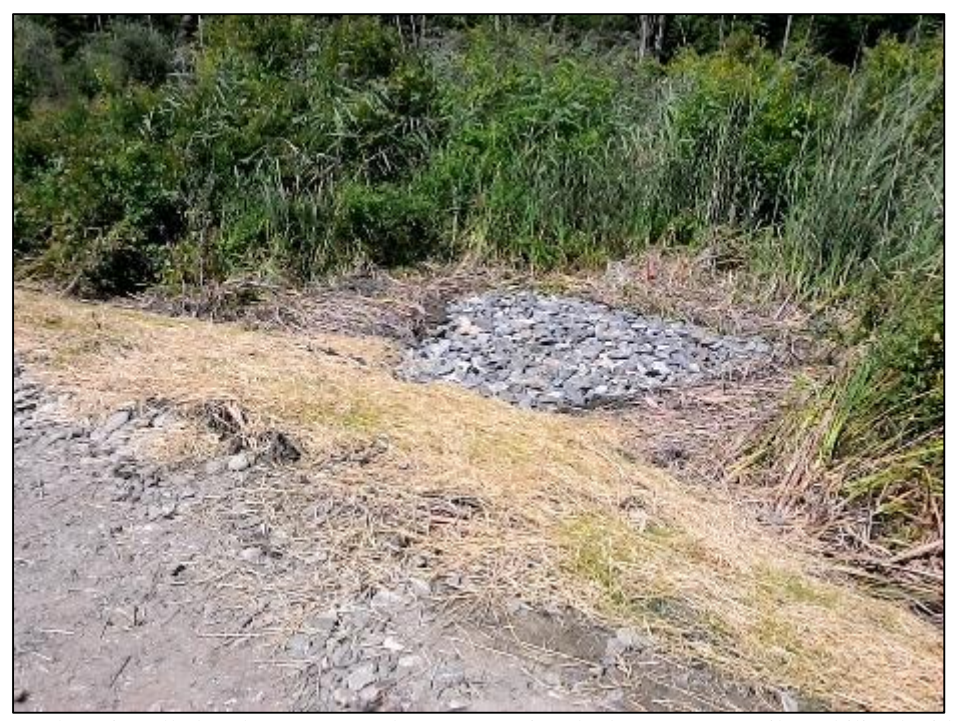
Photo #10: Culvert installed under access road to Str 47. Disturbed area temporarily stabilized with straw. (8/26)