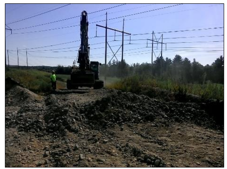
Photo #7: Road removal at Str 260 as part of restoration operations. (8/26)