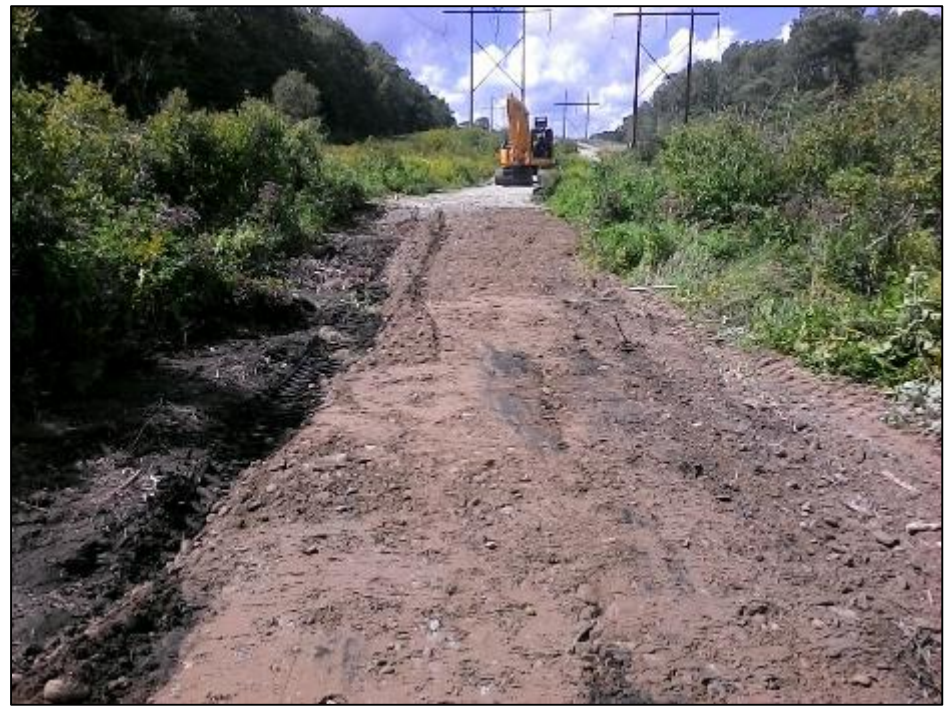
Photo #9: Area of culvert installation under access road to Str 117 excavated. (8/26)