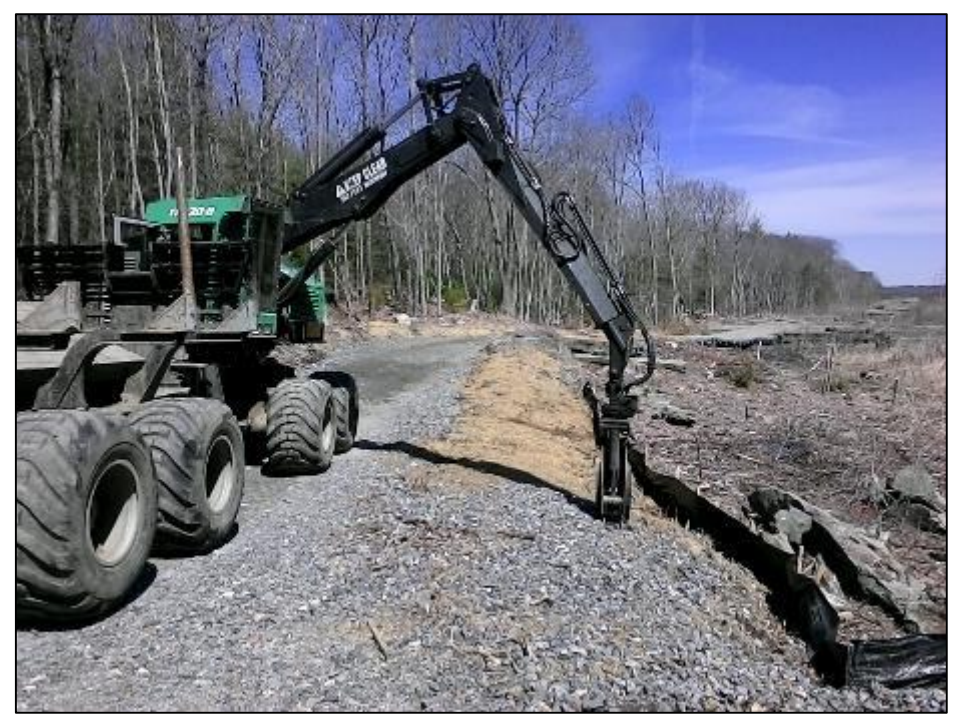
Photo #5: Preparing for mat removal at Str 310 for pad reconstruction. (4/16)