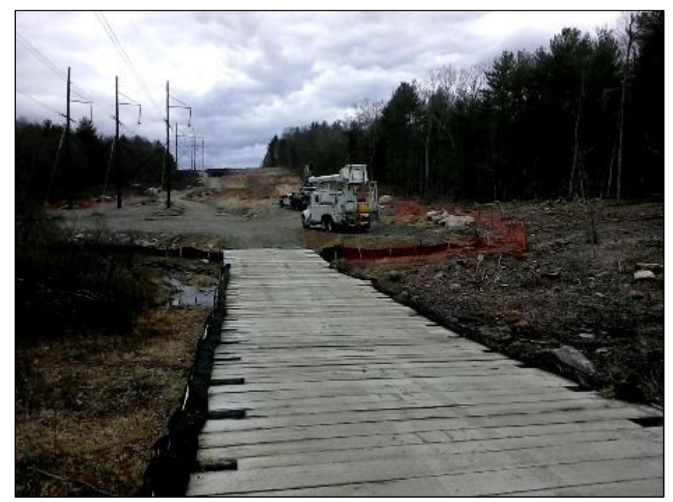
Photo #11: Awaiting delivery of structure steel at Str 337 pad. (4/23)