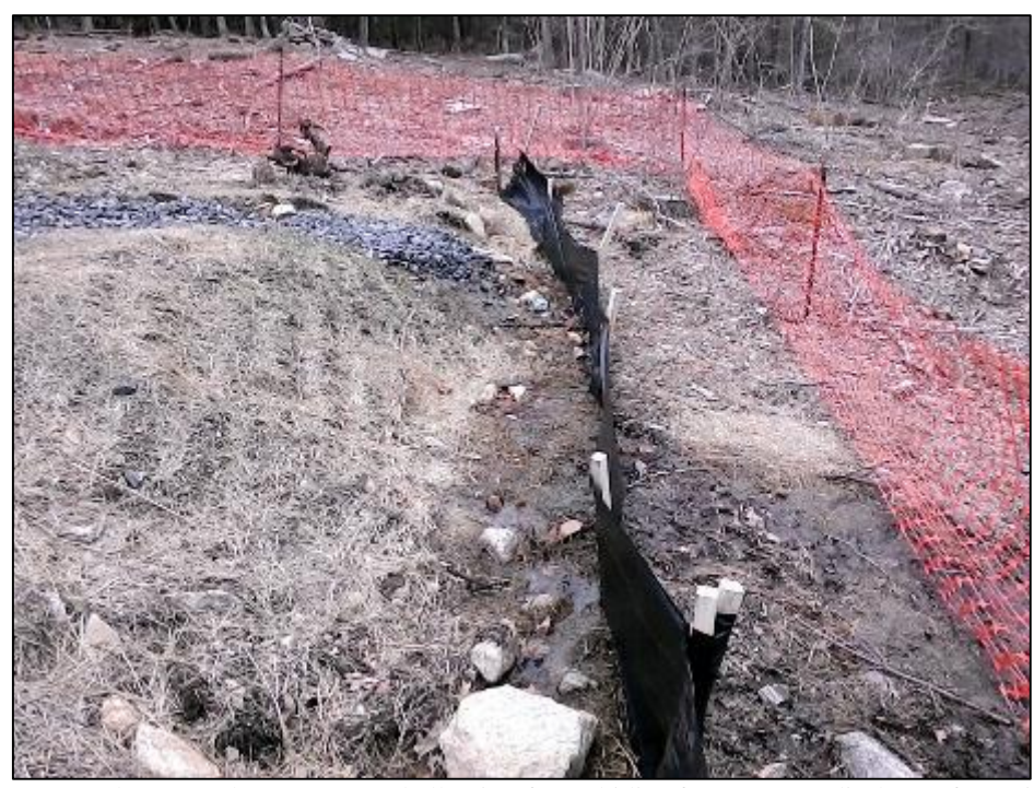
Photo #12: Plunge pool at Str 337 pad allowing for turbidity-free water to discharge from site. (4/23)