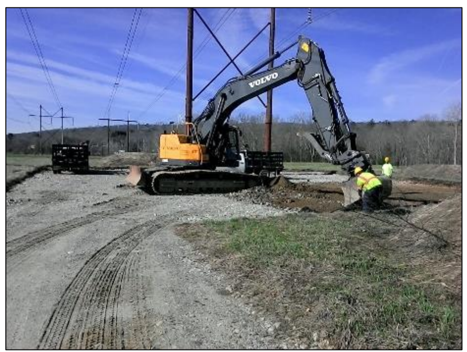
Photo #1: Beginning restoration of Str 76 with pad removal. (4/16)