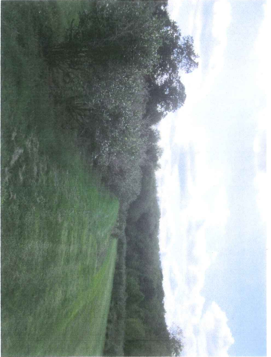
West View Evergreen Berry Farm