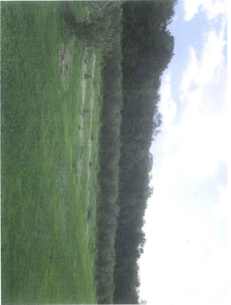
South View Evergreen Berry Farm (threatened by cell tower 100' over existing tree canopy)