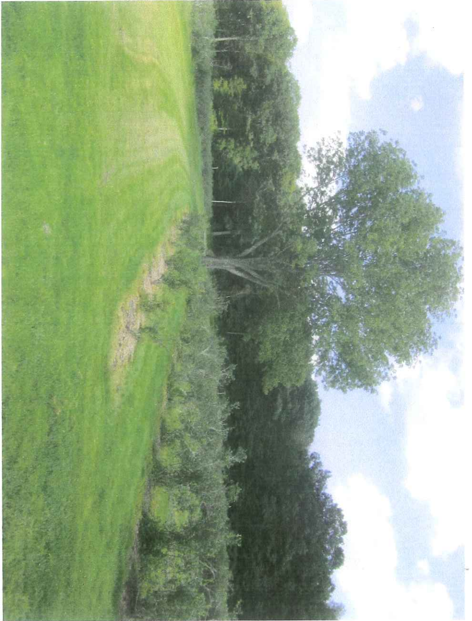
East View Evergreen Berry Farm