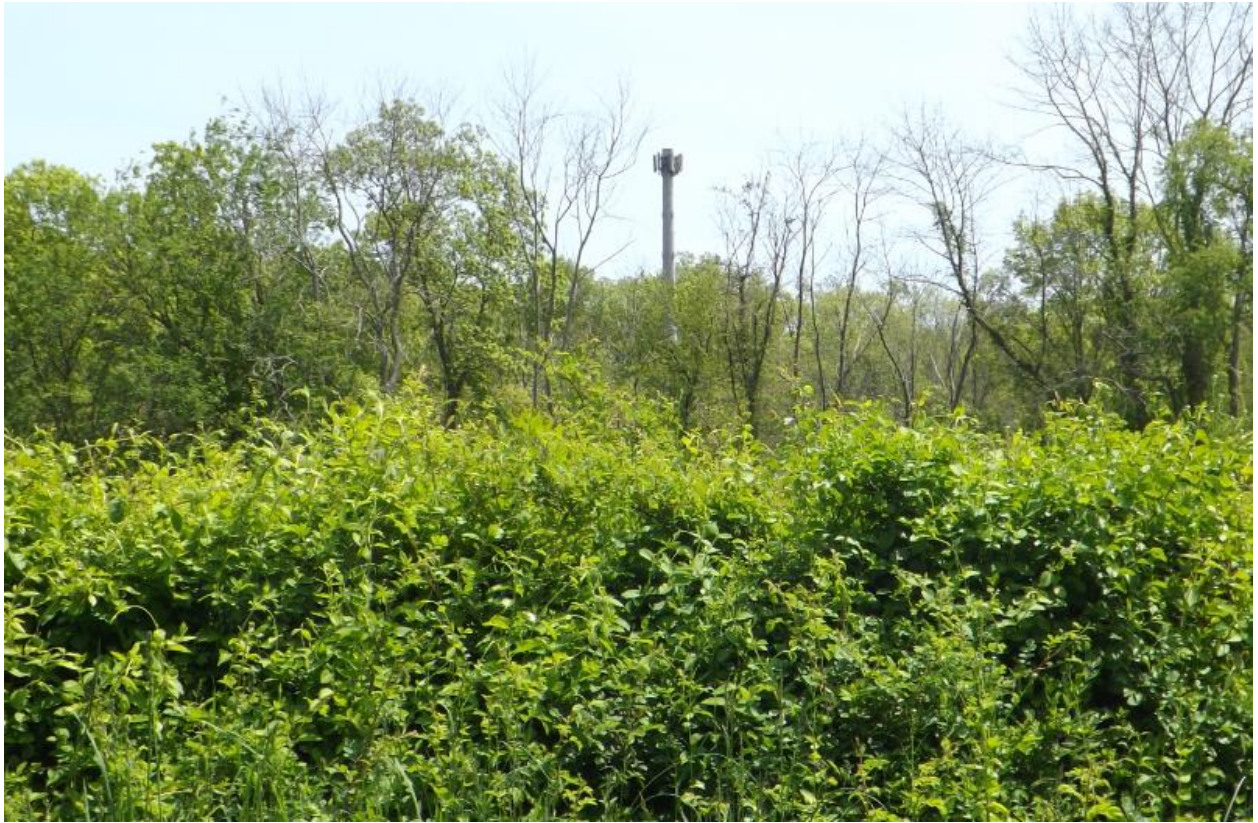
View of tower across salt marsh north of Shell Beach Road.