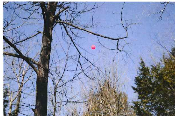
Upper Driveway Entrance