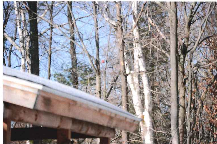
Front of house/porch