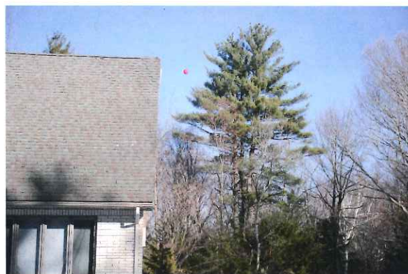
Rear of house