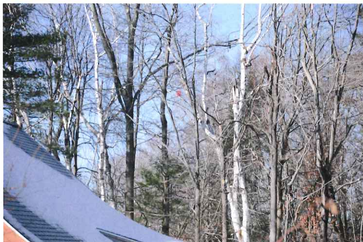
Mid driveway/Front yard