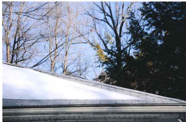
Back of house from patio area