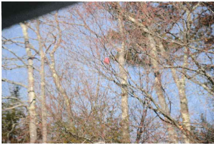
Kitchen window from table area