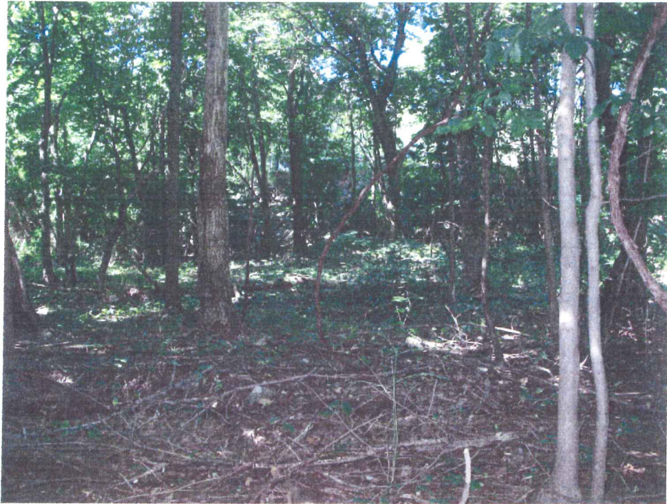
Photo 1 of 3: "Dry" wetland at W-1 through W-18. Dominant plants are upland or facultative species.