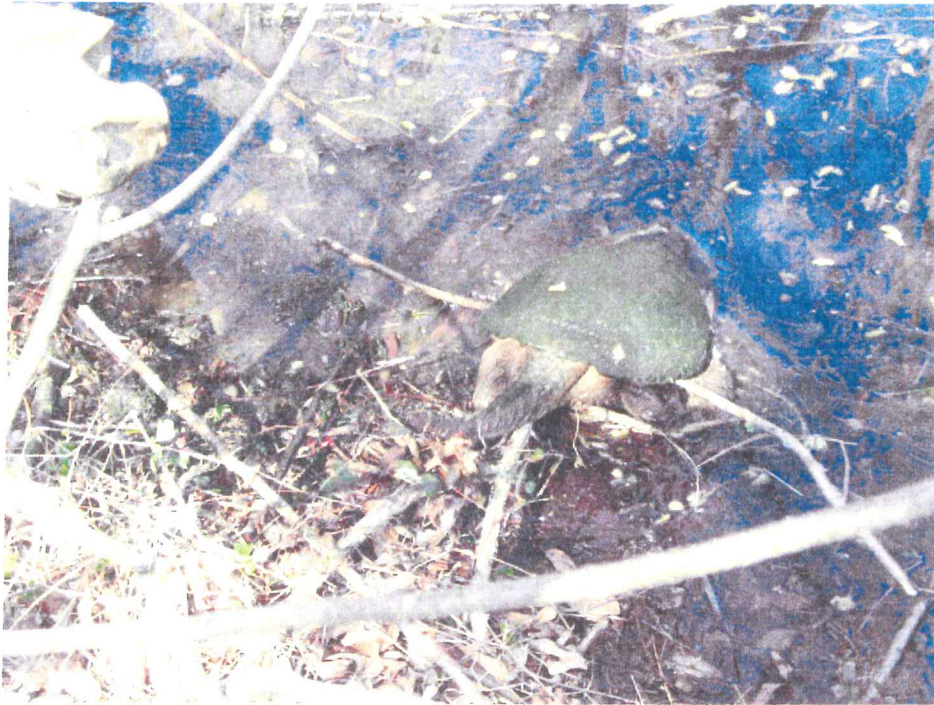
A large snapping turtle in the retention pond. Painted turtles were also observed.