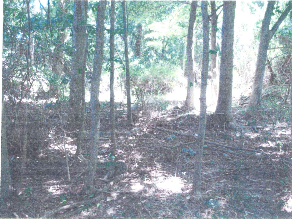
"Dry" wetlands near W-120a.