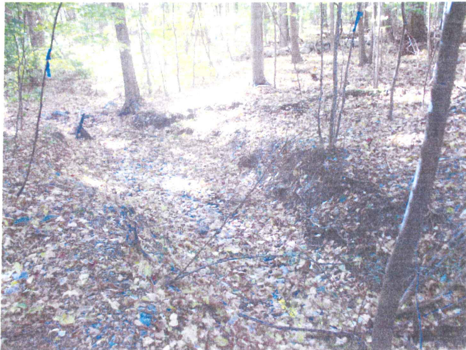
The retention pond exits into a small watercourse flowing off site to the south.