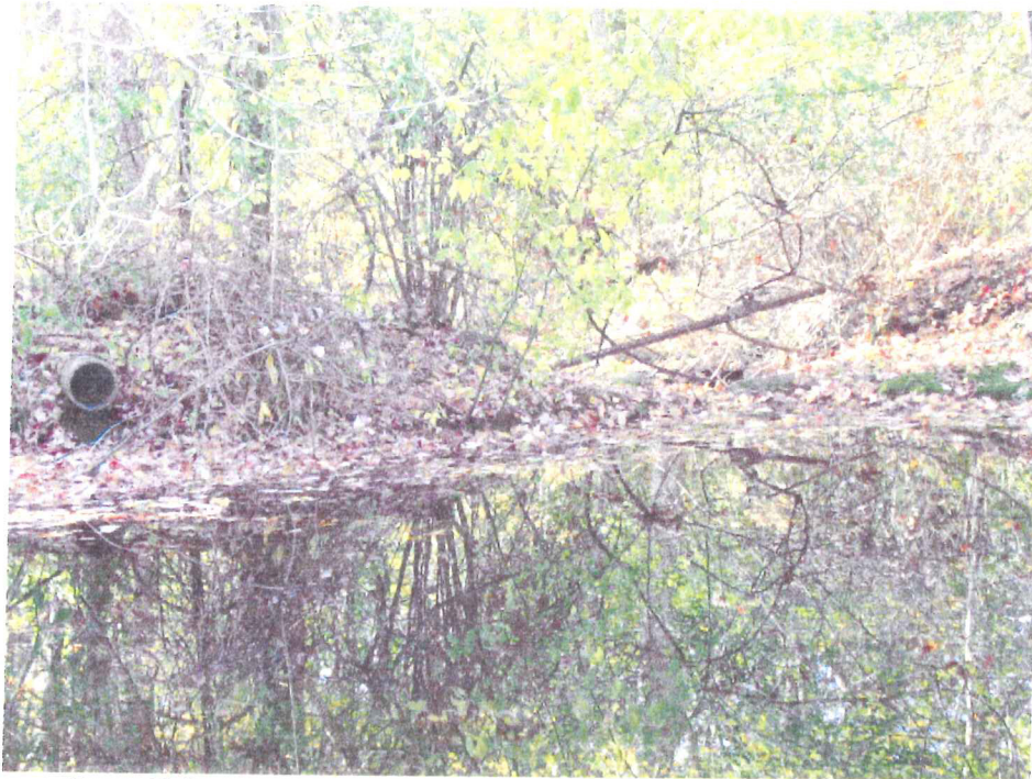
Runoff from cinema parking lots enters the retention pond via a concrete pipe.