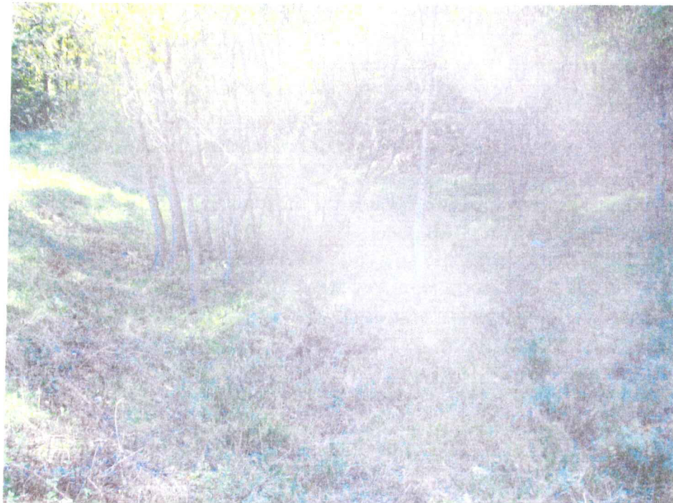
Runoff from cinema parking lots was filtered through a broad vegetated swale.