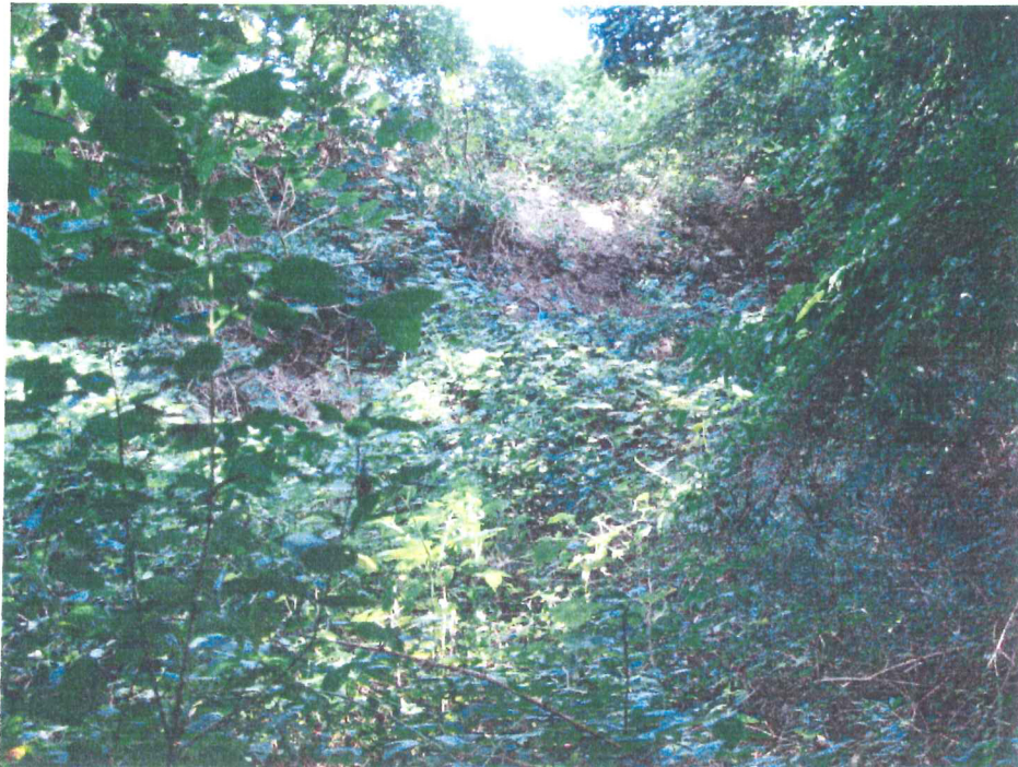
Photo 3 of 3: Riprap slope supporting former cinema parking in background (near W-4).