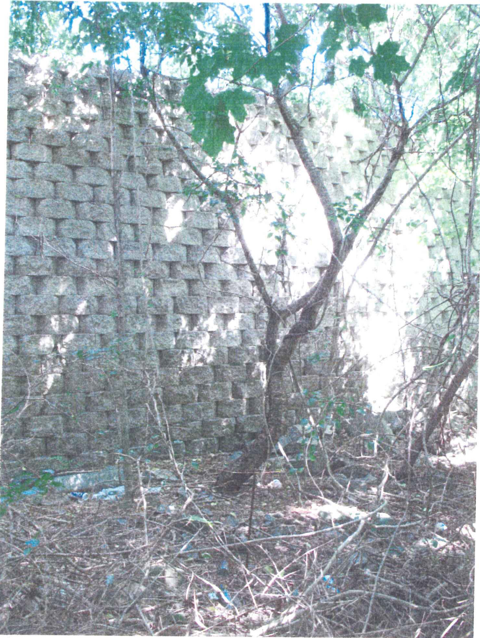
Photo 1 of 2: Base of retaining wall at W-8 showing very thin understory.