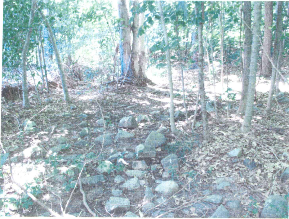
Photo 1 of 2: Intermittent watercourse at W-149 near proposed widening of access drive.