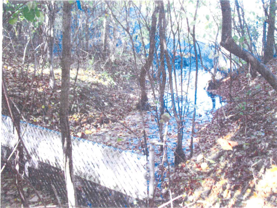
The retention pond exits through a control structure.