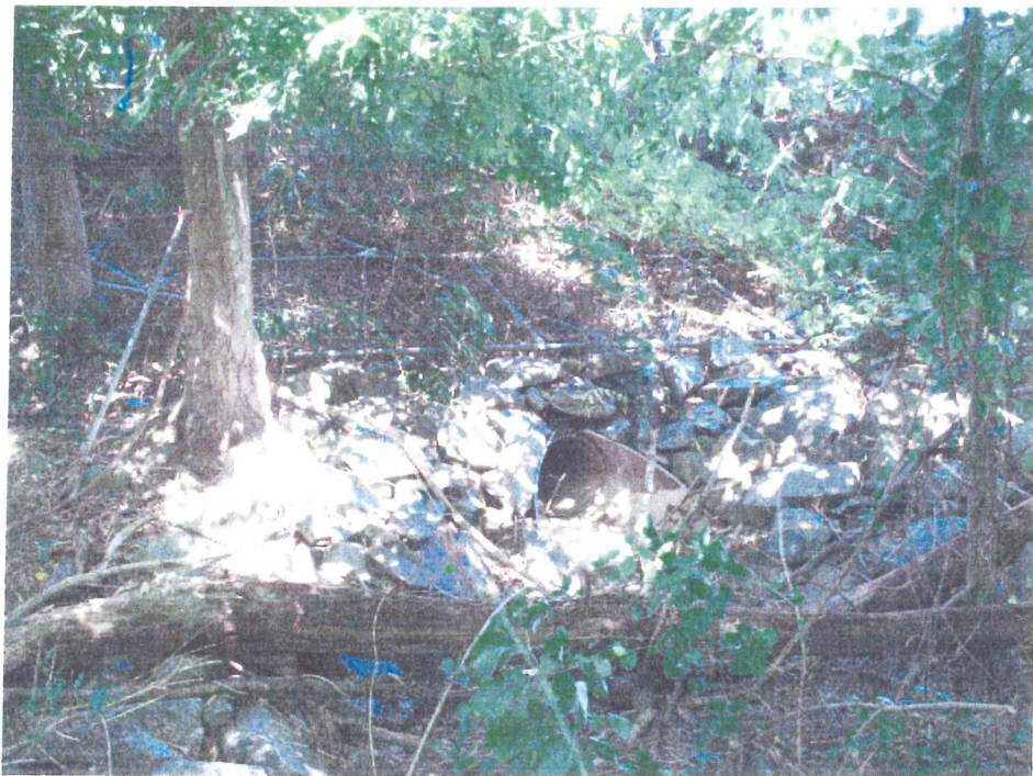
Drainage outlet from parking lots (near W-123a) supplies intermittent hydrology.