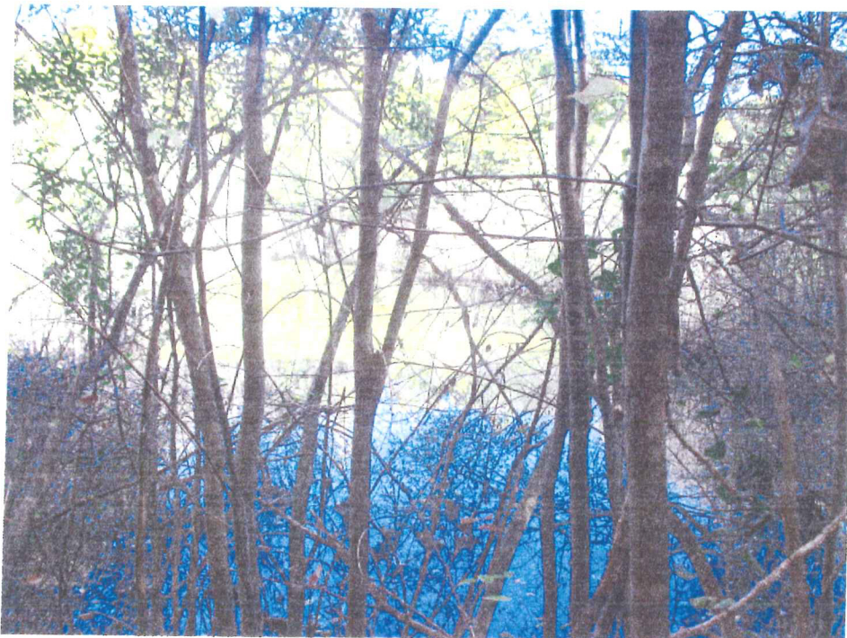
A view of part of the retention pond from the south side near the outfall.