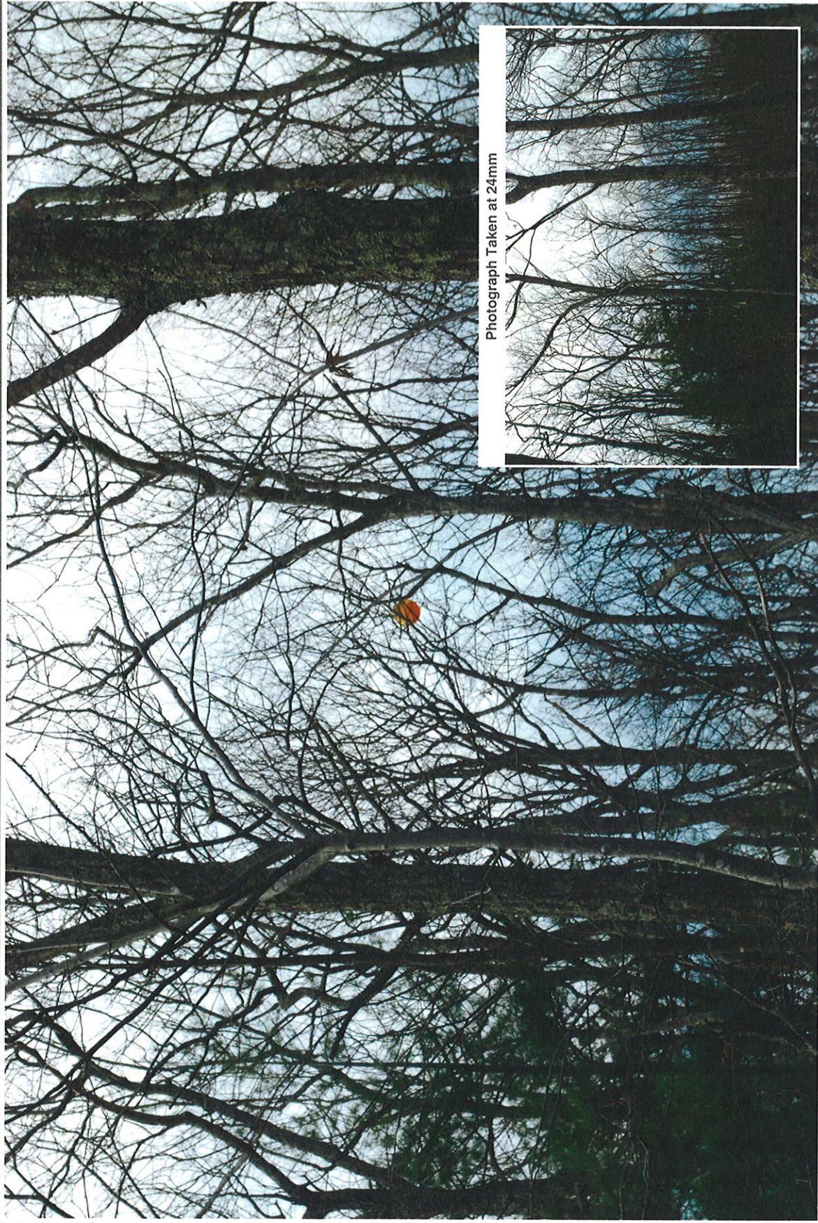
Photograph Taken at 24mm