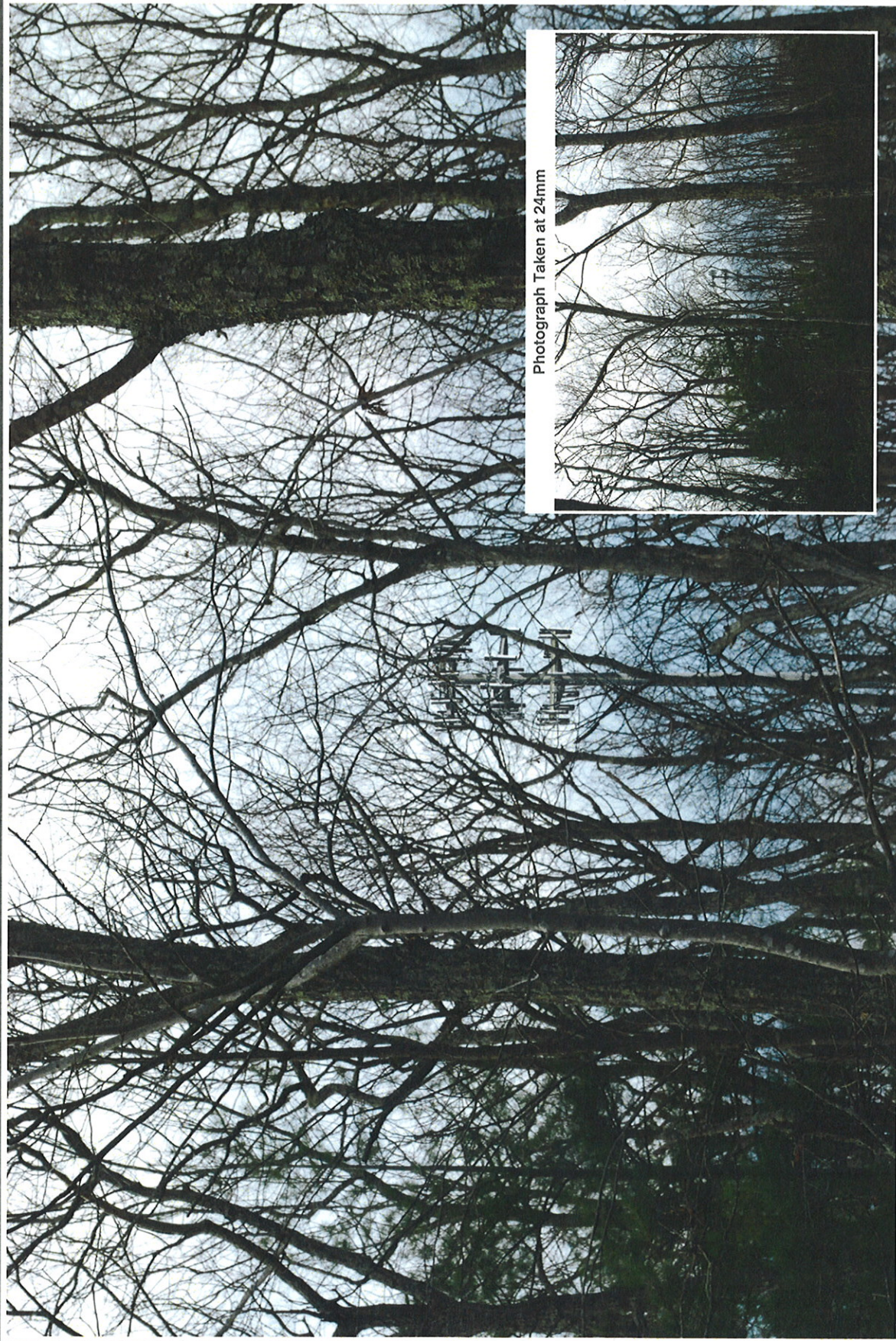
Photograph Taken at 24mm