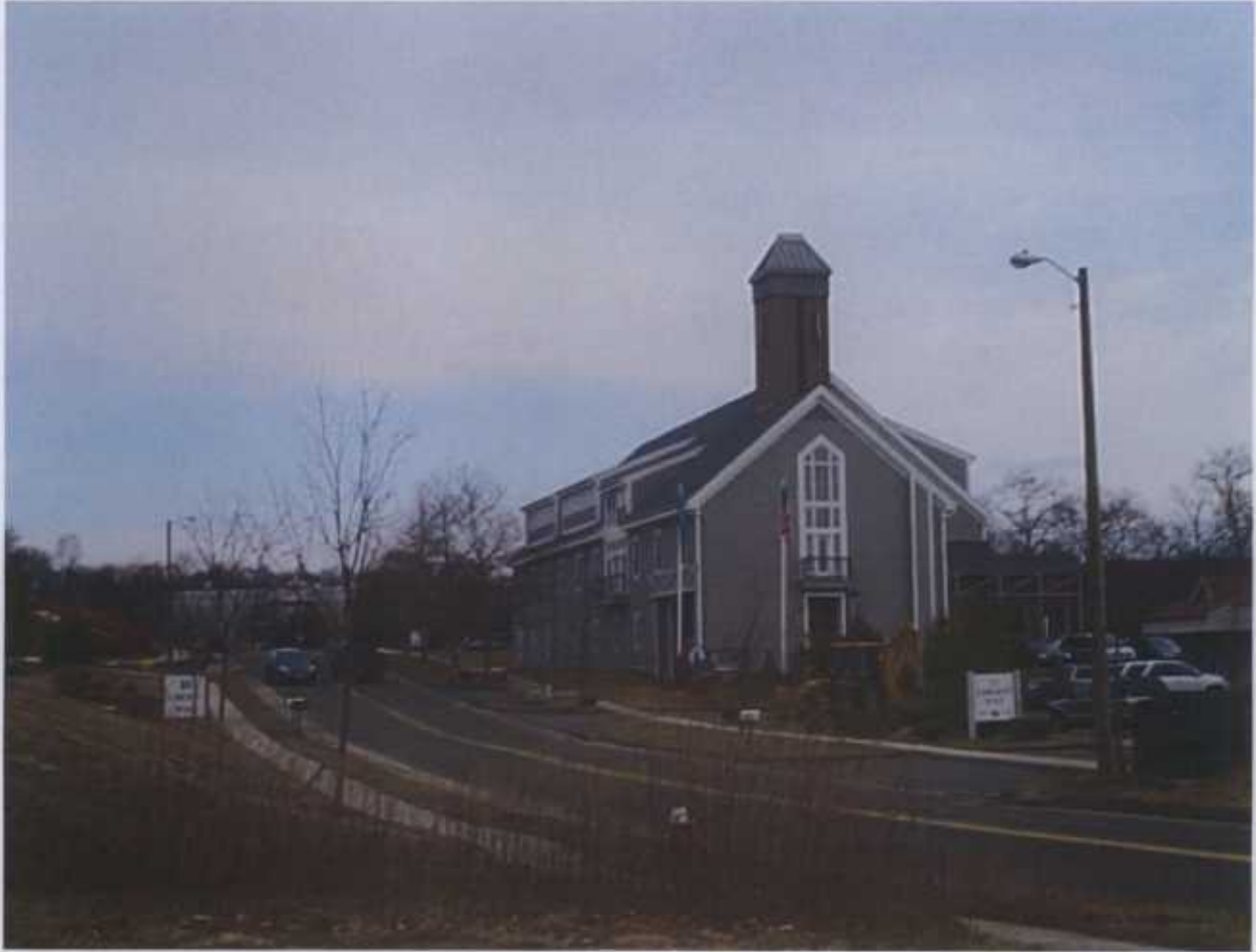
Existing AT&T site at 15 Liberty Way, East Lyme, Connecticut (antennas flush mounted to existing building)