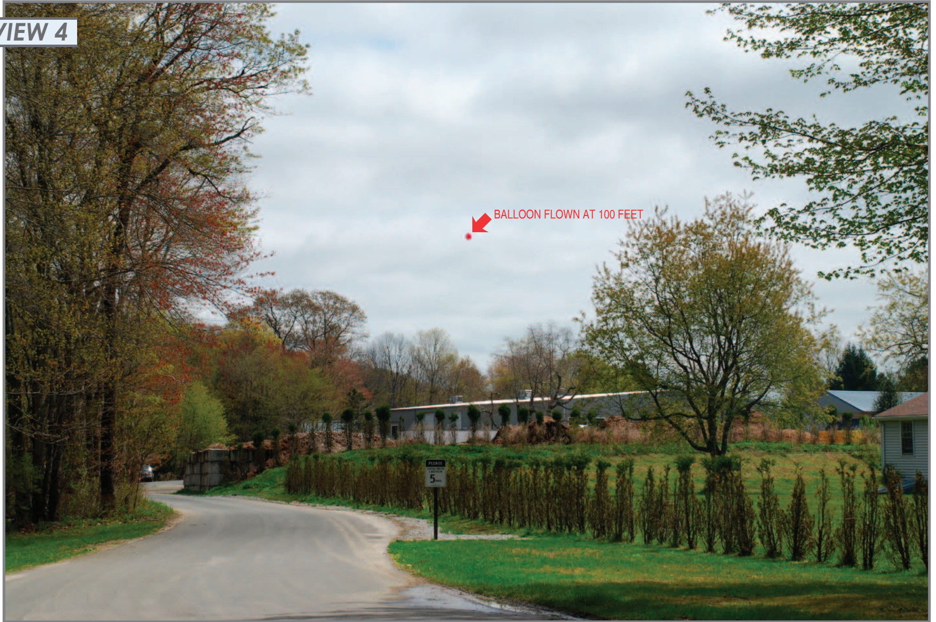
PHOTO TAKEN FROM BUTTONBALL ROAD AT ENTRANCE TO HOST PROPERTY, LOOKING EAST DISTANCE FROM THE PHOTOGRAPH LOCATION TO SITE IS 0.18 MILE +/-

ct:\mddat\40505.06\graphics\FIGURES\40505.06_Photosim.indd