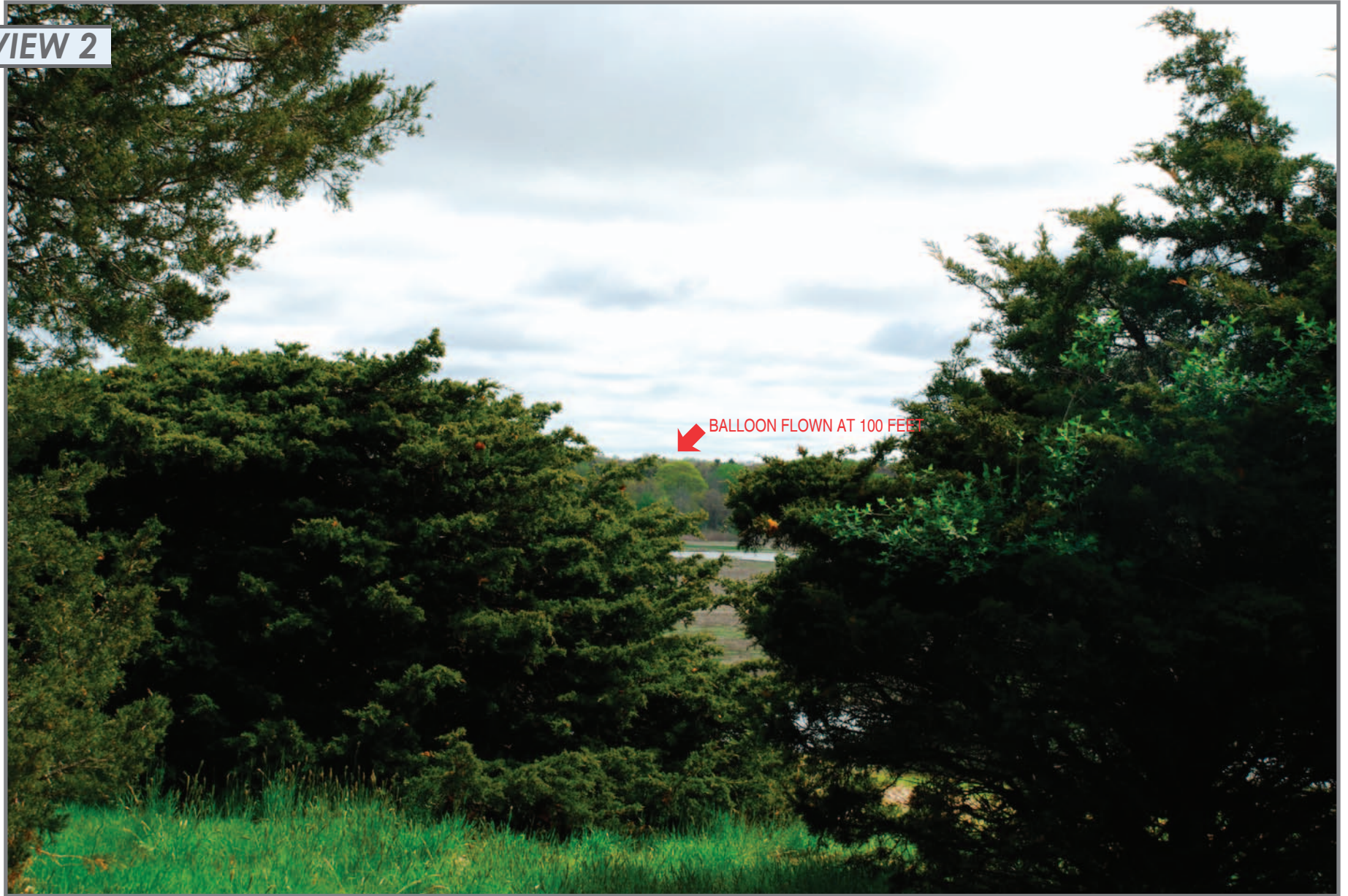
PHOTO TAKEN FROM SMITH NECK ROAD ADJACENT TO HOUSE #47, LOOKING NORTHEAST DISTANCE FROM THE PHOTOGRAPH LOCATION TO SITE IS 1.25 MILES +/-

ct:\mddat\40505.06\graphics\FIGURES\40505.06_Photosim.indd