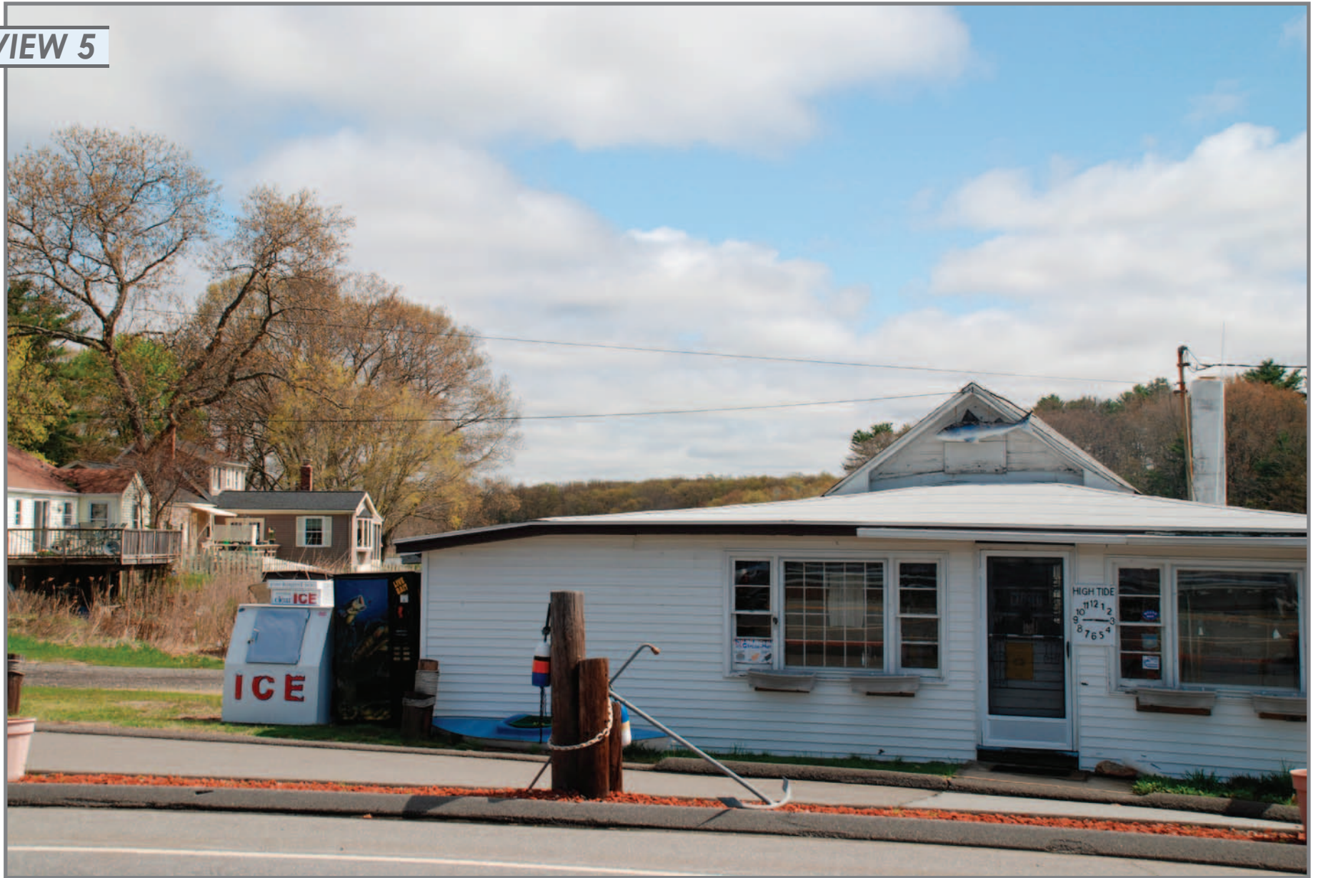
PHOTO TAKEN FROM SHORE ROAD (ROUTE 156) SOUTH OF HOMESTEAD CIRCLE, LOOKING NORTHEAST BALLOON IS NOT VISIBLE

DISTANCE FROM THE PHOTOGRAPH LOCATION TO SITE IS 0.75 MILE +/-