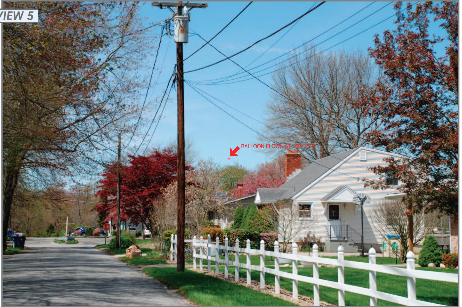
PHOTO TAKEN FROM CENTER BEACH AVENUE ADJACENT TO HOUSE #14, LOOKING NORTH DISTANCE FROM THE PHOTOGRAPH LOCATION TO SITE IS 0.26 MILE +/-

ct:\mddat\40505-08\graphics\FIGURES\40505-08_Photos\im.indd