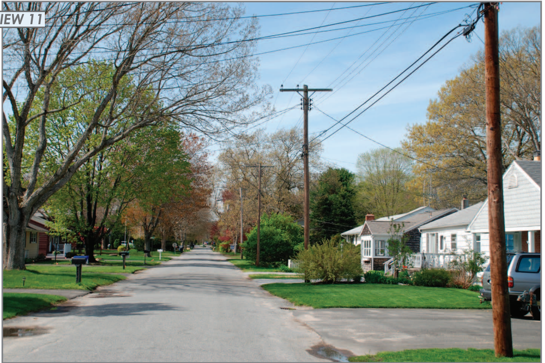
PHOTO TAKEN FROM CENTER BEACH AVENUE ADJACENT TO HOUSE #40, LOOKING NORTHWEST - BALLOON IS NOT VISIBLE DISTANCE FROM THE PHOTOGRAPH LOCATION TO SITE IS 0.40 MILE +/-

ct:\mddat\40505.08\graphics\FIGURES\40505.08_Photosim.indd