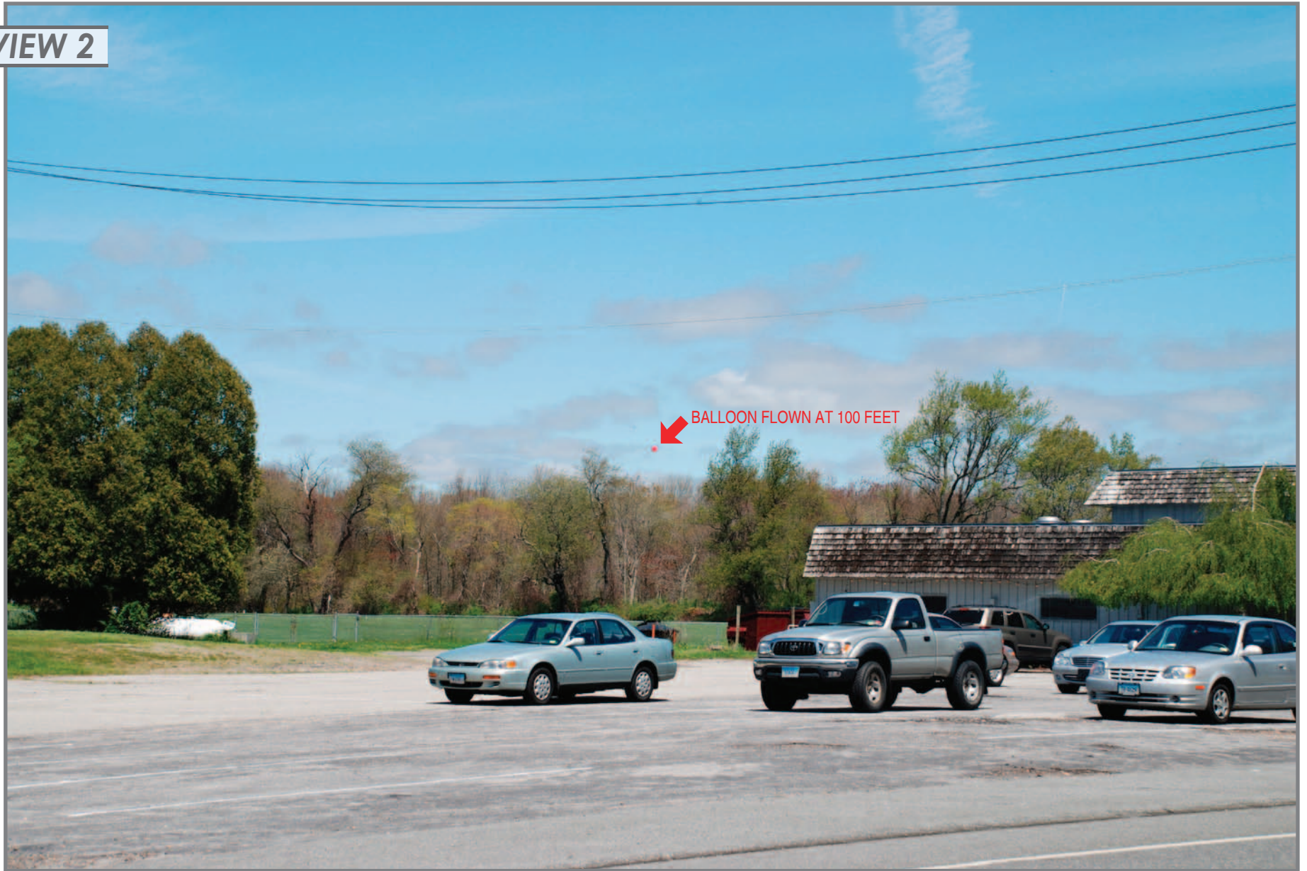
PHOTO TAKEN FROM ROUTE 156 (SHORE ROAD) AT DOGWOOD DRIVE, LOOKING NORTHEAST DISTANCE FROM THE PHOTOGRAPH LOCATION TO SITE IS 0.29 MILE +/-

ct:\mddat\40505-08\graphics\FIGURES\40505-08_Photosim.indd