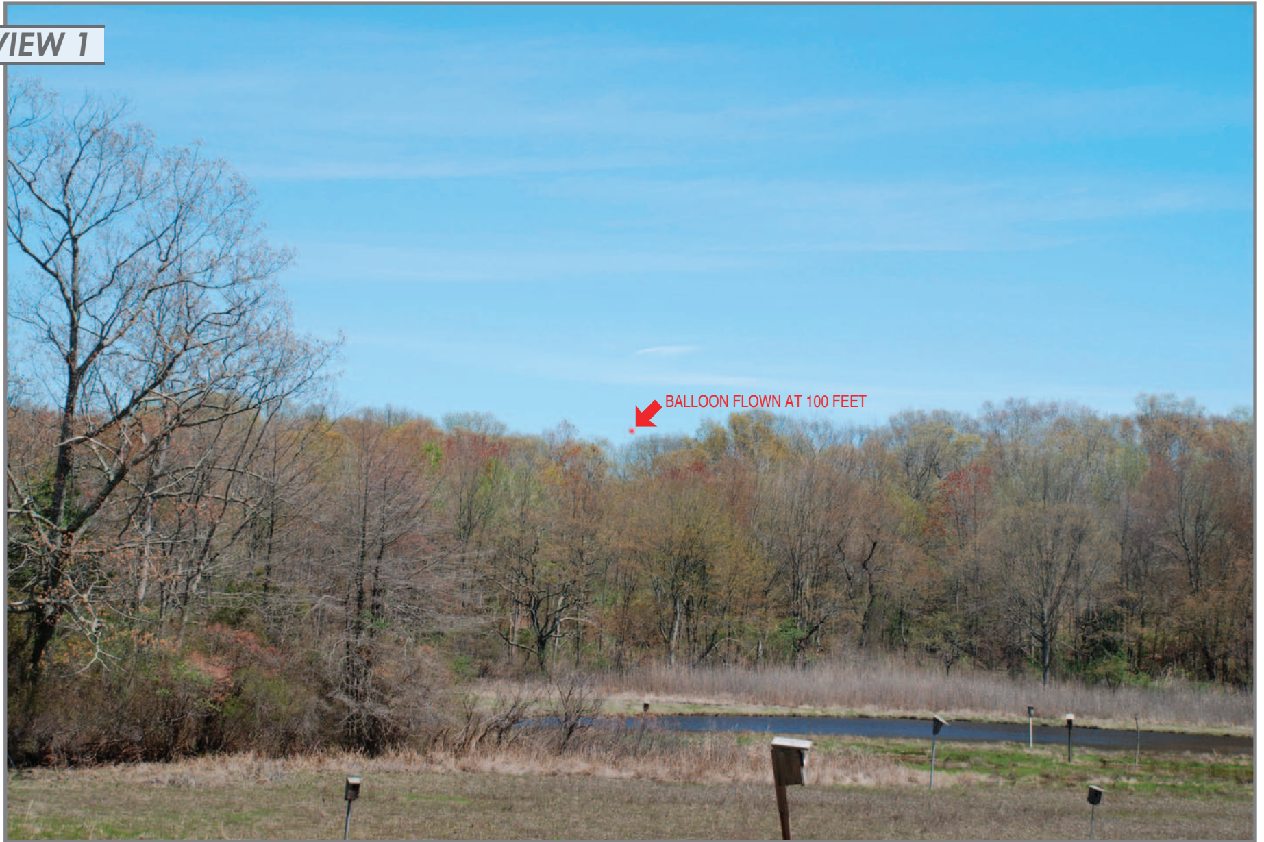
PHOTO TAKEN FROM OTTER ROCK ROAD ADJACENT TO HOUSE #14, LOOKING EAST DISTANCE FROM THE PHOTOGRAPH LOCATION TO SITE IS 0.28 MILE +/-

ct:\mddat\40505.08\graphics\FIGURES\40505.08_Photosim.indd