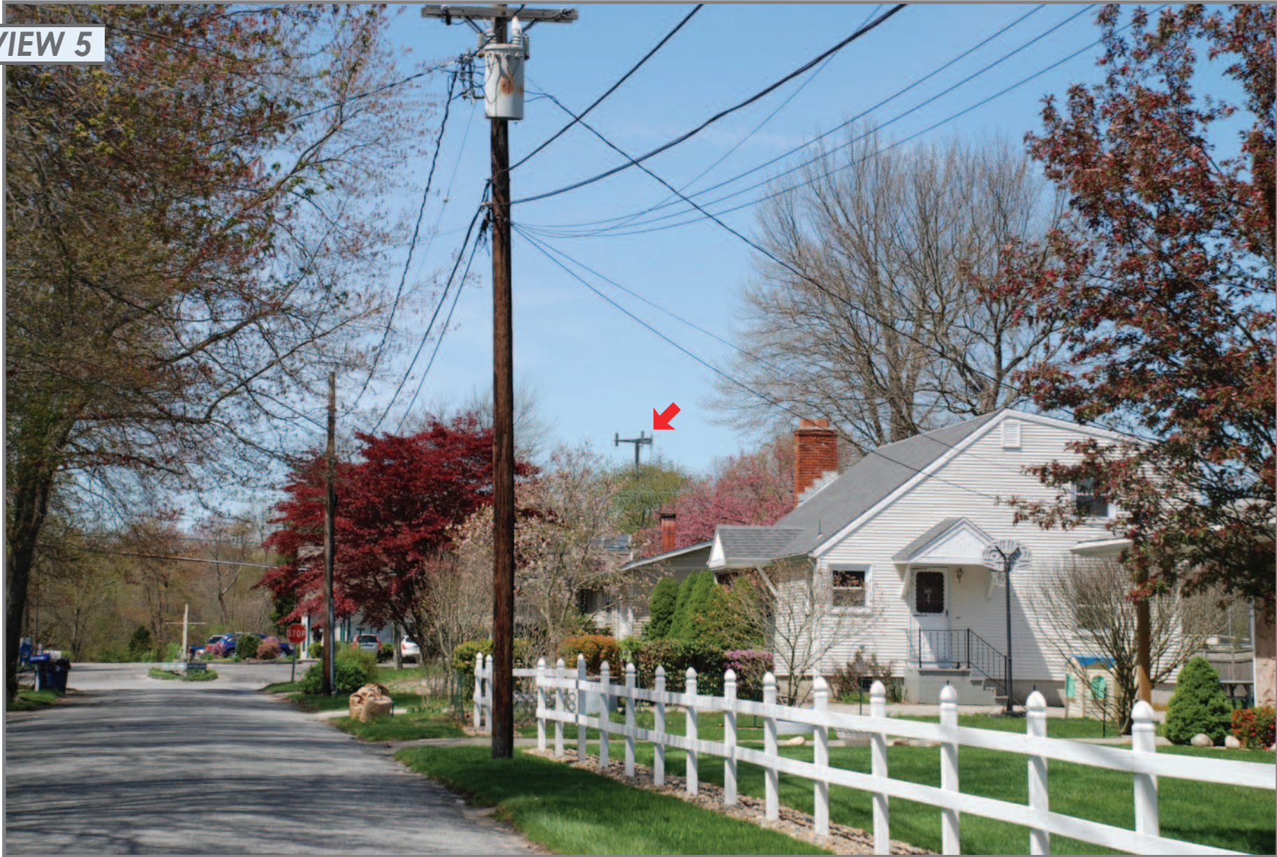
PHOTO TAKEN FROM CENTER BEACH AVENUE ADJACENT TO HOUSE #14, LOOKING NORTH DISTANCE FROM THE PHOTOGRAPH LOCATION TO SITE IS 0.26 MILE +/-

ct:\mddat\40505.08\graphics\FIGURES\40505.08_Photosim.indd