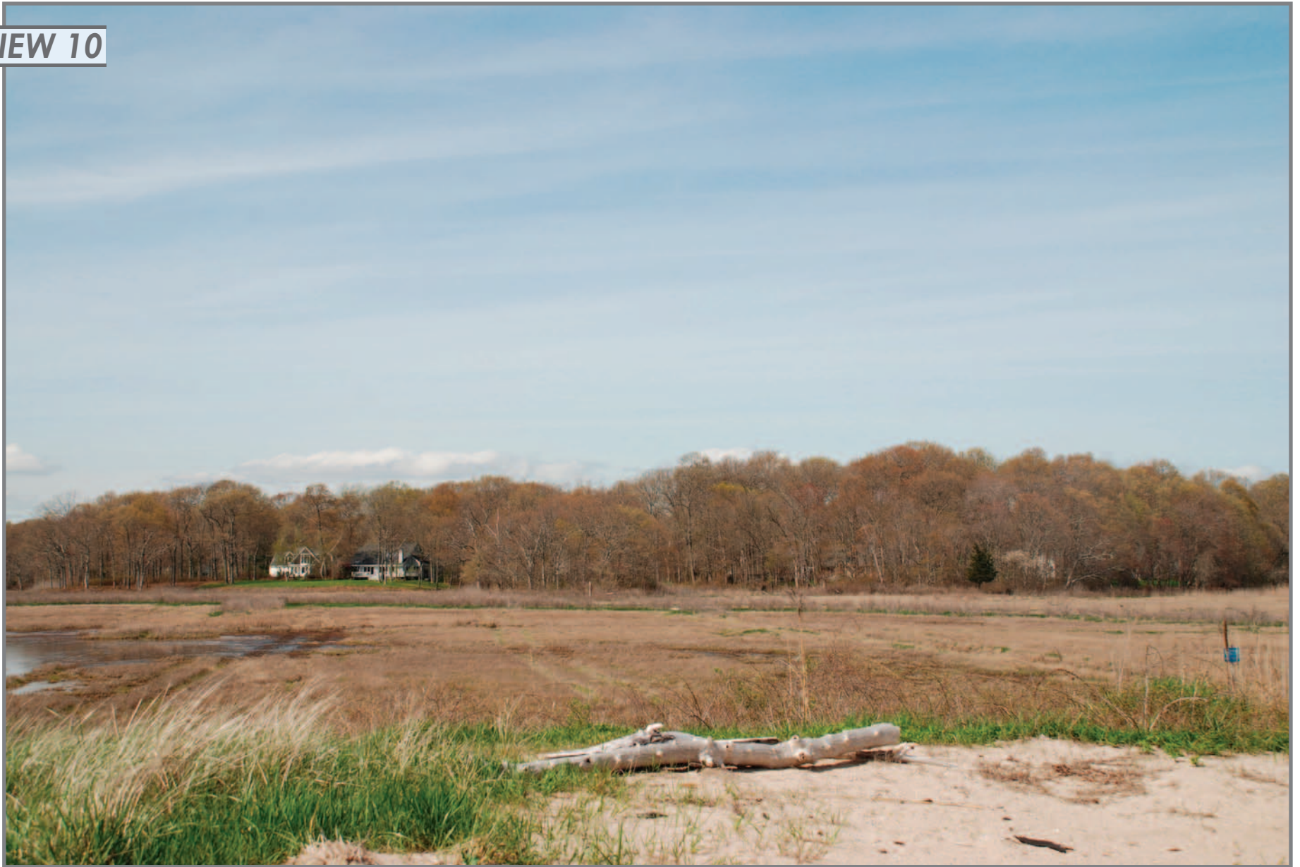
PHOTO TAKEN FROM WEST END DRIVE ADJACENT TO HOUSE #82, LOOKING NORTHEAST - BALLOON IS NOT VISIBLE DISTANCE FROM THE PHOTOGRAPH LOCATION TO SITE IS 0.76 MILE +/-

ct:\mddat\40505-08\graphics\FIGURES\40505-08_Photosim.indd