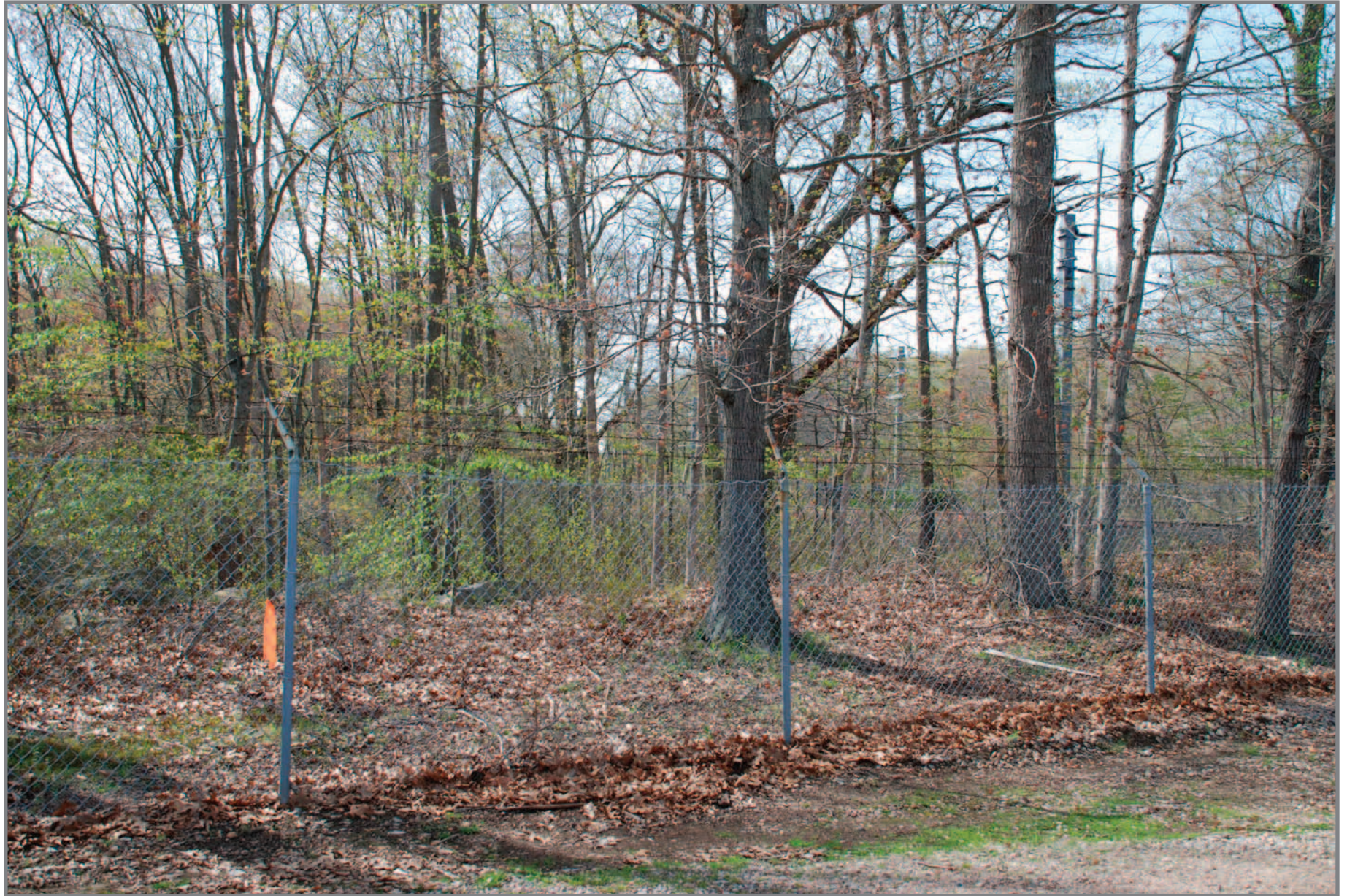
PROPOSED PROJECT AREA

c:\mddat\40505-08\graphics\FIGURES\40505-08_Photos\m.indd