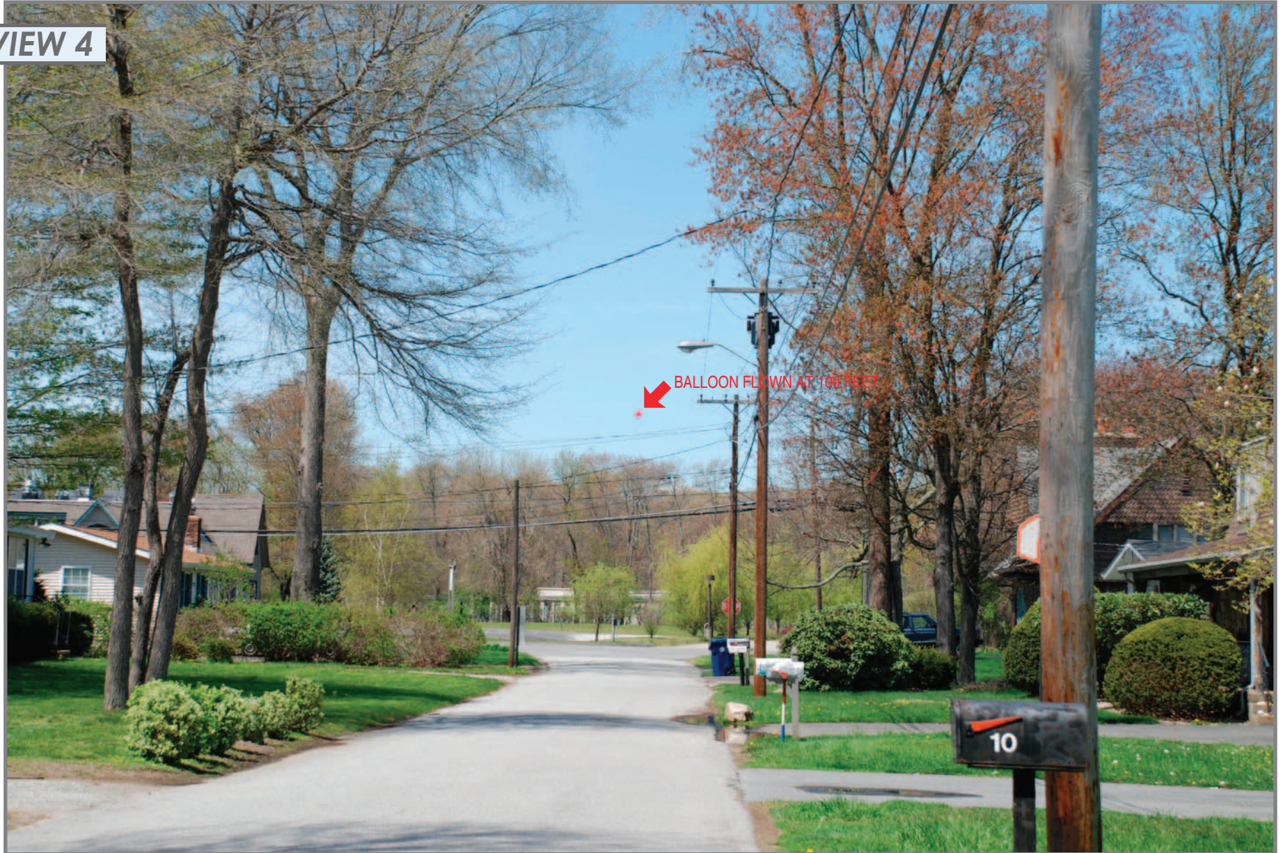
PHOTO TAKEN FROM HAWKS NEST ROAD ADJACENT TO HOUSE #10, LOOKING NORTHWEST DISTANCE FROM THE PHOTOGRAPH LOCATION TO SITE IS 0.17 MILE +/-

ct:\mddat\40505.08\graphics\FIGURES\40505.08_Photos\im.indd