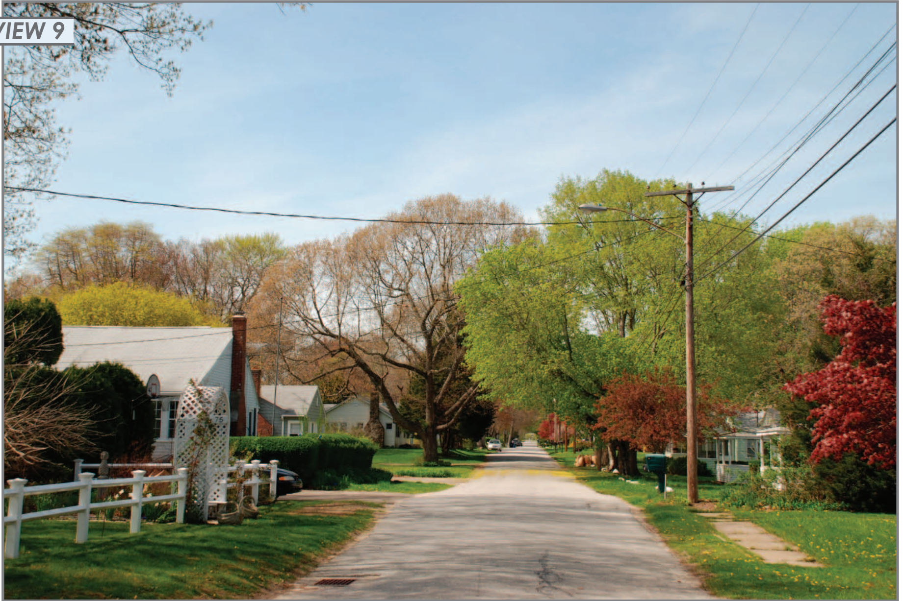
PHOTO TAKEN FROM HAWKS NEST ROAD NORTH OF AVENUE A, LOOKING NORTHWEST - BALLOON IS NOT VISIBLE DISTANCE FROM THE PHOTOGRAPH LOCATION TO SITE IS 0.59 MILE +/-

ct:\mddat\40505.08\graphics\FIGURES\40505.08_Photosim.indd