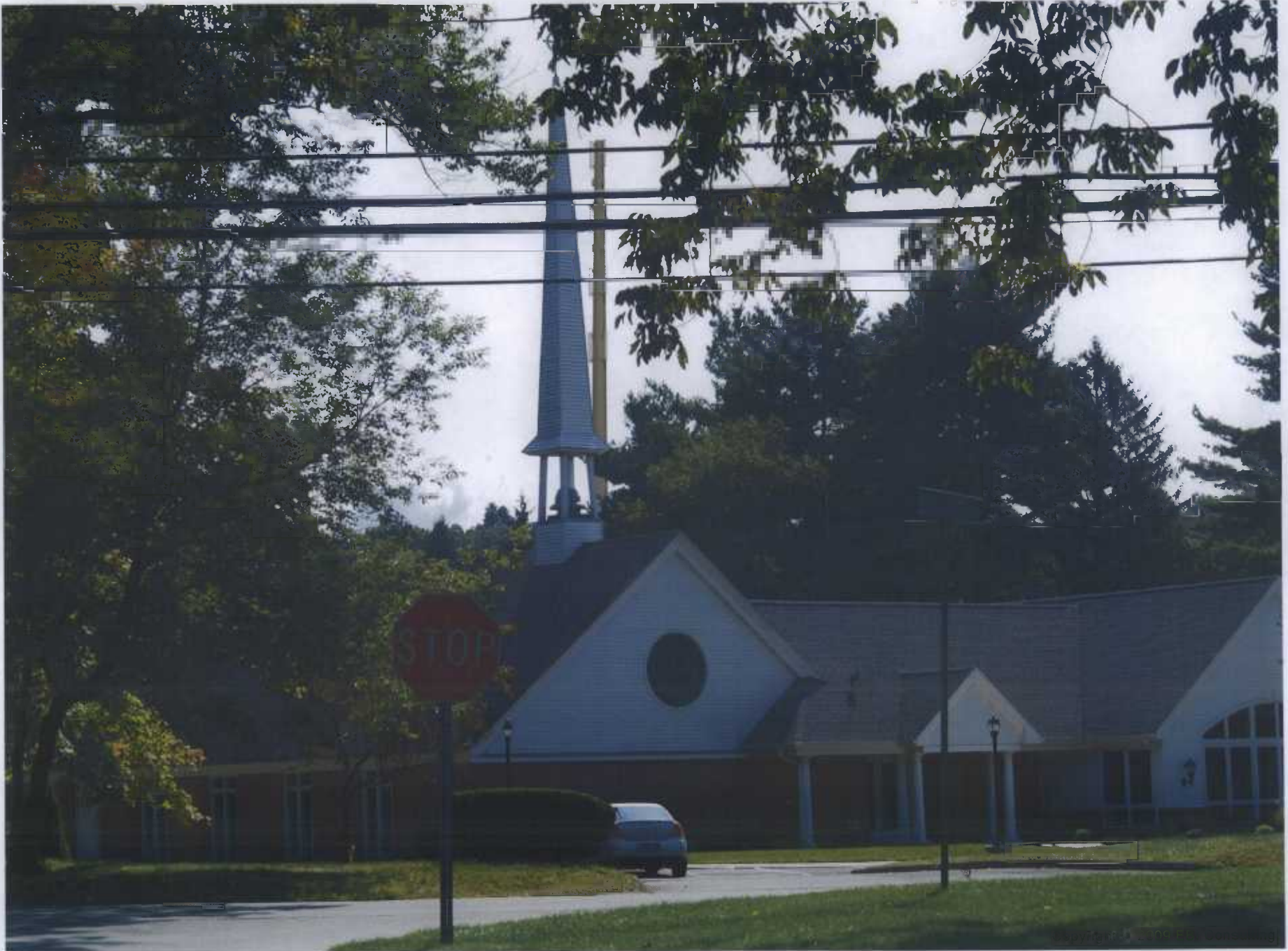
PROPOSED 100' MONOPOLE | LOOKING SOUTHEAST FROM CORNER OF BRIDGEWATER DEL. & LOVELY ST.