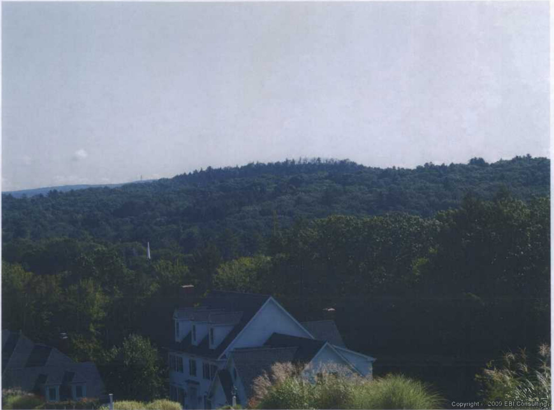
View 2 - Option 1