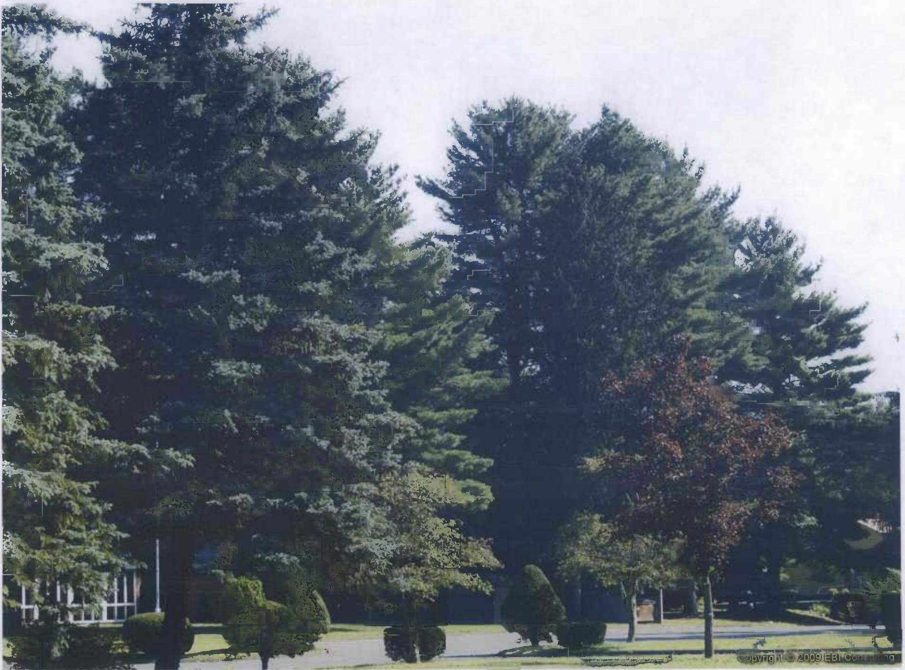
EXISTING CONDITIONS | LOOKING NORTHEAST FROM GREENWOOD DR.