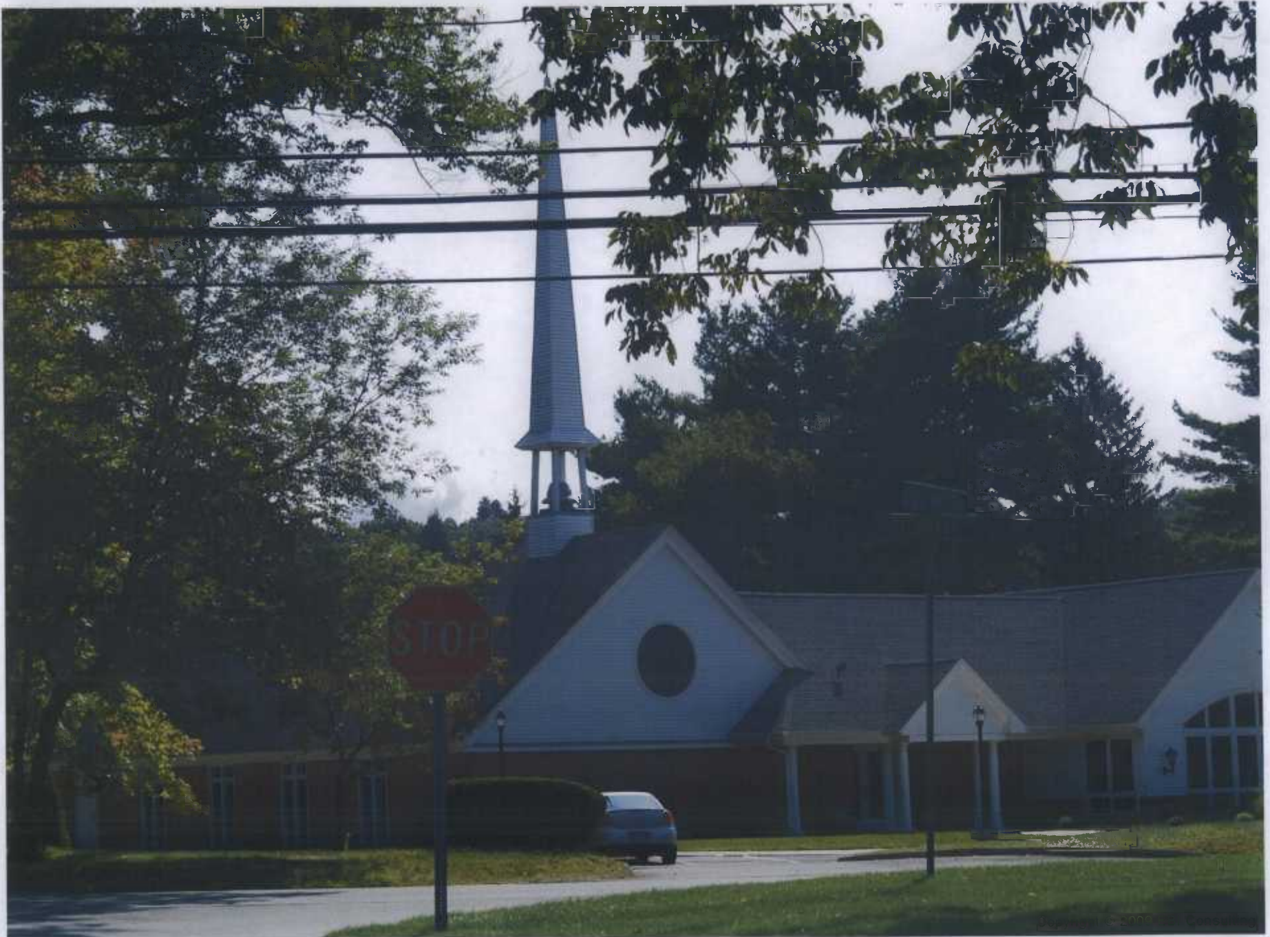
EXISTING CONDITIONS | LOOKING SOUTHEAST FROM CORNER OF BRIDGEWATER DR. & LOVELLY ST.