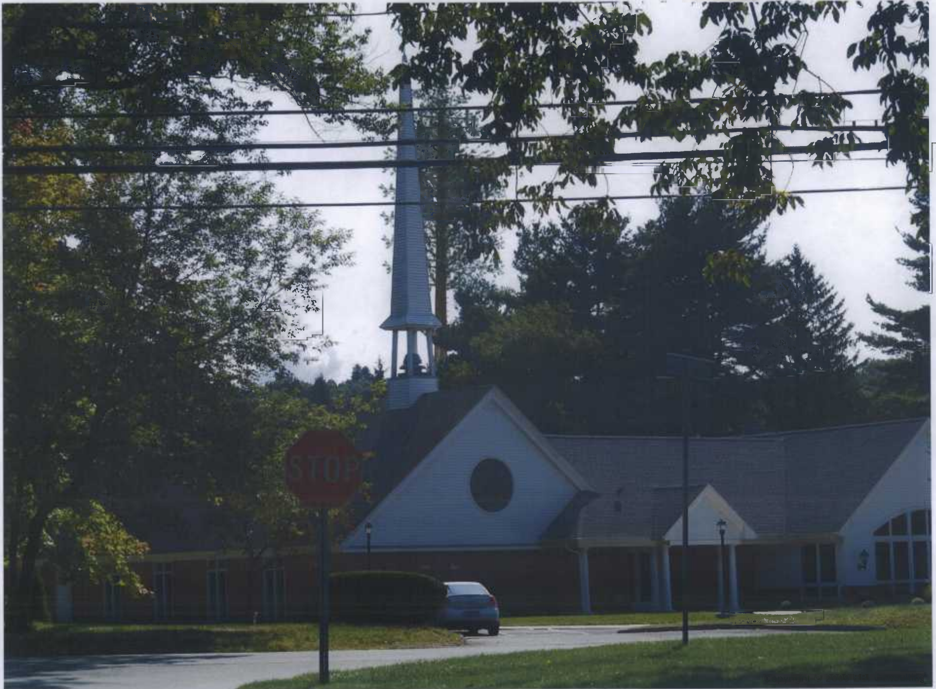
PROPOSED 100' MONOPINE | LOOKING SOUTHEAST FROM CORNER OF BRIDGEWATER DR. & LOVELY ST.