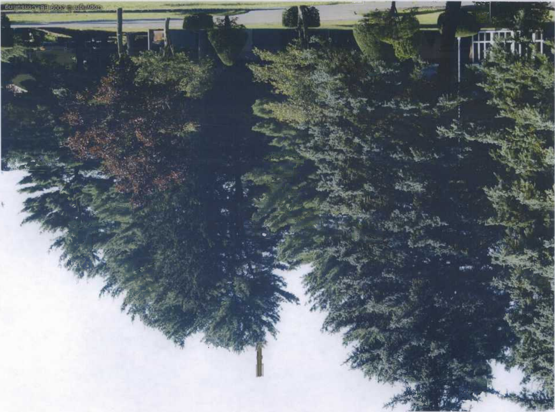
View (option 1) north