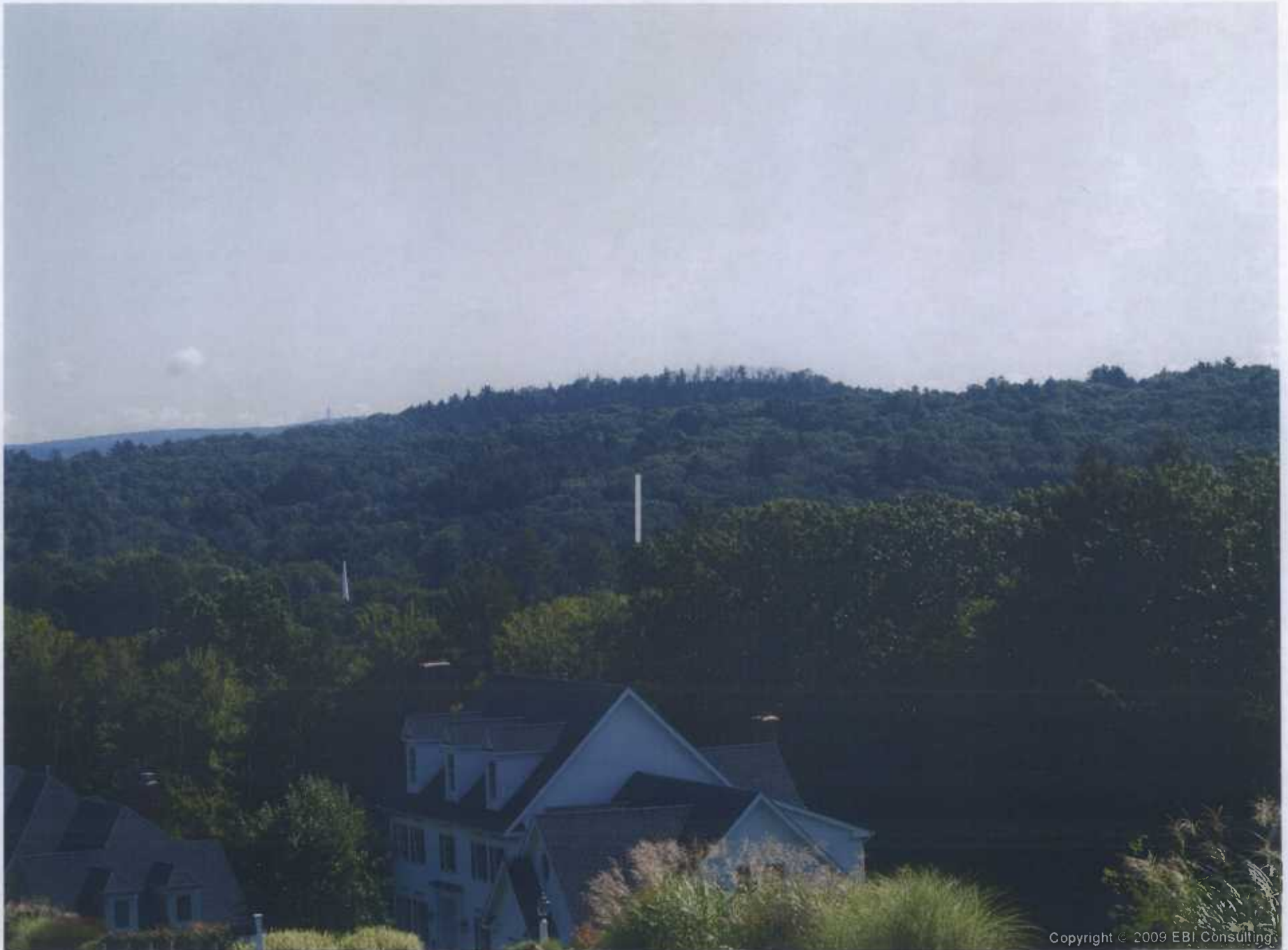
PROPOSED 100' FLAGPOLE | LOOKING NORTHEAST FROM BRIDGEWATER DR.