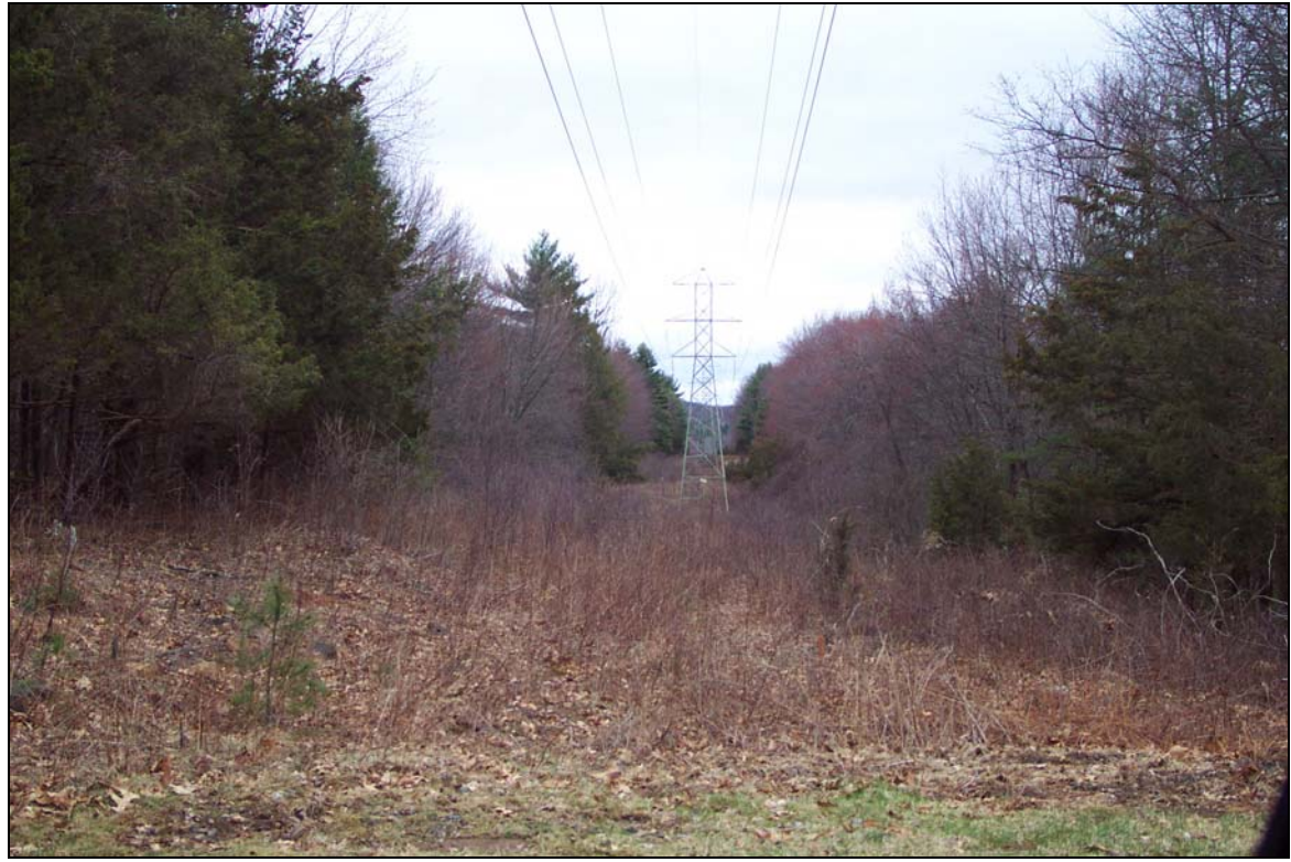
Photo 29: View of transmission line corridor facing south in Suffield, CT