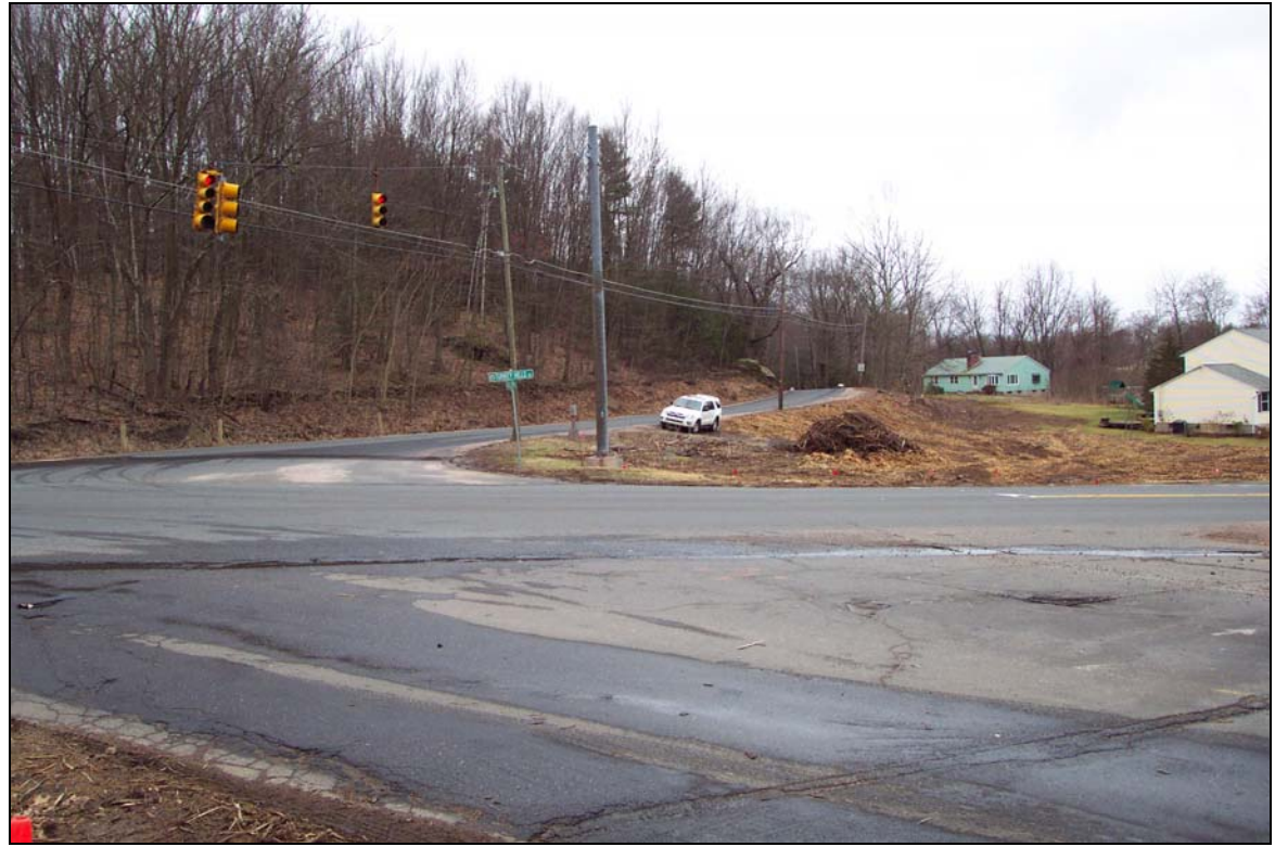
Photo 7: View south on Newgate Road at Turkey Hills Road in East Granby, CT