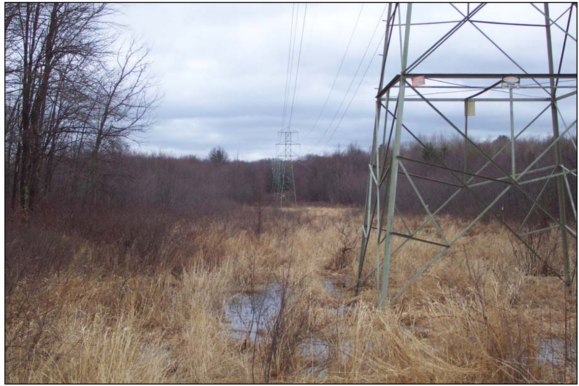
Photo 33: View of transmission line at Colson Road, facing south in Suffield, CT