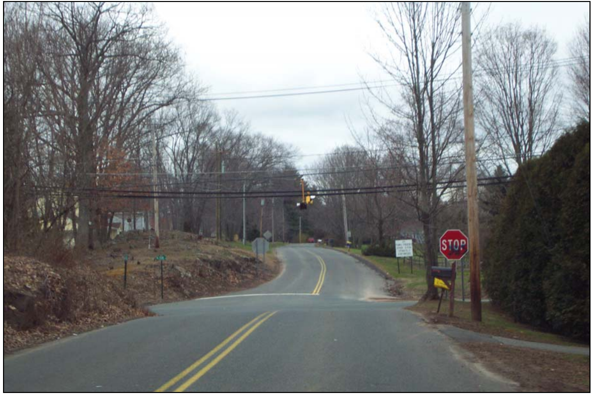
Photo 21: View north on South Stone Road at Mountain Road in Suffield, CT