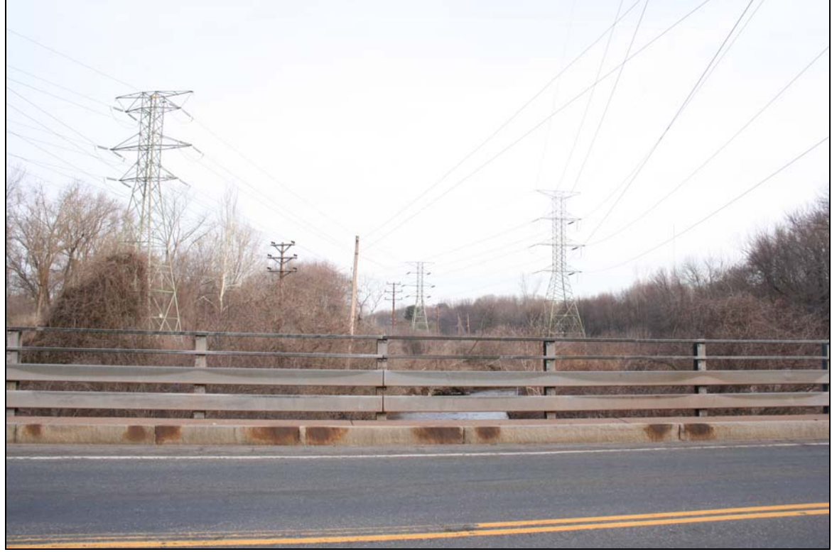
Photo 1: View northwest at transmission corridor from Olcott Street in Manchester, CT