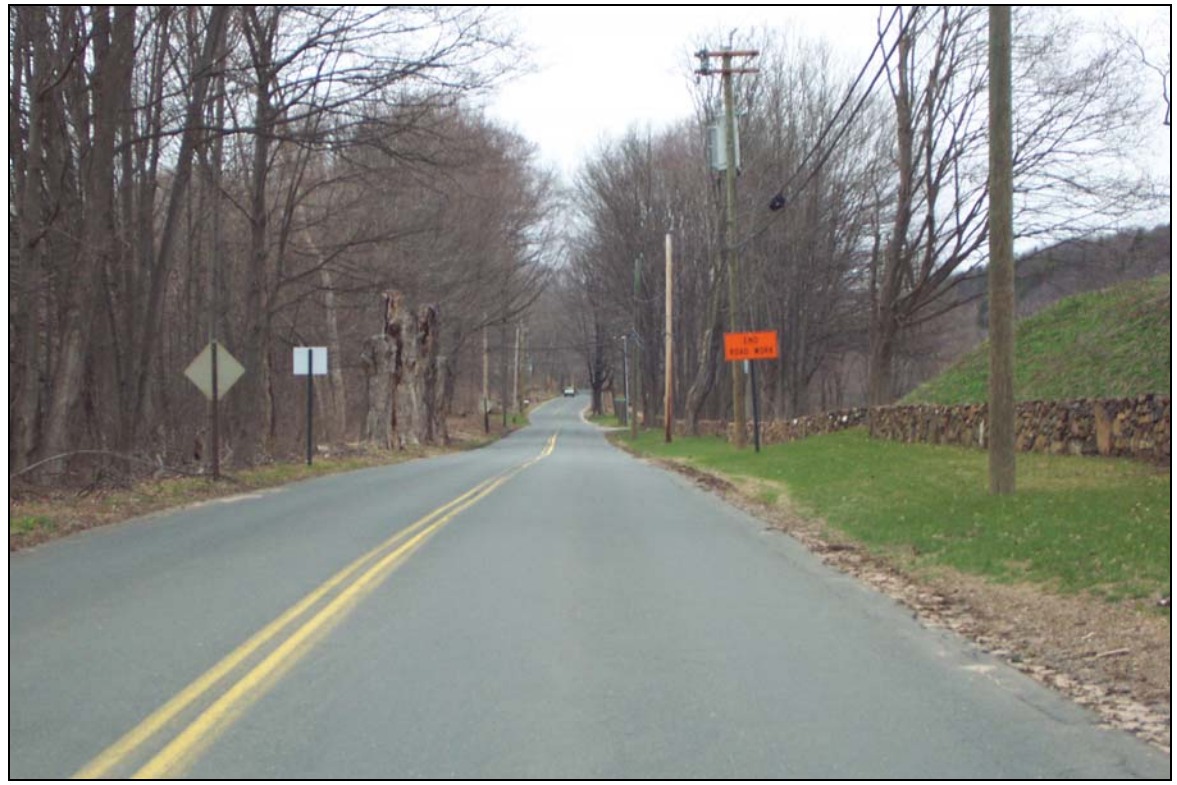
Photo 8: View north on Newgate Road at Old Road in East Granby, CT

Sheet 4 of 18 Greater Springfield Reliability Project State Route 168/187 Underground Line Route Variation / Newgate Road Underground Line Route Variation