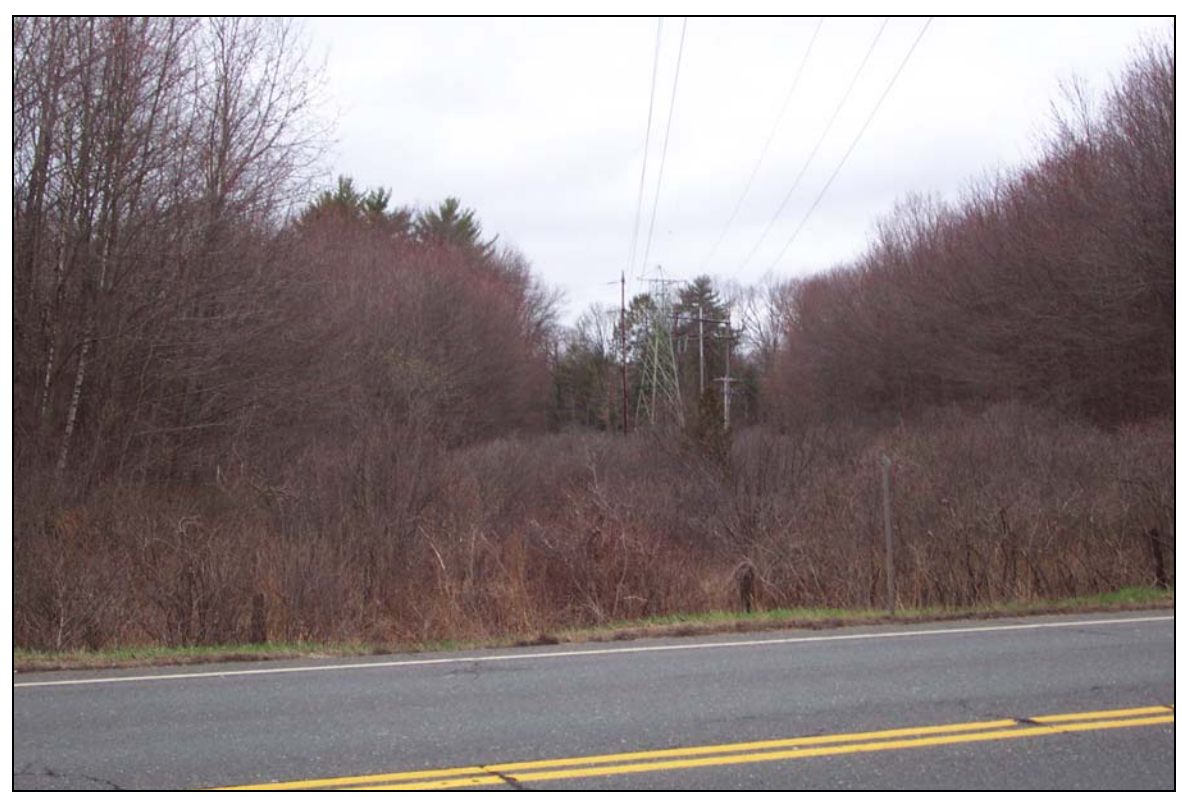
Photo 14: View south towards transmission line from Turkey Hills Road in East Granby, CT

Sheet 7 of 18 Greater Springfield Reliability Project Connecticut Portion of the North Bloomfield to Agawam Line Route / 3.6-Mile In-ROW Underground Line Route Variation / 4.6-Mile In-ROW Underground Line Route Variation / State Route 168/178 Underground Line Route Variation / Newgate Road Underground Line Route Variation