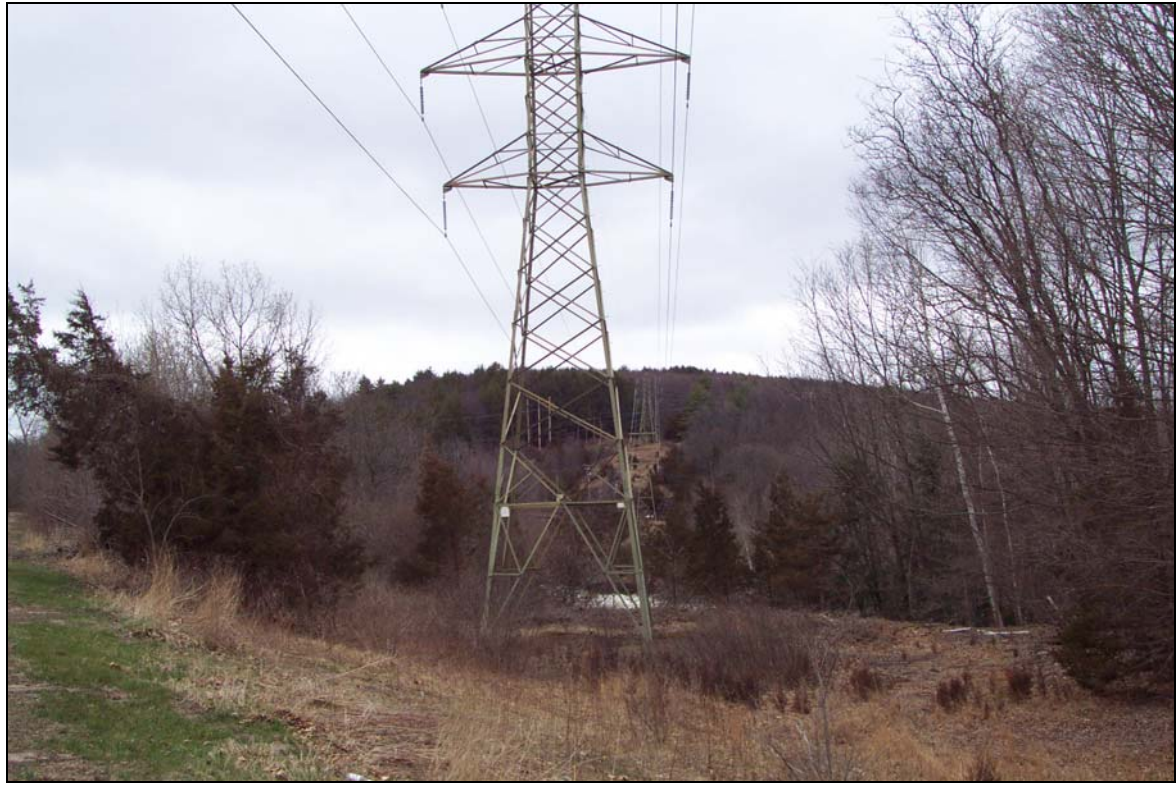
Photo 1: View north at transmission corridor from Route 189 in Bloomfield, CT