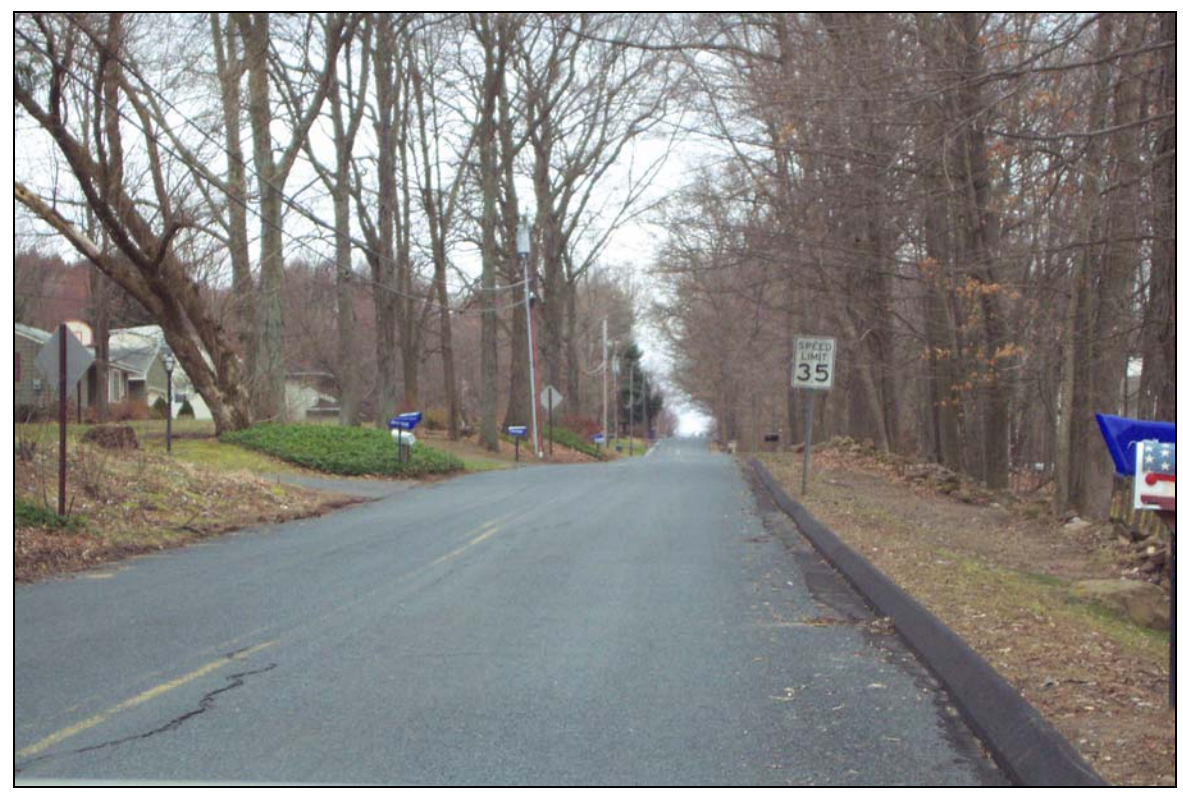
Photo 28: View west on Phelps Road at Newgate Road, in Suffield, CT

Sheet 14 of 18 Greater Springfield Reliability Project Connecticut Portion of the North Bloomfield to Agawam 345-kV Line Route / 4.6-Mile In-ROW Underground Line Route Variation / 3.6-Mile In-ROW Underground Line Route Variation / Newgate Road Underground Line Route Variation