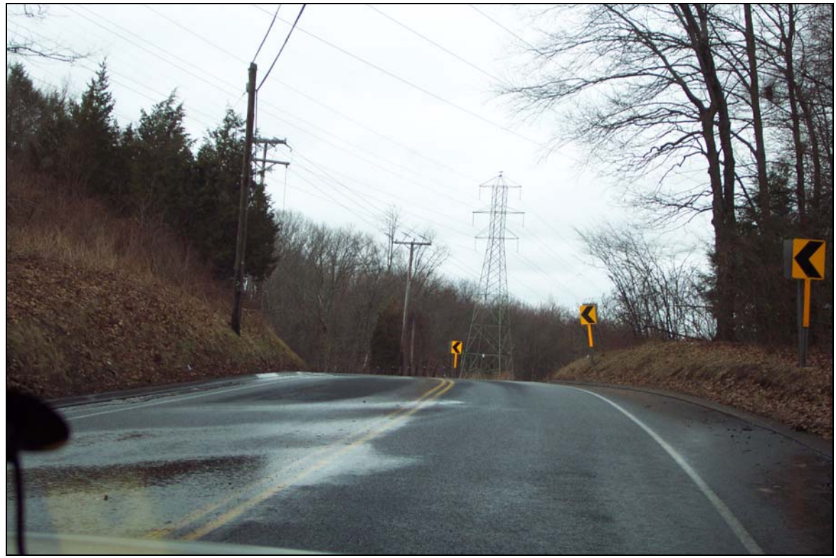
Photo 3: View southeast on Hatchet Hill Road at the transmission line in East Granby, CT