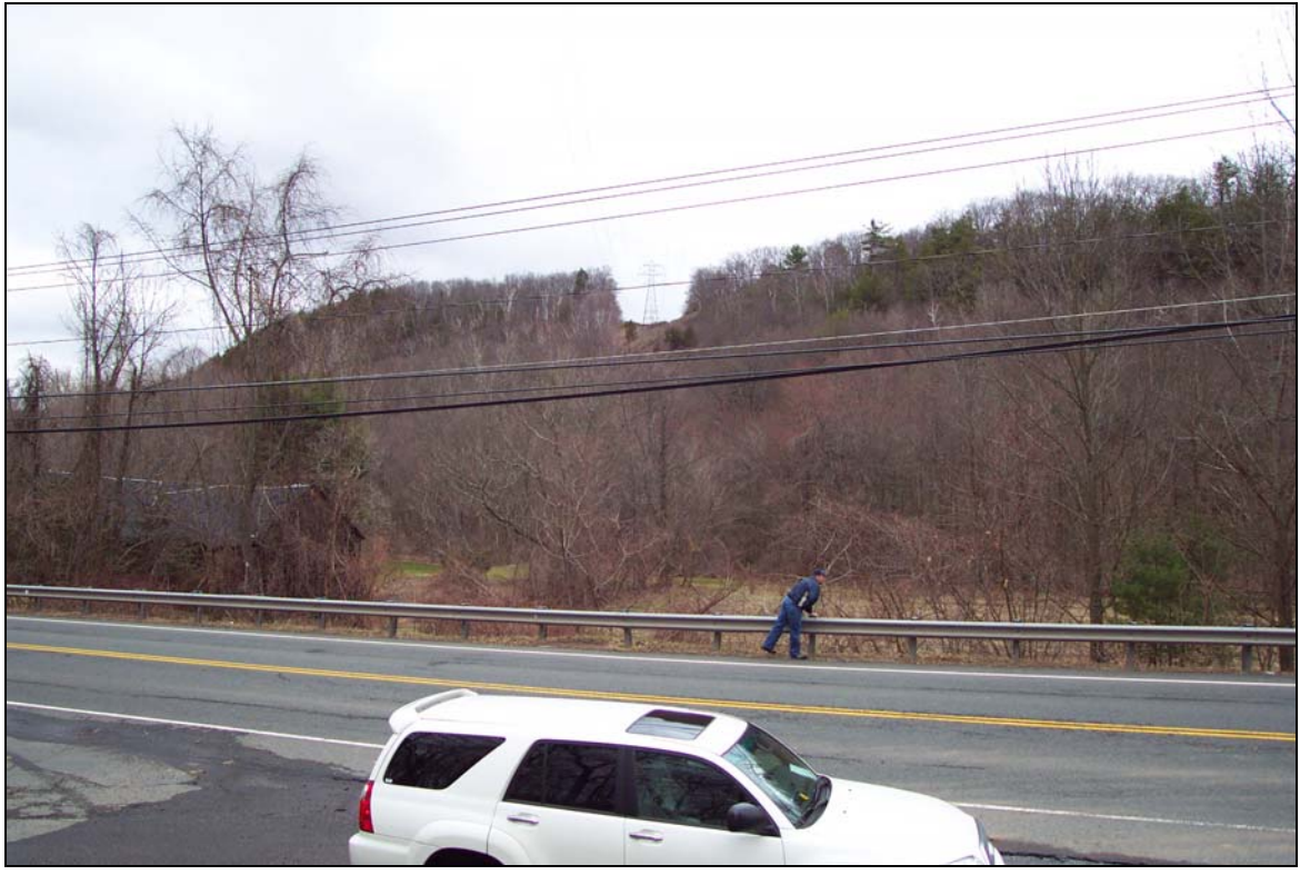
Photo 25: View northeast of transmission line from Mountain Road (Route 168) in Suffield, CT