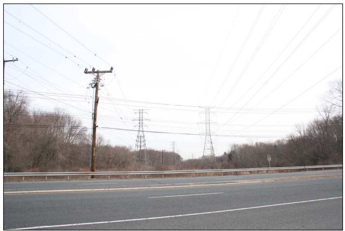
Photo 4: View northwest at transmission corridor near Middle Turnpike in Manchester, CT