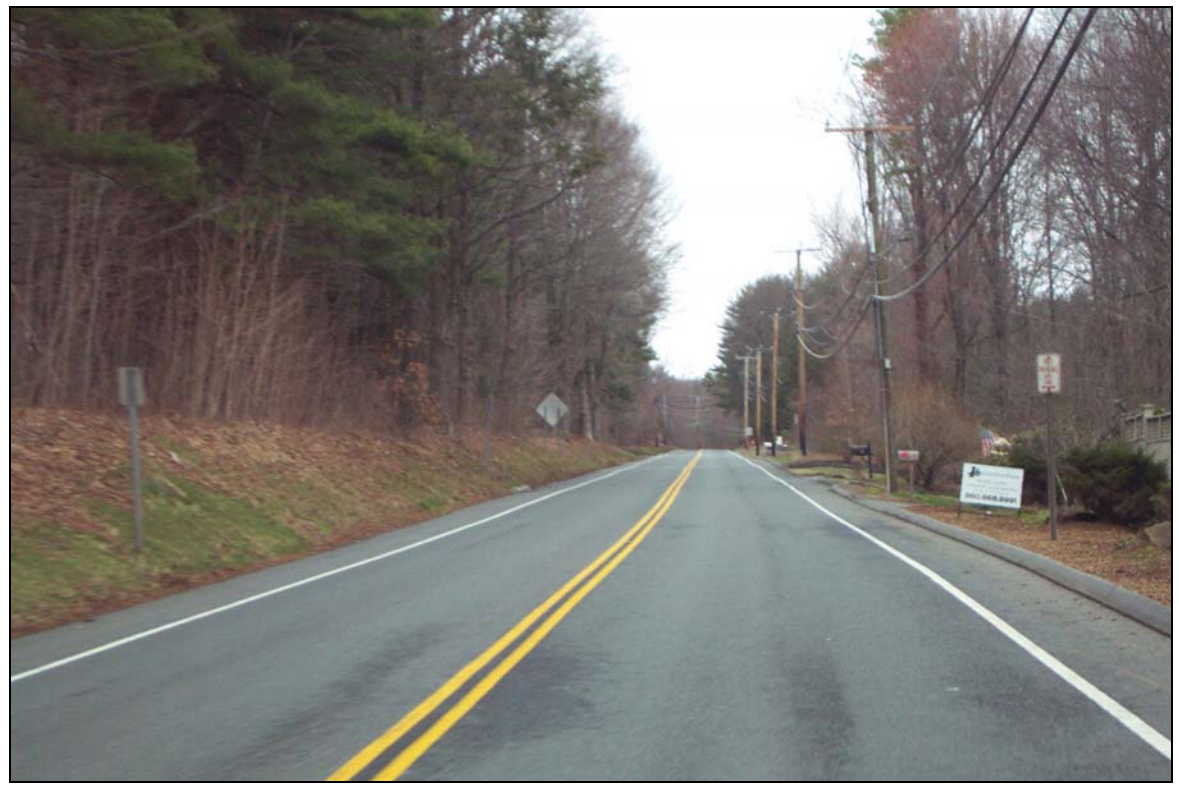
Photo 23: View northwest on Mountain Road (Route 168) in Suffield, CT