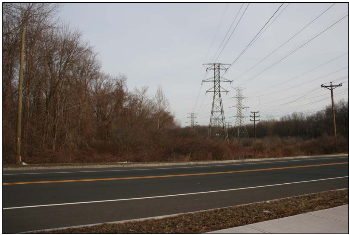
Photo 2: View north at transmission corridor from Olcott Street in Manchester, CT