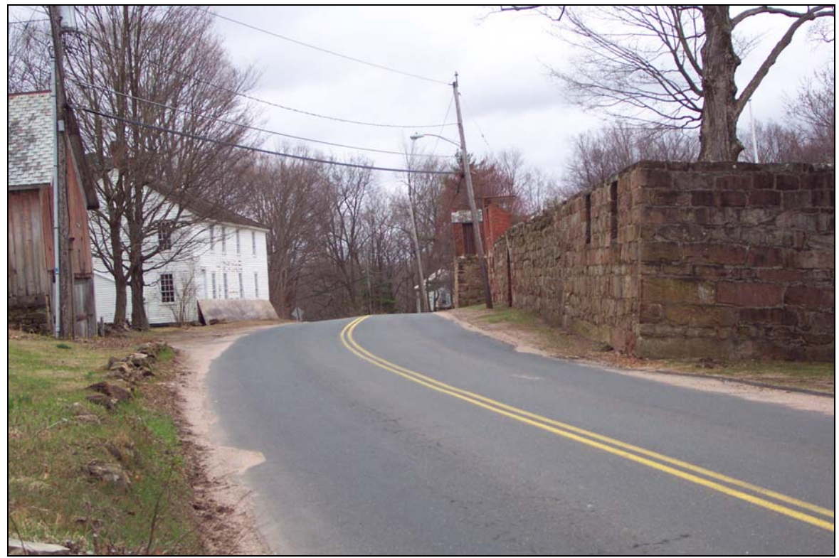
Photo 9: View south on Newgate Road at historic site, in East Granby, CT