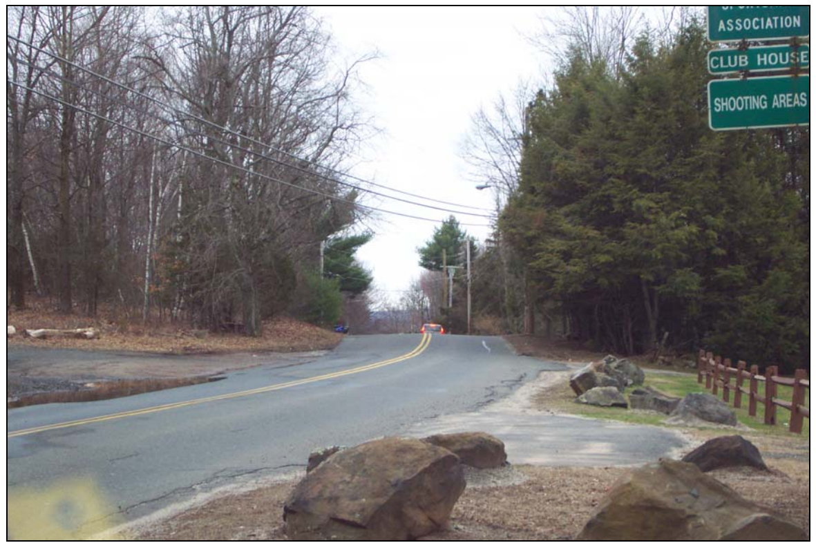
Photo 27: View southwest on Phelps Road from the transmission line in Suffield, CT