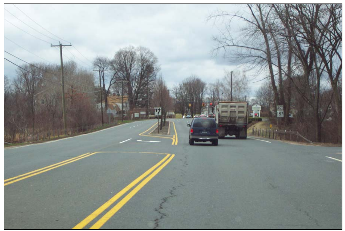
Photo 16: View east on Turkey Hills Road at Route 187 in East Granby, CT

Sheet 8 of 18 Greater Springfield Reliability Project State Route 168/187 Underground Line Route Variation / Newgate Road Underground Line Route Variation