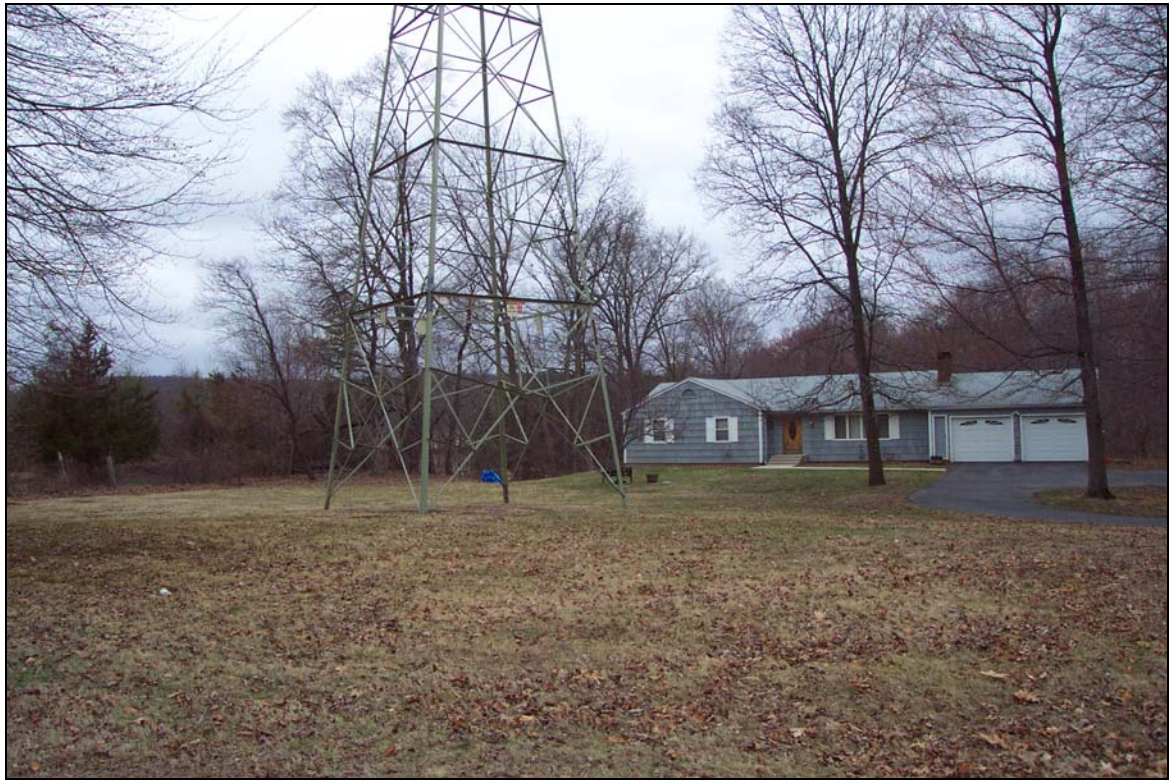
Photo 35: View west on Ratley Road at transmission line corridor in Suffield, CT