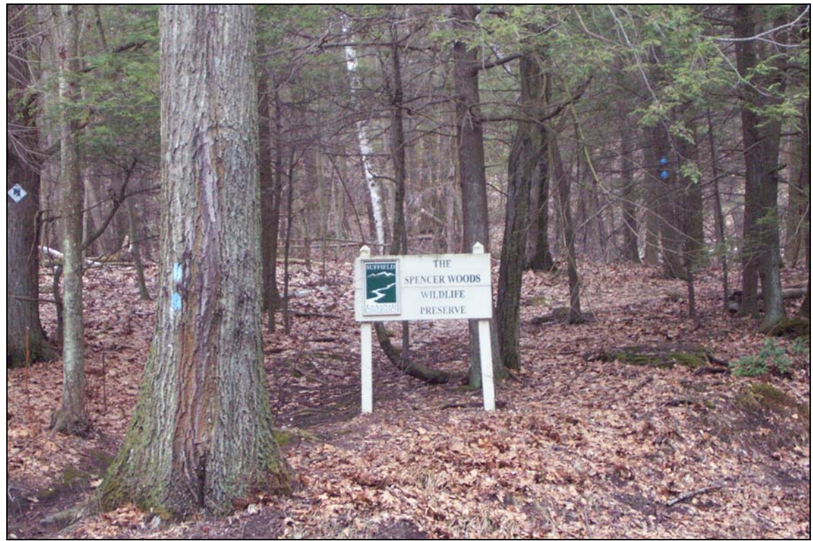
Photo 26: View west on Phelps Road of the Spencer Woods Wildlife Preserve in Suffield, CT

Sheet 13 of 18 Greater Springfield Reliability Project Connecticut Portion of the North Bloomfield to Agawam 345-kV Line Route / State Route Underground Line Route Variation