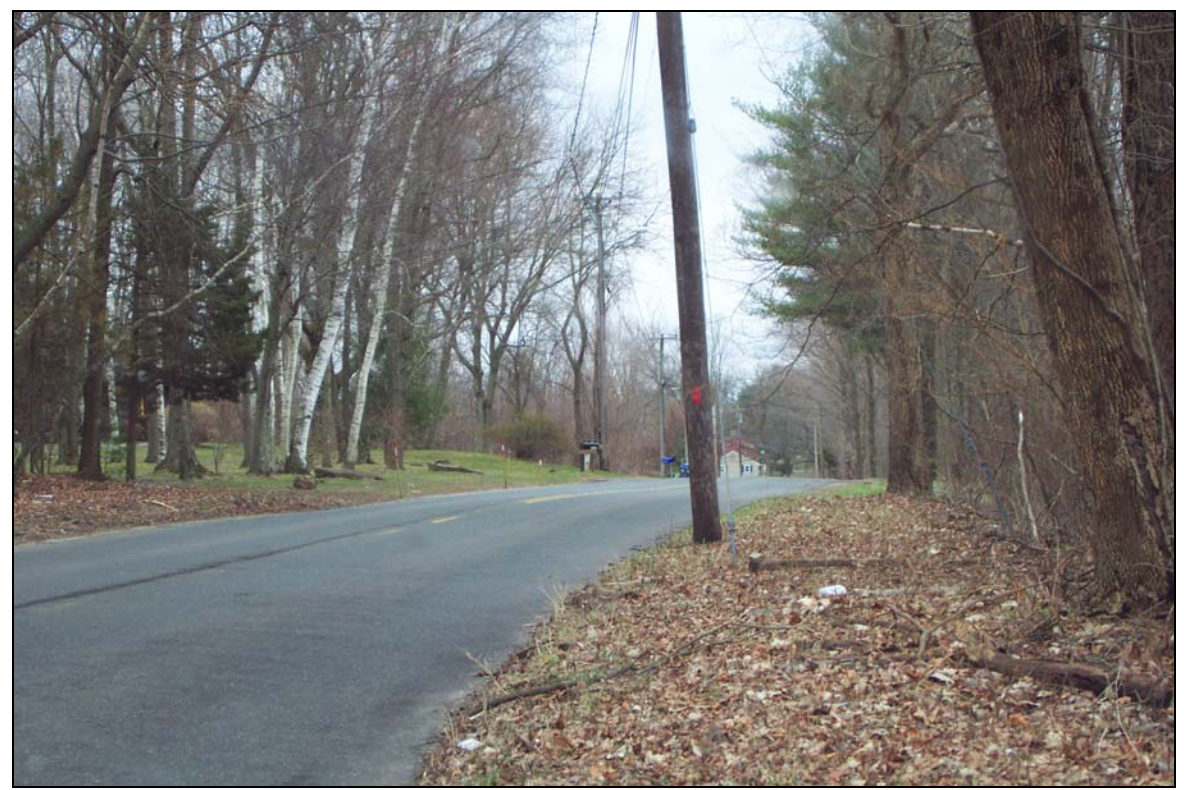
Photo 32: View south on Stone Street at transmission line corridor in Suffield, CT

Sheet 16 of 18 Greater Springfield Reliability Project Connecticut Portion of the North Bloomfield to Agawam 345-kV Line Route / 4.6-Mile In-ROW Underground Line Route Variation / 3.6-Mile In-ROW Underground Line Route Variation /