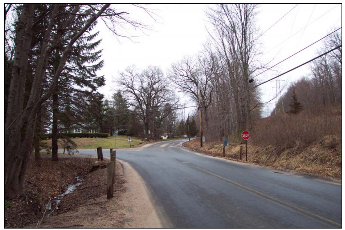
Photo 10: View north on Newgate Road at Copper Hills Road, in East Granby, CT

Sheet 5 of 18 Greater Springfield Reliability Project Newgate Road Underground Line Route Variation / Connecticut Portion of the North Bloomfield to Agawam 345-kV Line Route / 3.6-Mile In-ROW Underground Line Route Variation / 4.6-Mile In-ROW Underground Line Route Variation