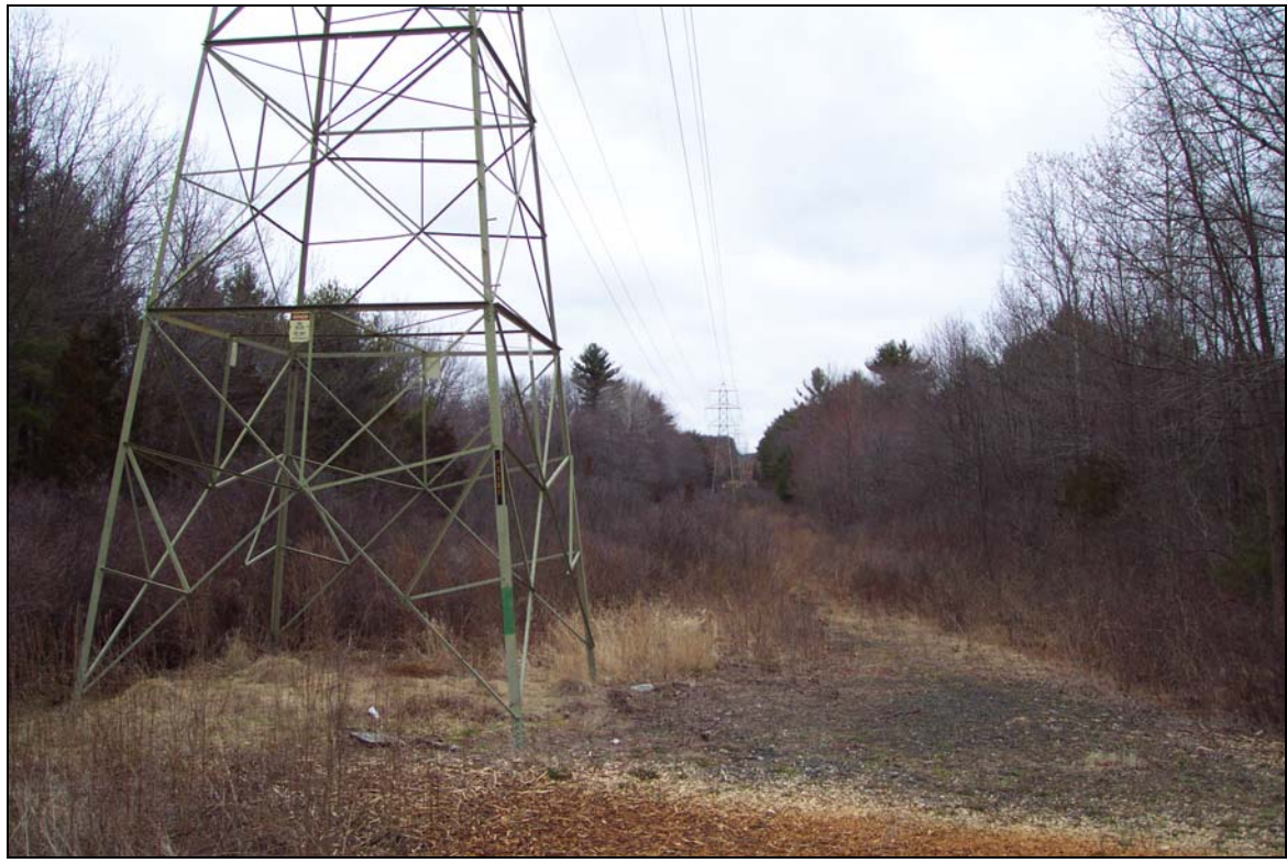
Photo 13: View north towards transmission line from Turkey Hills Road in East Granby, CT