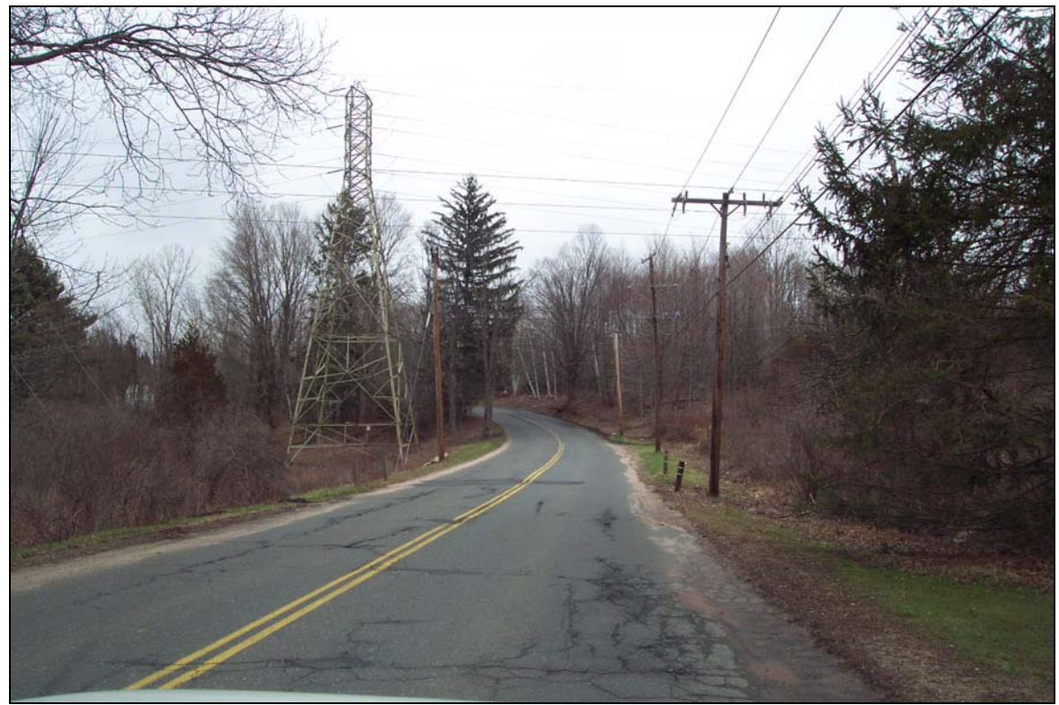
Photo 5: View east on Hatchet Hill Road at the transmission line in East Granby, CT