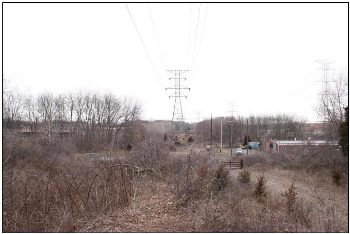
Photo 6: View north on the transmission line corridor near Tolland Turnpike in Manchester, CT