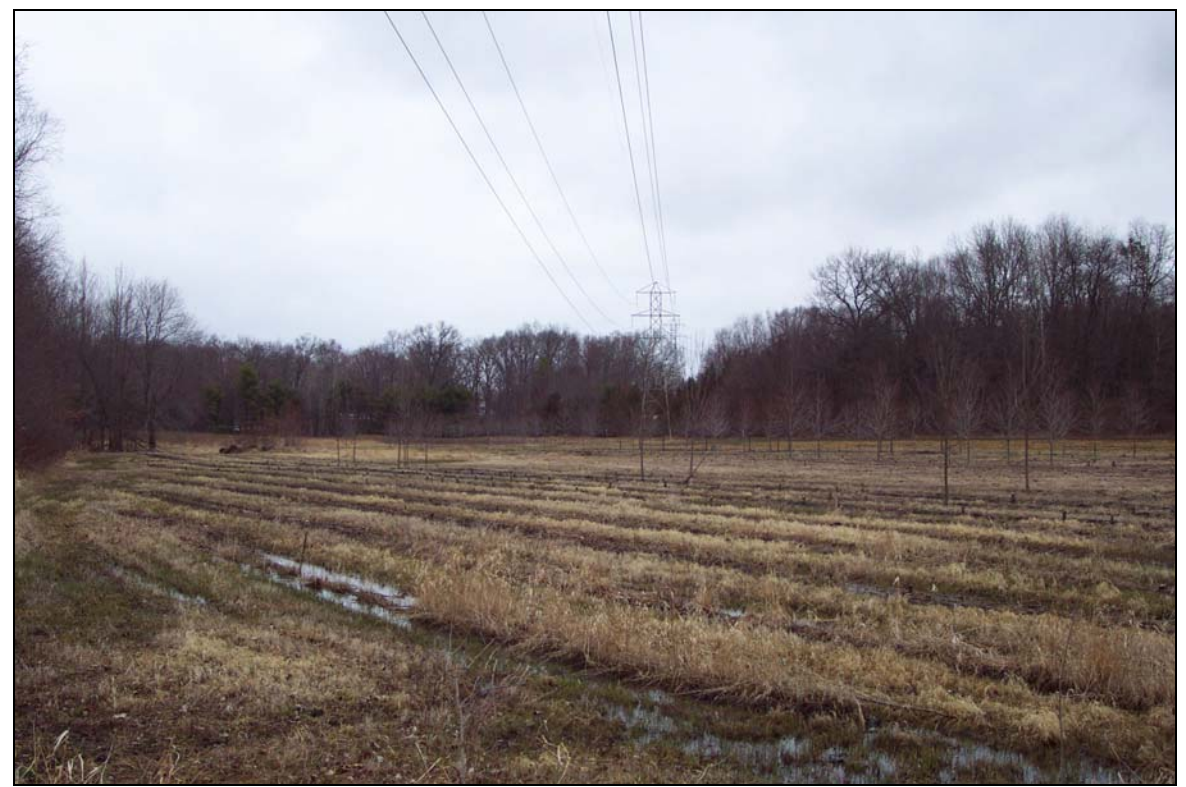
Photo 34: View of transmission line at Colson Road, facing north in Suffield, CT

Sheet 17 of 18 Greater Springfield Reliability Project Connecticut Portion of the North Bloomfield to Agawam 345-kV Line Route /