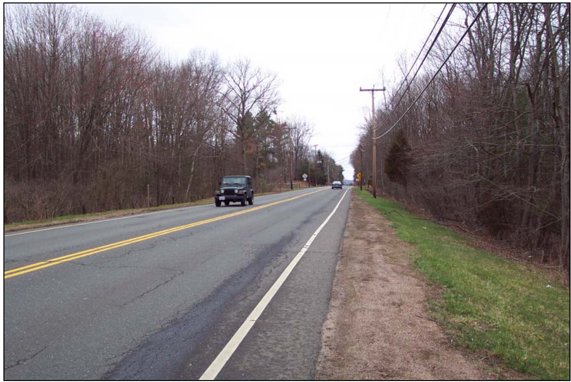
Photo 15: View east on Turkey Hills Road at transmission line in East Granby, CT