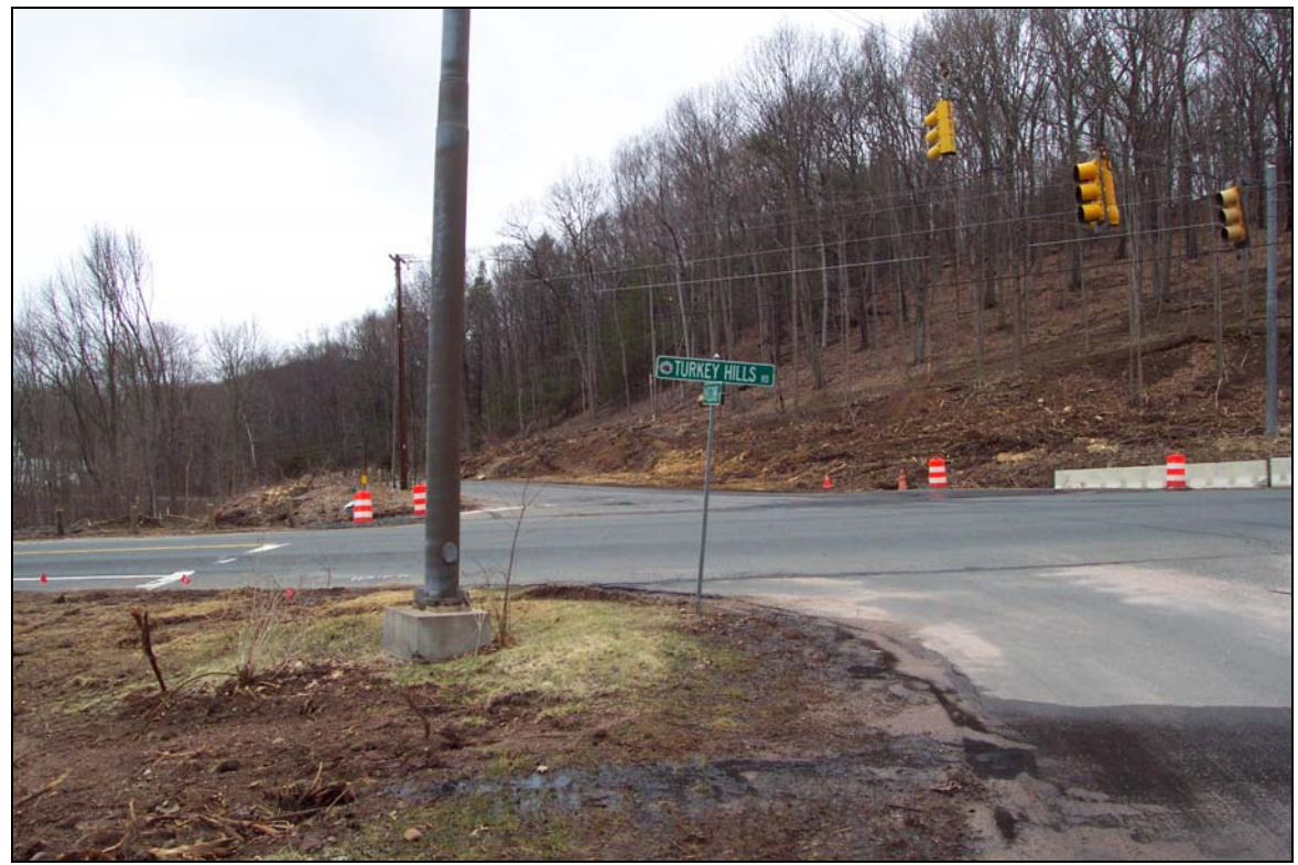
Photo 6: View north on Newgate Road at Turkey Hills Road in East Granby, CT

Sheet 3 of 18 Greater Springfield Reliability Project Connecticut Portion of the North Bloomfield to Agawam 345-kV Line Route / State Route 168/187 Underground Line Route Variation