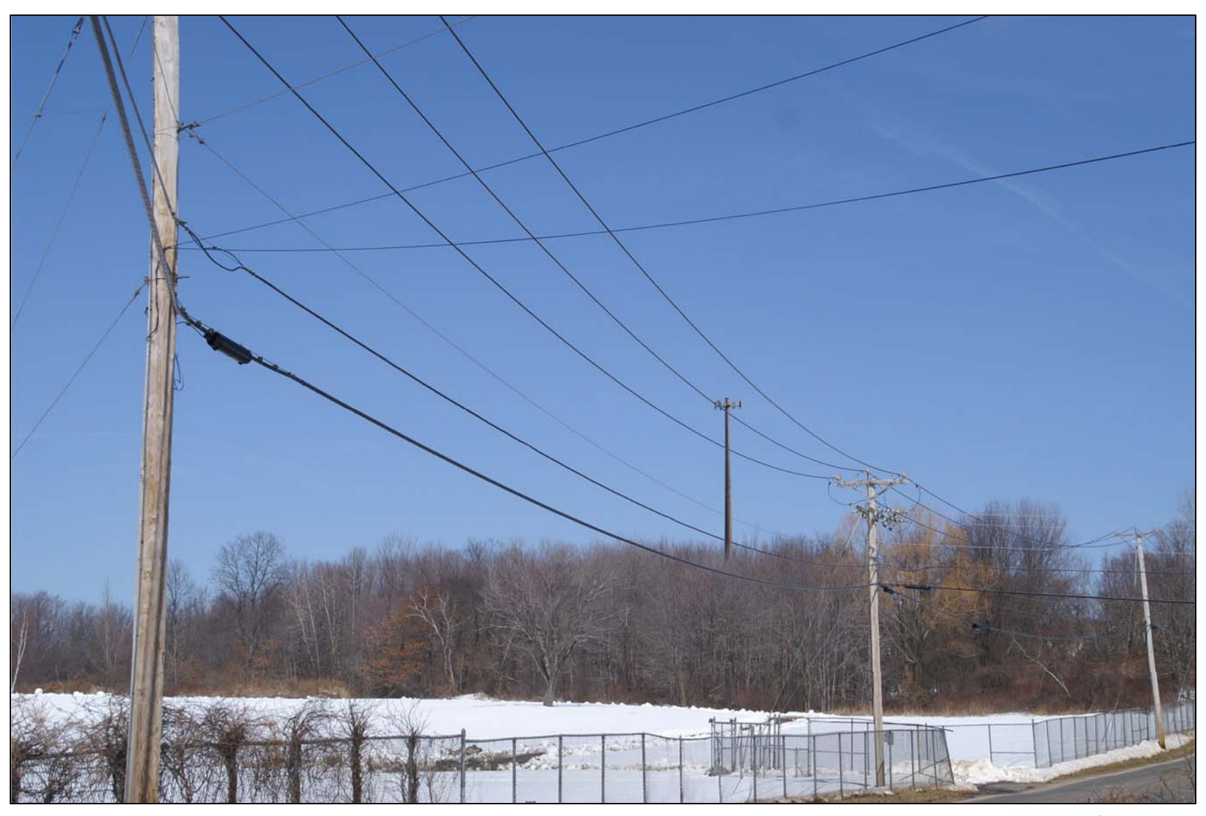
Photo Simulation 2 - View from Peck Road, between Barnum Road and Pembroke Road, looking northeast. Distance to site is approximately 0.15 mile. Winter condition. Monopole is shown with one array of antennas.