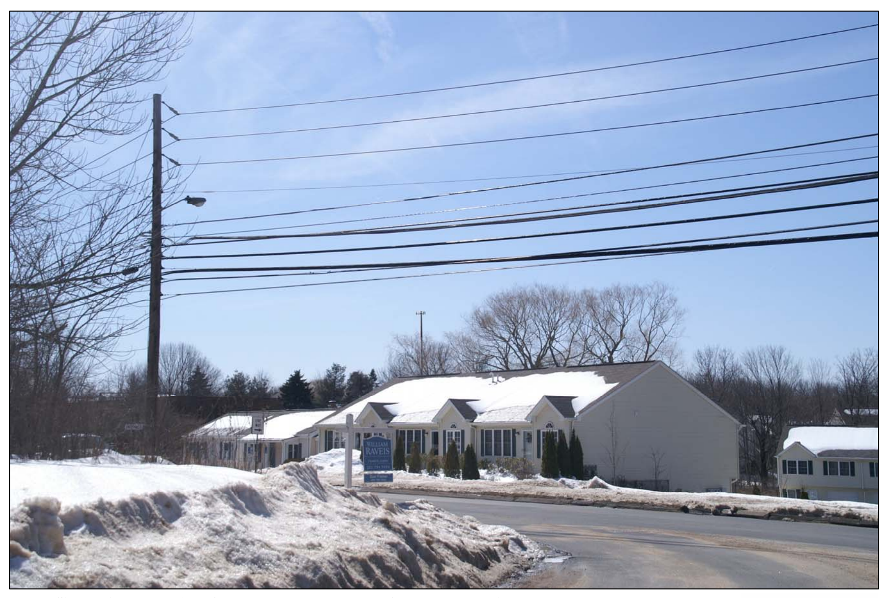
Photo Simulation 7 – View from the north corner of Bear Mountain Road and Pembroke Road, looking southwest. Distance to site is approximately 0.25 mile. Winter condition. Monopole is shown with one array of antennas.