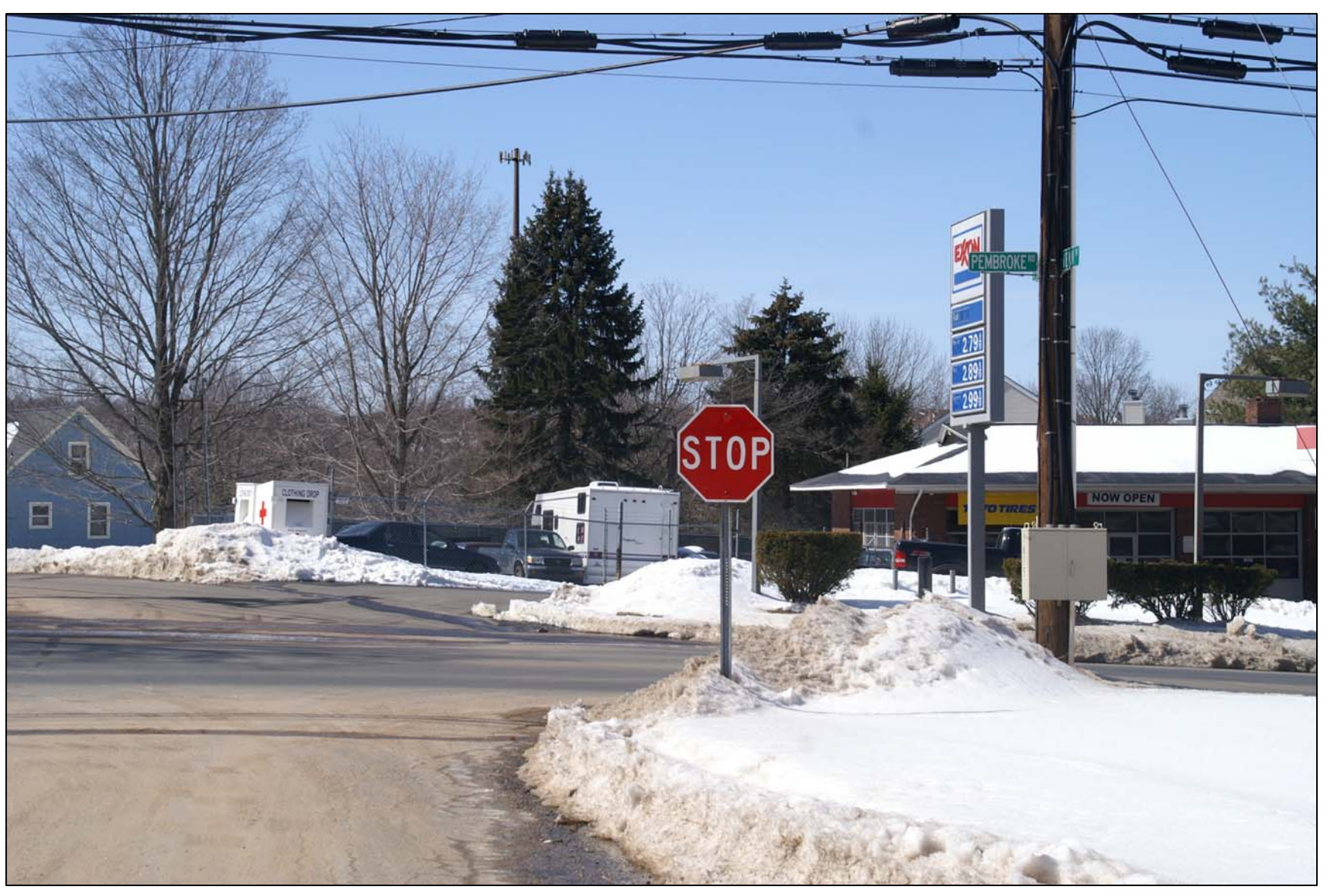
Photo Simulation 6 – View from the north corner of Kevin Drive and Pembroke Road, looking northwest. Distance to site is approximately 0.11 mile. Winter condition. Monopole is shown with one array of antennas.