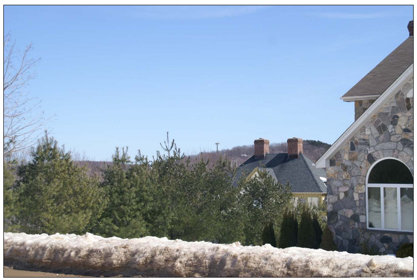
Photo Simulation 5 - View from Society Hill Road, looking east. Distance to site is approximately 0.41 mile. Winter condition. Monopole is shown with one array of antennas.