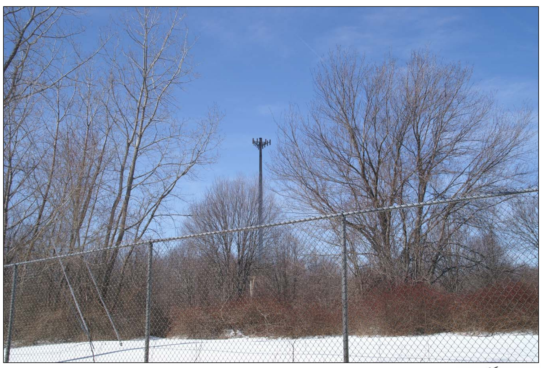
Photo Simulation 1 – View from Peck Road, between Pembroke Road and Barnum Road, looking northwest. Distance to site is approximately 0.05 mile. Winter condition. Monopole is shown with one array of antennas.