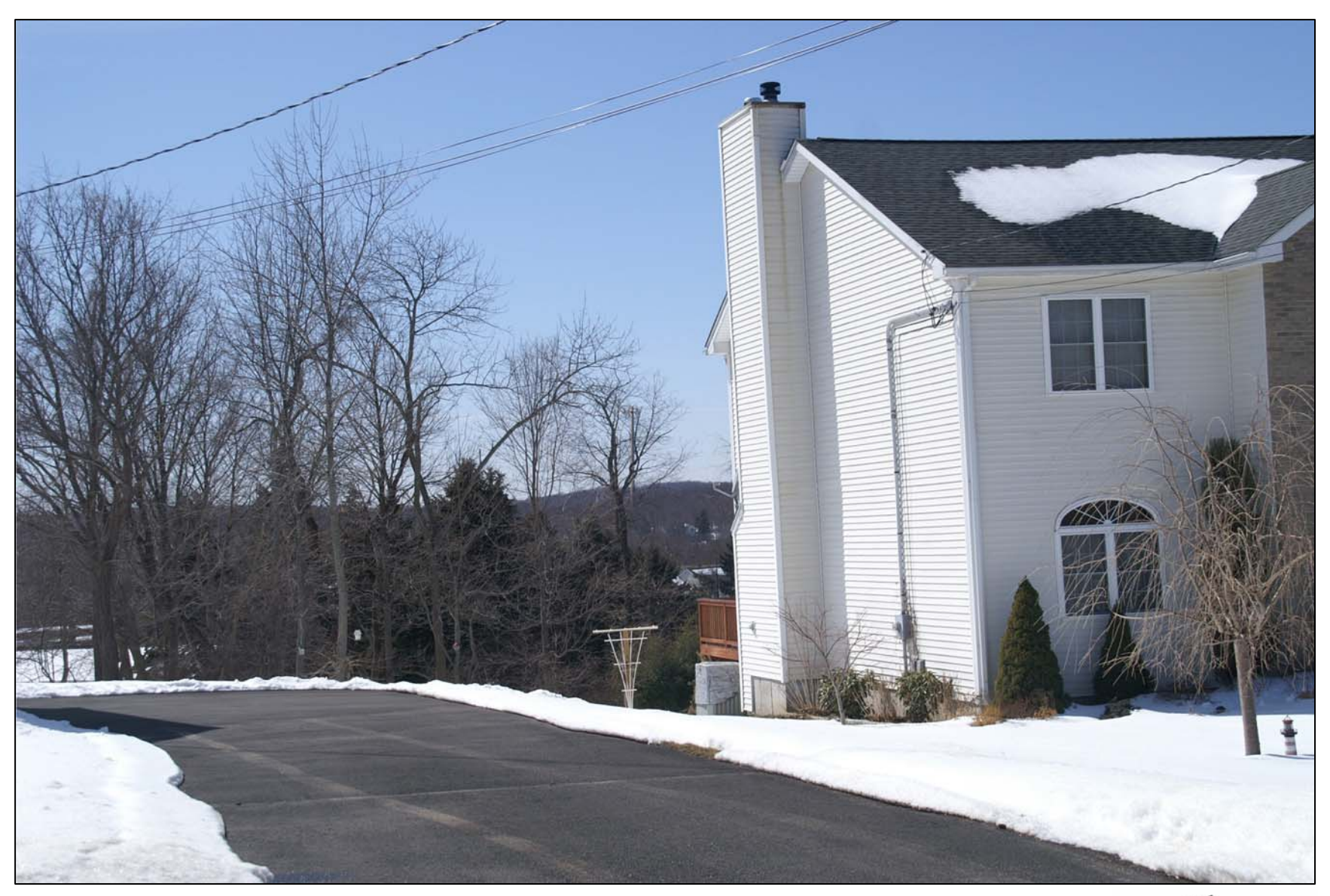
Photo Simulation 8 – View from Hollandale Road, looking southwest. Distance to site is approximately 0.23 mile. Winter condition. Monopole is shown with one array of antennas.