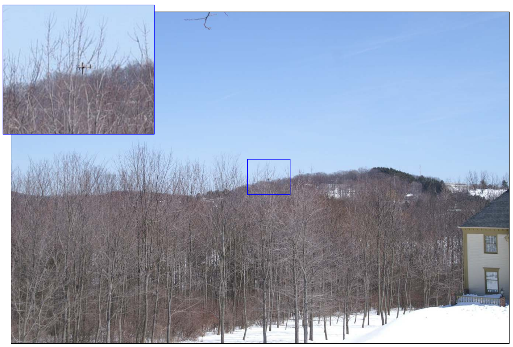
Photo Simulation 4 – View from Society Hill Road, between Barnum Road and Huntington Drive, looking east. Distance to site is approximately 0.43 mile. Winter condition. Monopole is shown with one array of antennas.