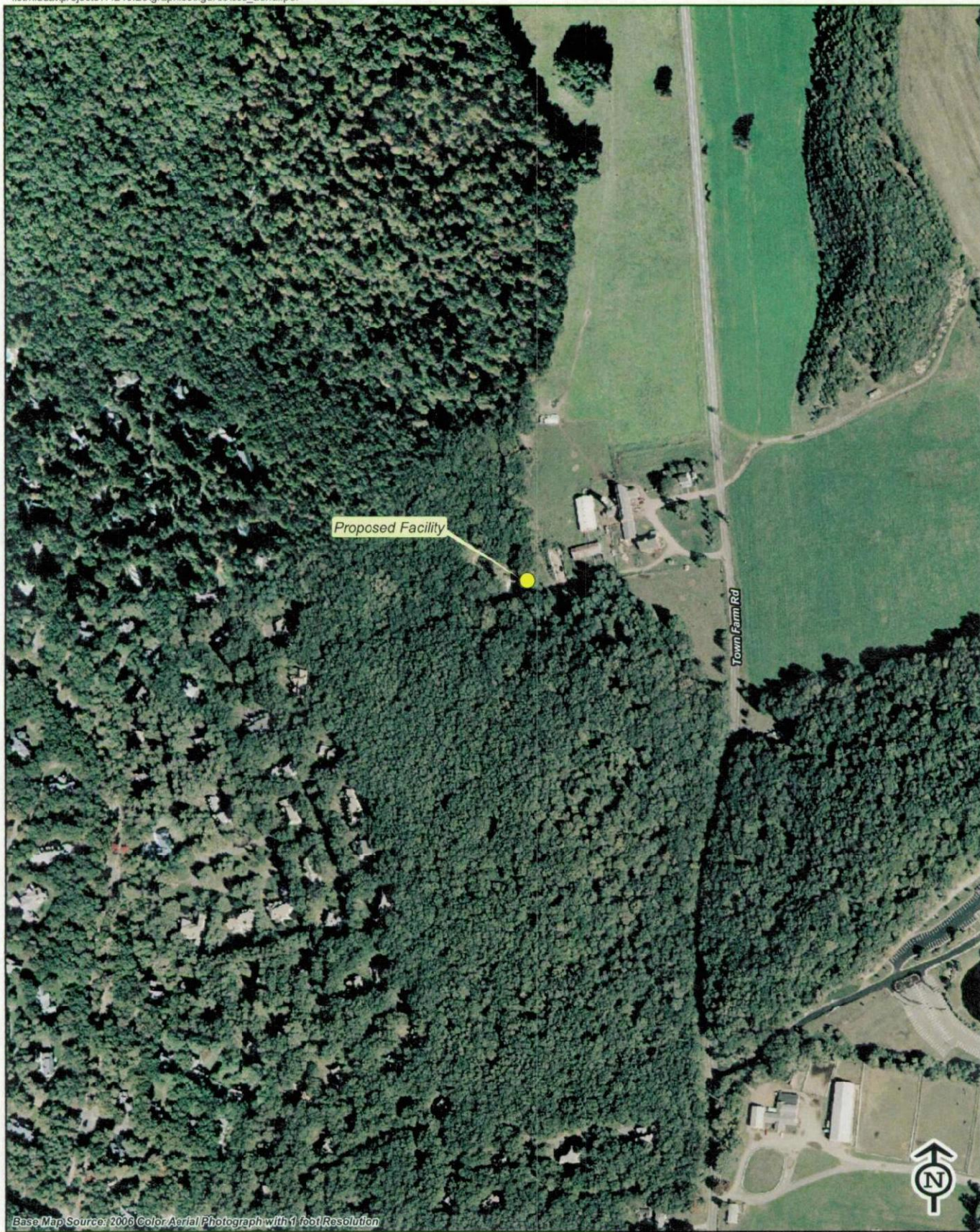
Base Map Source: 2006 Color Aerial Photograph with 1 foot Resolution