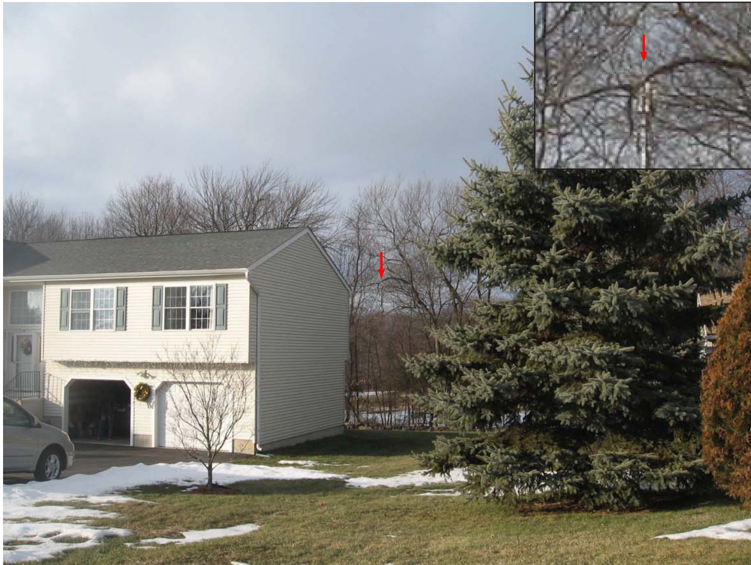
Photosim for conceptual purposes only - actual antenna and equipment locations to be determined based on final engineering design