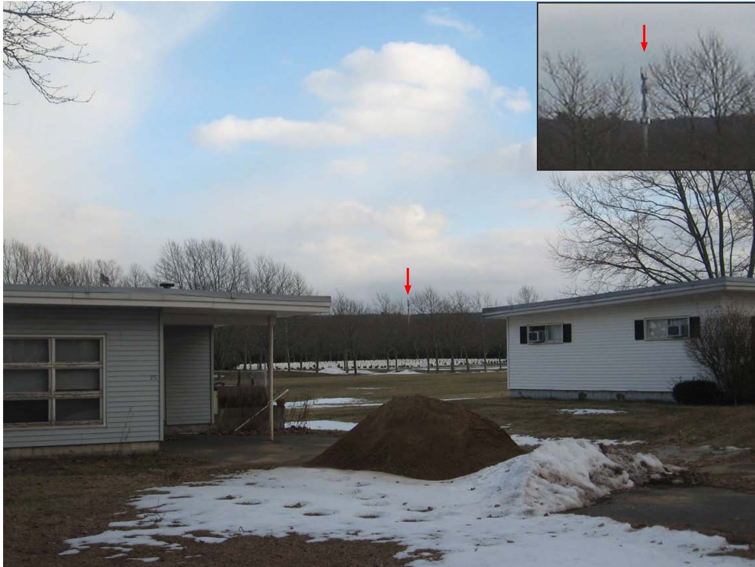
Photosim for conceptual purposes only - actual antenna and equipment locations to be determined based on final engineering design