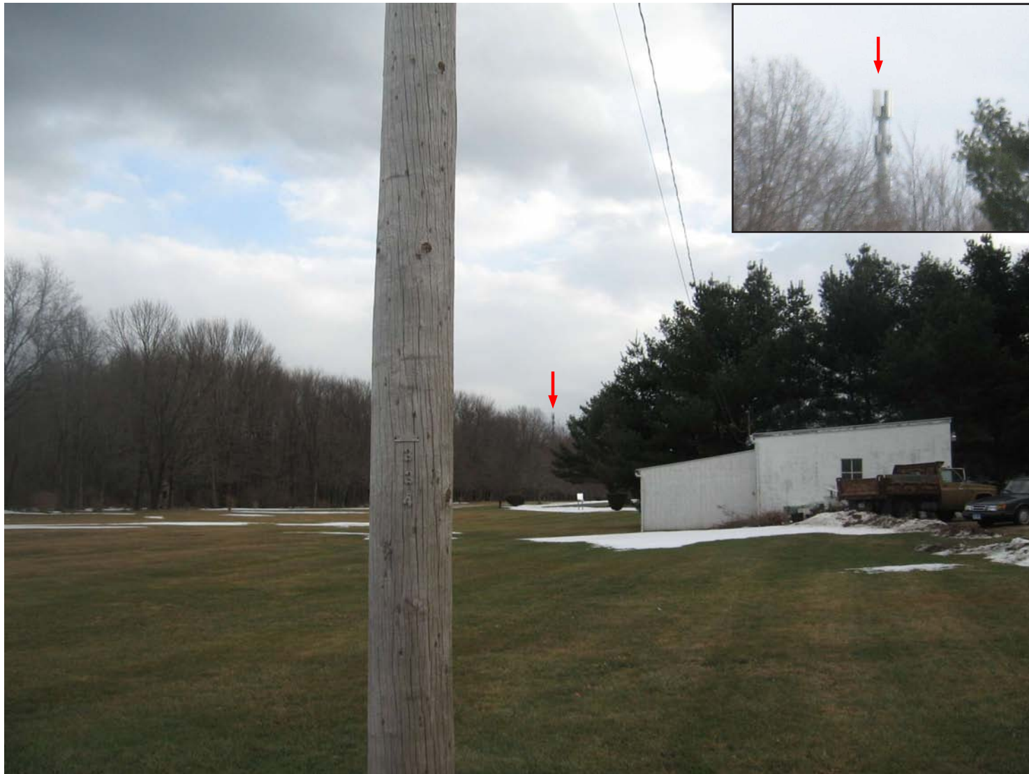
Photosim for conceptual purposes only - actual antenna and equipment locations to be determined based on final engineering design