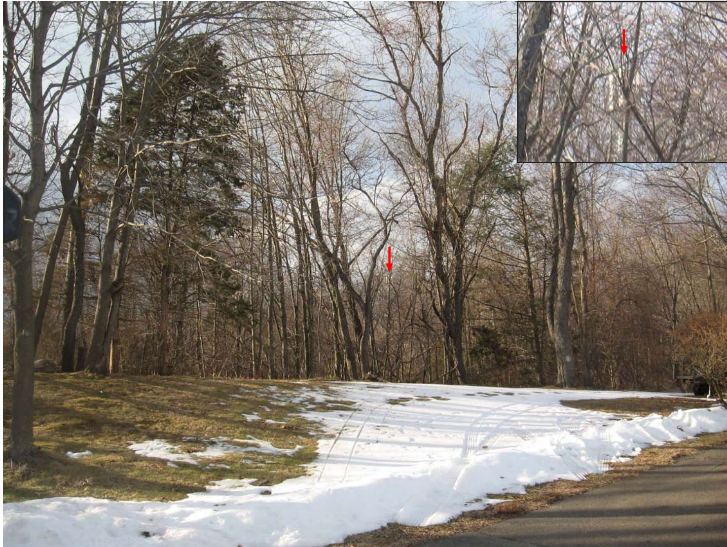
Photosim for conceptual purposes only - actual antenna and equipment locations to be determined based on final engineering design