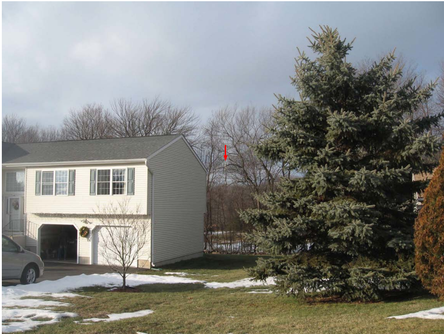
Photosim for conceptual purposes only - actual antenna and equipment locations to be determined based on final engineering design