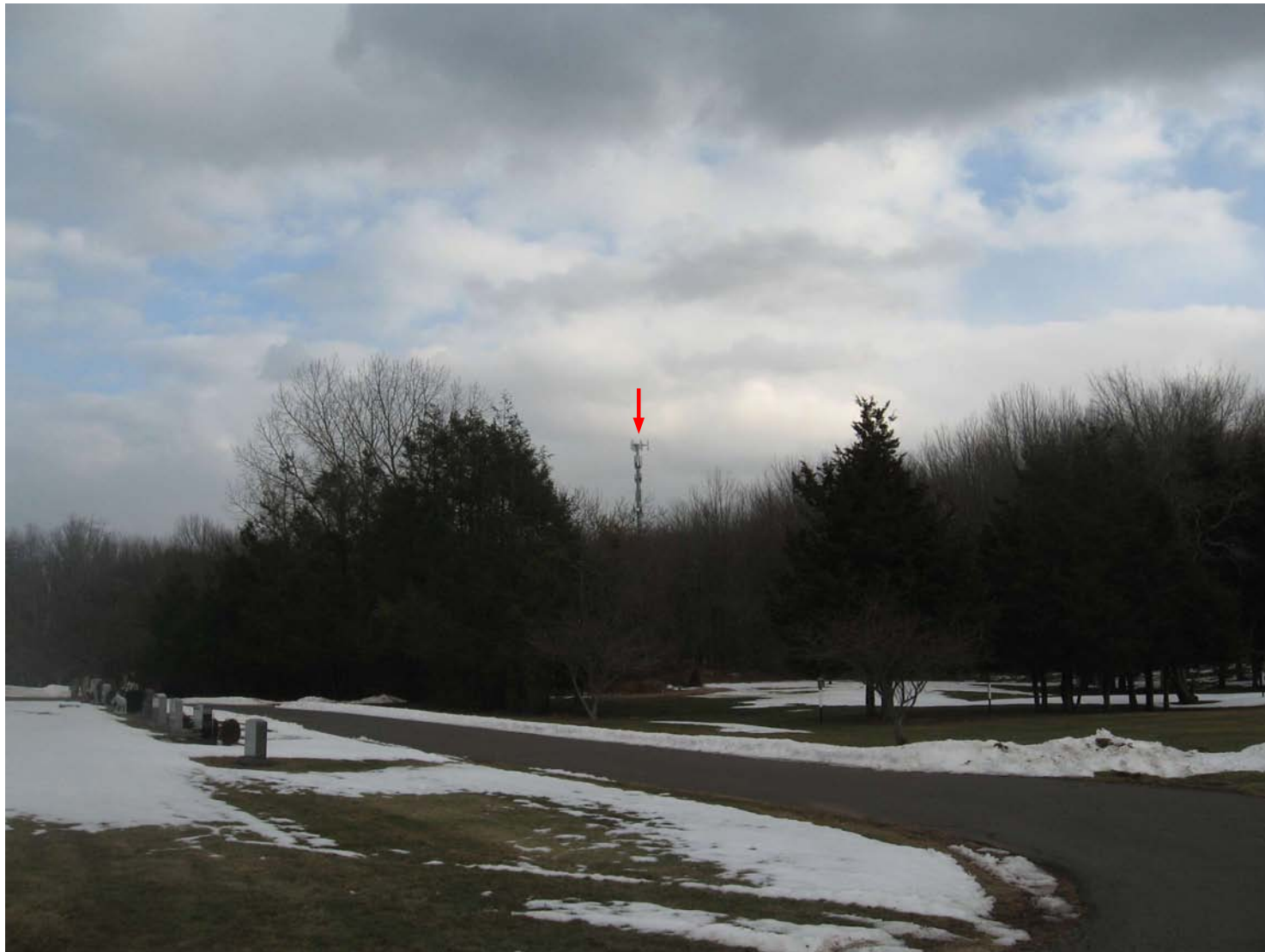
Photosim for conceptual purposes only - actual antenna and equipment locations to be determined based on final engineering design