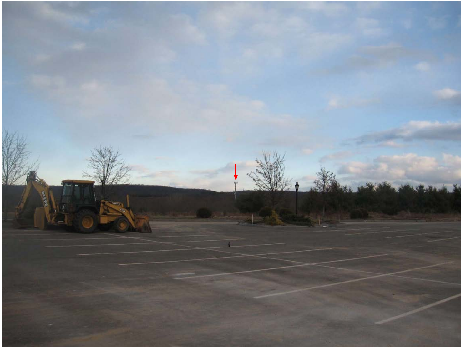
Photosim for conceptual purposes only - actual antenna and equipment locations to be determined based on final engineering design