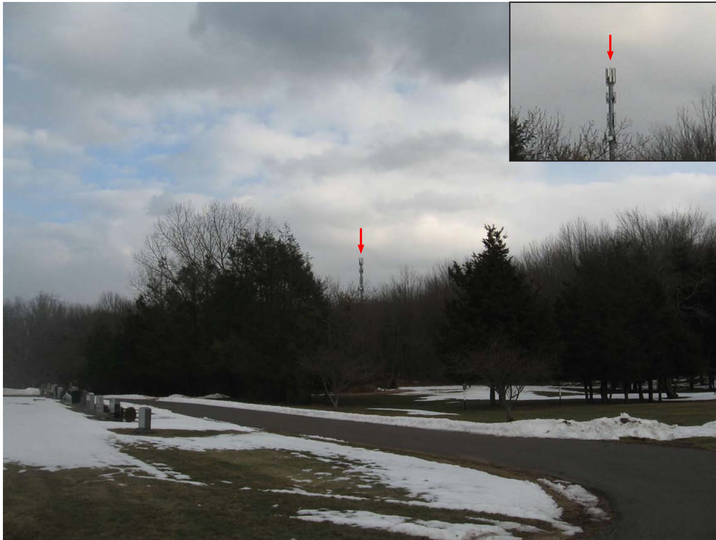
Photosim for conceptual purposes only - actual antenna and equipment locations to be determined based on final engineering design