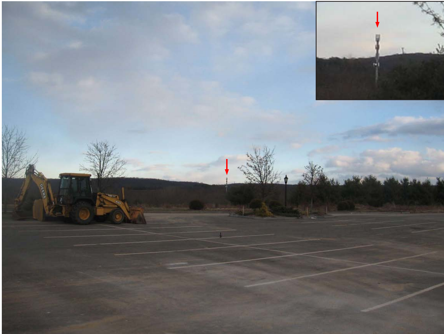
Photosim for conceptual purposes only - actual antenna and equipment locations to be determined based on final engineering design