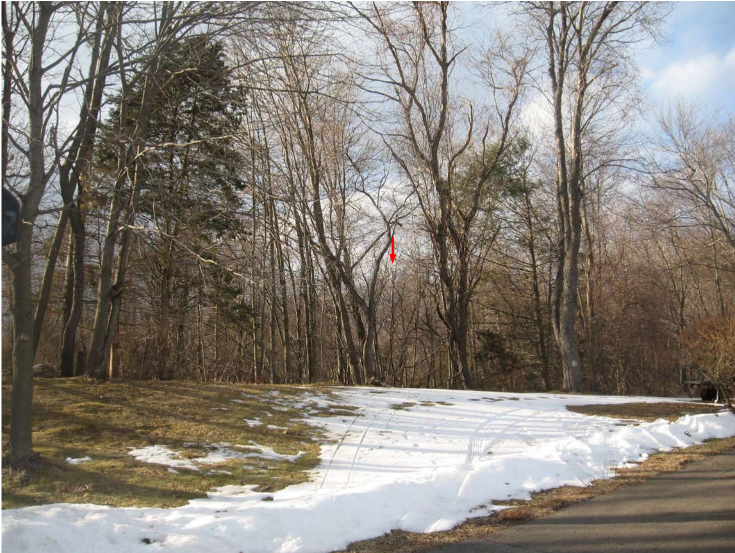
Photosim for conceptual purposes only - actual antenna and equipment locations to be determined based on final engineering design