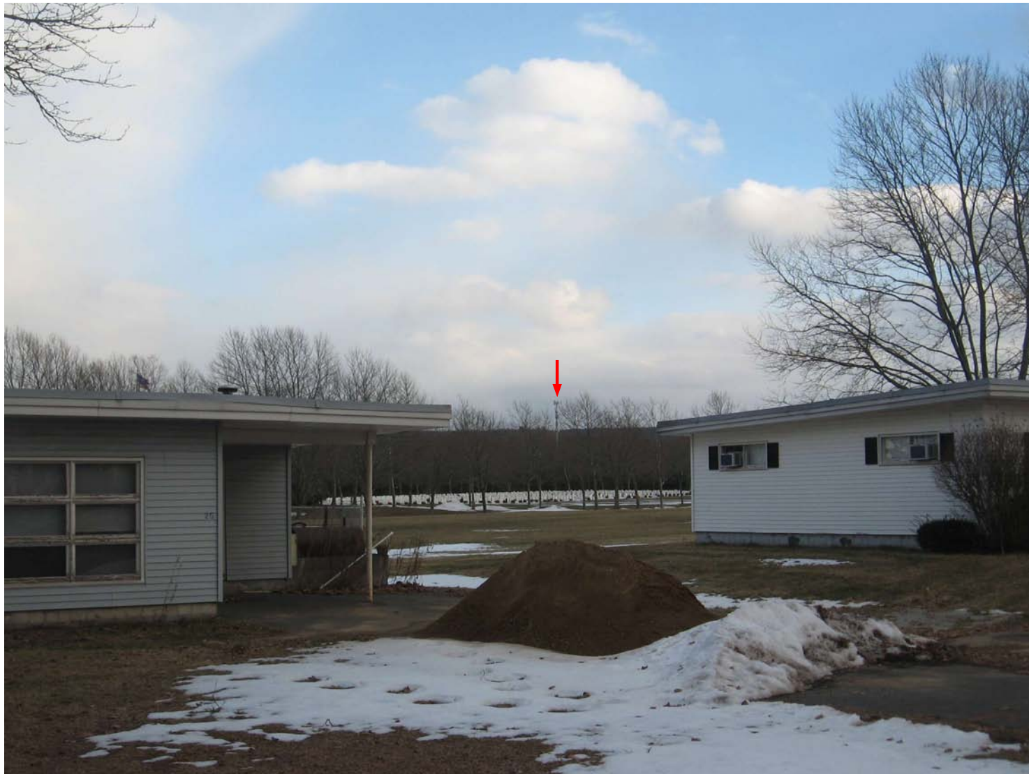
Photosim for conceptual purposes only - actual antenna and equipment locations to be determined based on final engineering design