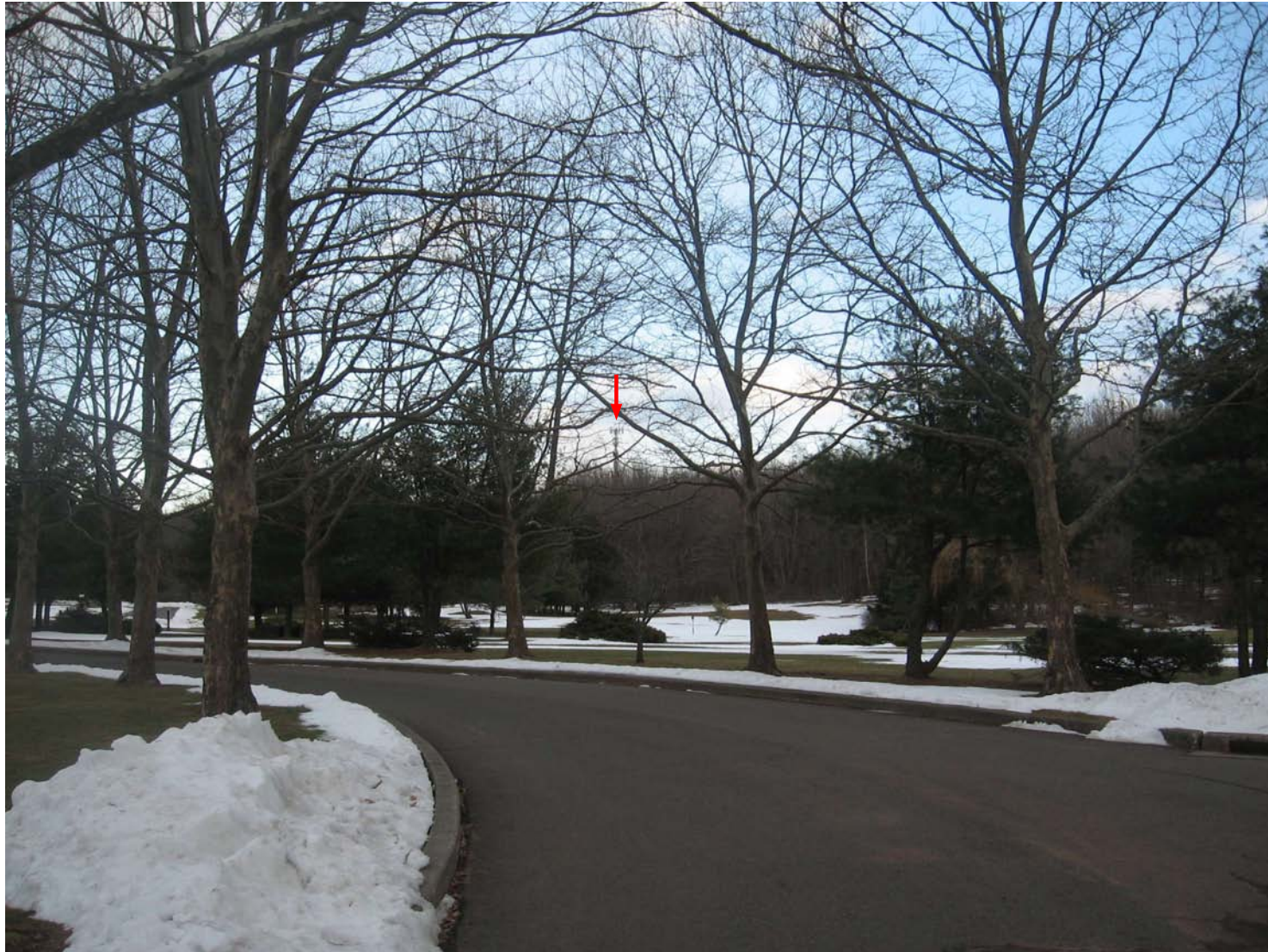
Photosim for conceptual purposes only - actual antenna and equipment locations to be determined based on final engineering design