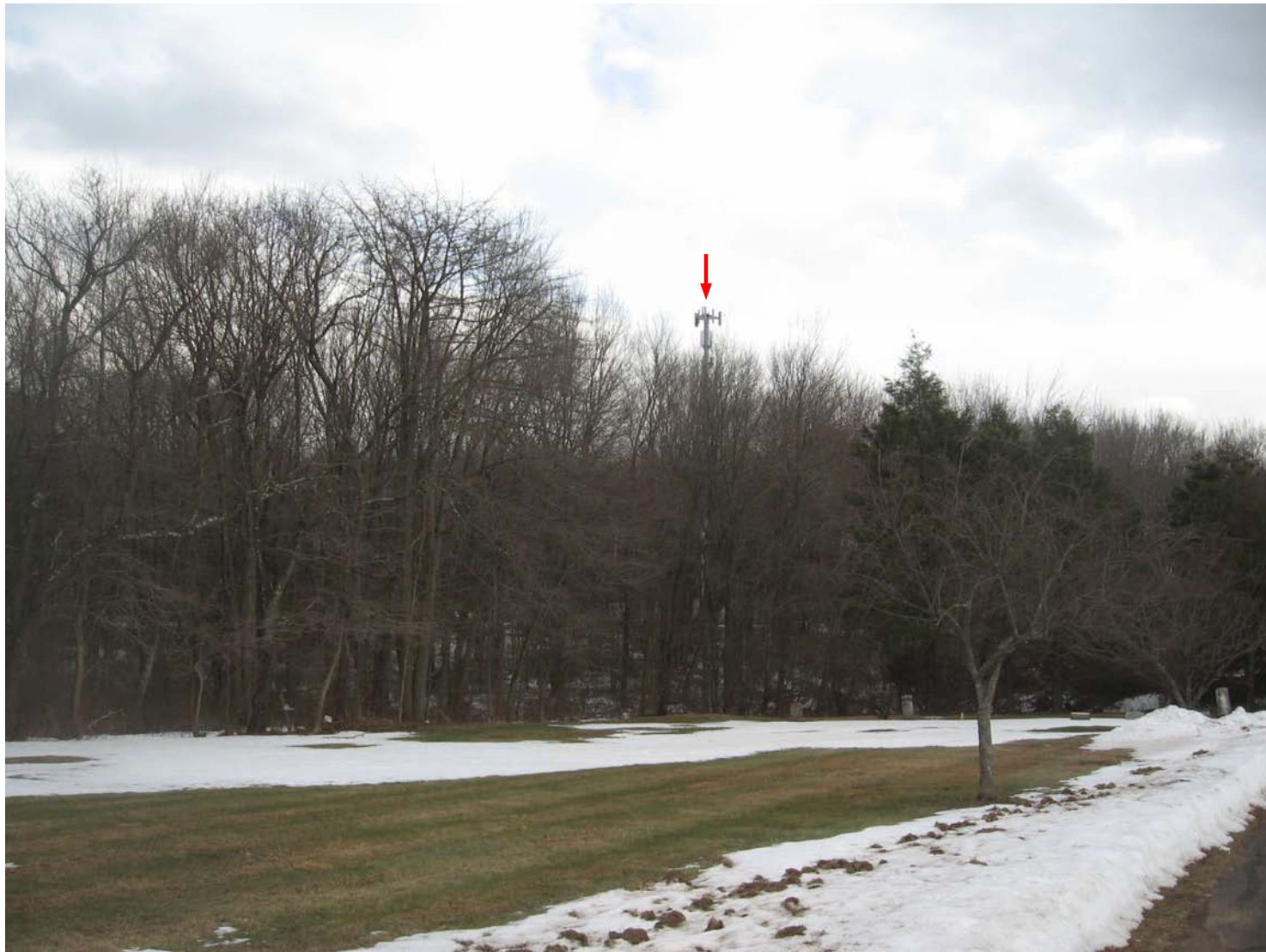
Photosim for conceptual purposes only - actual antenna and equipment locations to be determined based on final engineering design