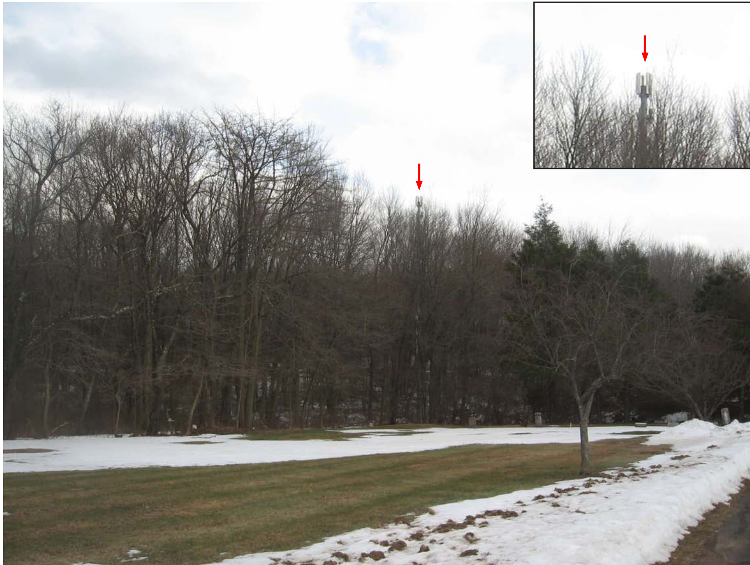
Photosim for conceptual purposes only - actual antenna and equipment locations to be determined based on final engineering design