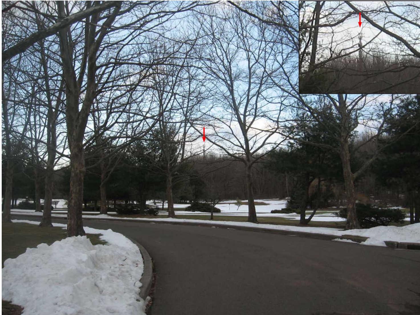
Photosim for conceptual purposes only - actual antenna and equipment locations to be determined based on final engineering design