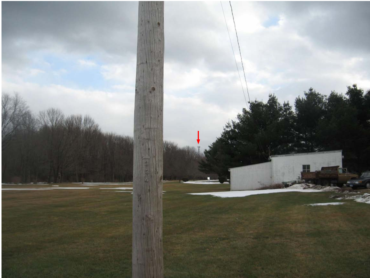
Photosim for conceptual purposes only - actual antenna and equipment locations to be determined based on final engineering design