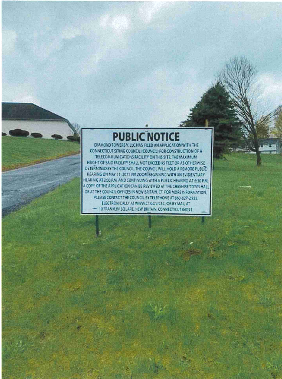
View of public notice sign posted at proposed facility access driveway at 185 Acadmy Road, Cheshire, CT.