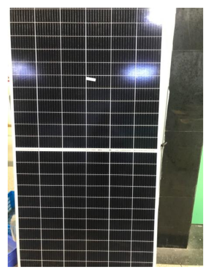
***End of report***

Report No.:SHE20-11364/1 Customer Reference: -