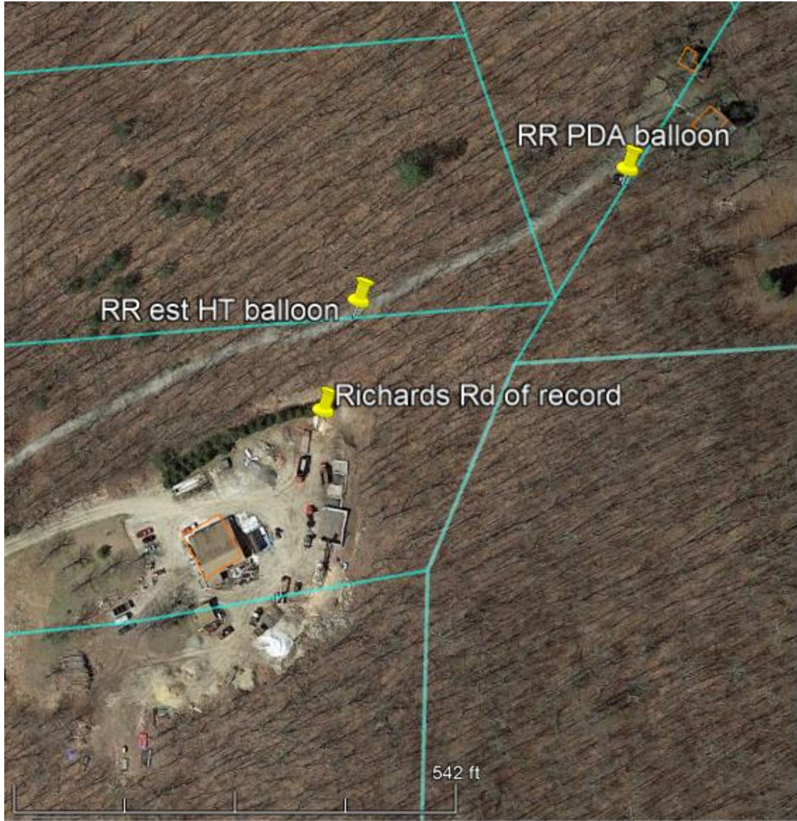
Here is a close-up of the Richards Rd site with the Homeland Towers (HT) and PDA balloon sites.