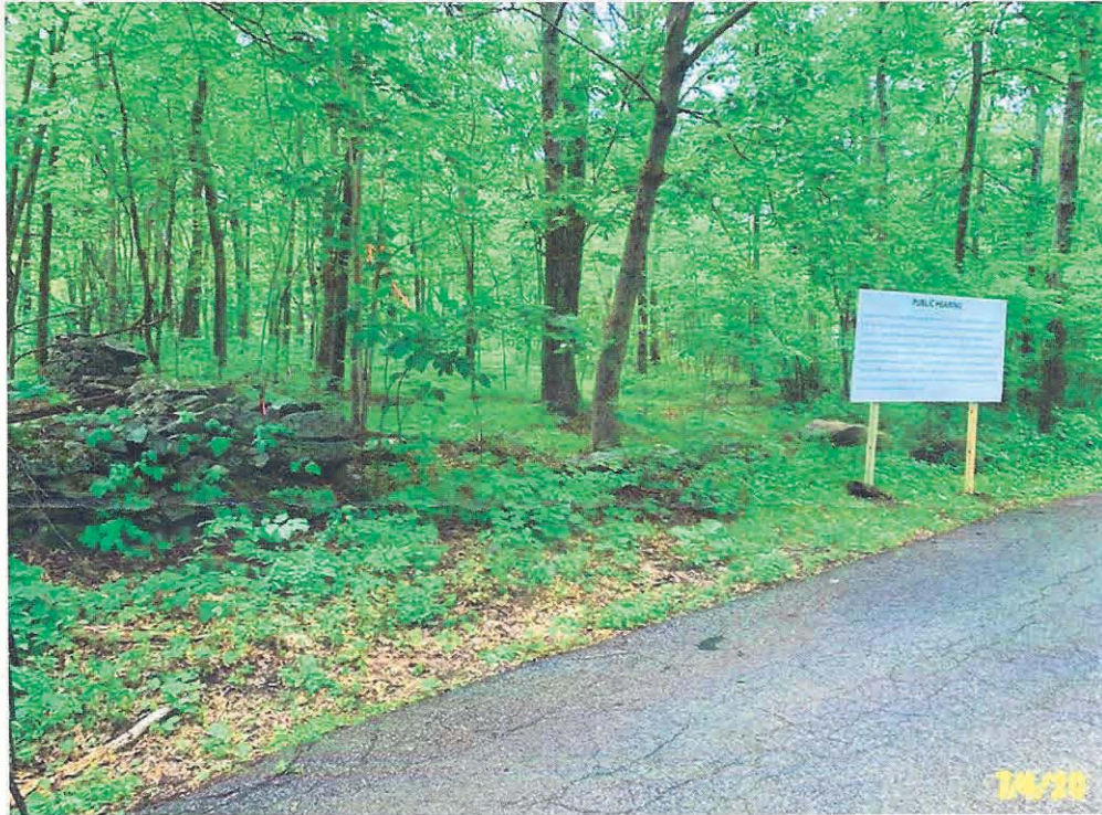
View of public notice sign content looking west from Bald Hill Road