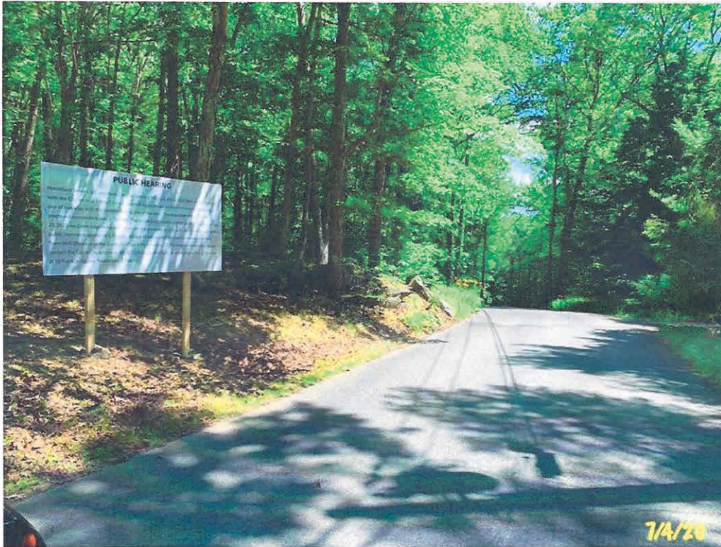
View of public notice sign content looking east from Richards Road