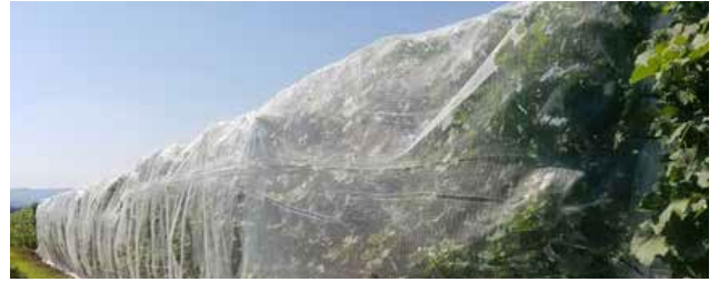
Figure 3. Exclusion netting (DrapeNet, Chazy, New York) used to protect vines from SLF. Note that this netting is tightly closed on the sides and bottom to prevent entry by SLF. County, Pennsylvania.

Placing circle traps around trees or banding trees with sticky tape can be useful monitoring tools for vineyards that have not yet detected SLF. However, use of traps is not a recommended control tactic around vineyards, as it is very unlikely to reduce the population. If using sticky bands, bycatch of nontarget insects (bees, butterflies, natural enemies, etc.), birds, and mammals (squirrels, bats, etc.) is likely. A wildlife barrier (e.g., window screening) should be built over the trap to prevent this bycatch. More details on trapping can be found on the Penn State Extension website.