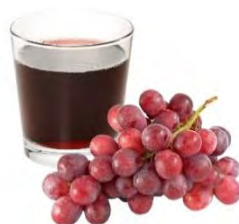
Table 4-5 shows a sample calculation for determining if a five-day lunch menu for grades 6-8 meets the weekly fruit juice limit.