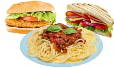
Table 4-6 shows the minimum weekly meal pattern requirements for the grains component and meat/meat alternates component at lunch. In July 2013, the USDA eliminated the maximum weekly requirements for the grains component and meat/meat alternates component. The lunch meal patterns still include the weekly maximums for each grade group to provide a guide for planning age-appropriate meals that meet the weekly dietary specifications for calories, saturated fats, and sodium. For information on planning school meals to meet the dietary specifications, see section 6.

Menu planners must consider the dietary specifications when serving larger amounts of the grains component and meat/meat alternates component. Menus that consistently offer larger amounts of these food components might exceed the weekly limits for calories, saturated fats, and sodium.