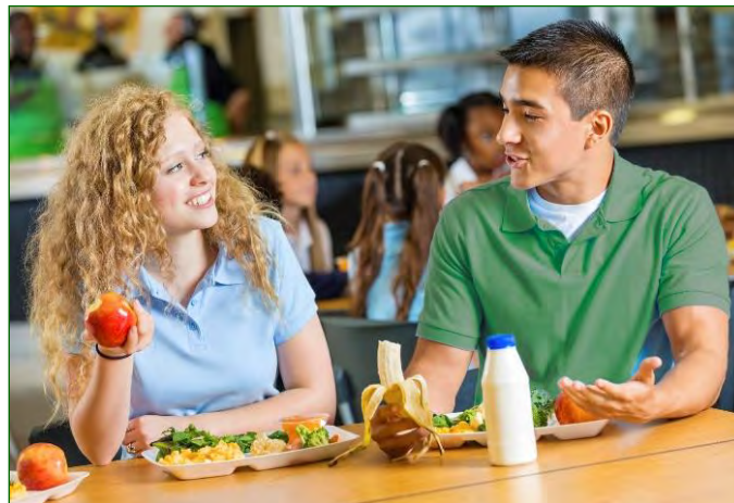
Table 4-8 shows examples of acceptable menu planning for grades 9-12. Weekly menu 1 offers the same ounce equivalents for each choice on an individual day, but varies the ounce equivalents between days. Weekly menu 2 offers different ounce equivalents for each daily choice. For this menu, the 2-ounce equivalent menu item counts toward the weekly requirements because it is the smallest choice offered each day.

The daily lunch menu for grades 9-12 may offer more than 2 ounce equivalents of grains and meat/meat alternates. However, menus that consistently offer larger amounts might exceed the weekly limits for calories, saturated fats, and sodium.