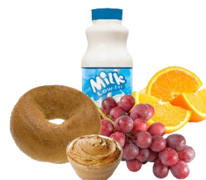
Table 1. OVS breakfast requirements for at-risk afterschool centers

Table 1 summarizes the requirements for OVS at breakfast.