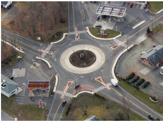
"Five Corners" Roundabout at Route 74 and Route 286 in Ellington, Connecticut.

"The new roundabout at the Five Corners is 'the greatest thing since sliced bread,' as they would say. I've been traveling through there daily since 1968 and traffic has never flowed more smoothly than it does now... I have never seen a back-up since the day they put the barrels up during construction."