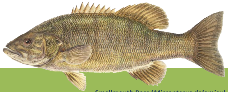
Smallmouth Bass ( Micropterus dolomieu )